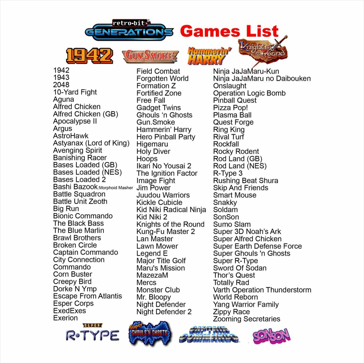
Image: A partial list of games available on the Retro-Bit Generations console, categorized by publisher. Titles such as "1942", "Gun.Smoke", "Knights Of The Round", and "R-Type" are visible, showcasing the variety of included retro games.

Select a game from the list and press the A button to launch it. The console is pre-loaded with over 90 popular retro games from various publishers. Refer to the game list image for a selection of included titles.