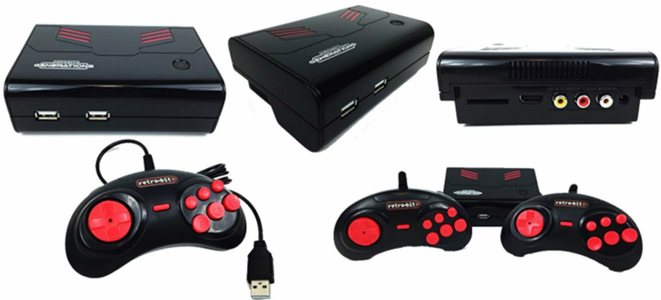
Image: A comprehensive view of the Retro-Bit Generations console and its accessories. It displays the console from different angles, two wired six-button controllers, and the necessary video and power cables, illustrating the complete package contents.