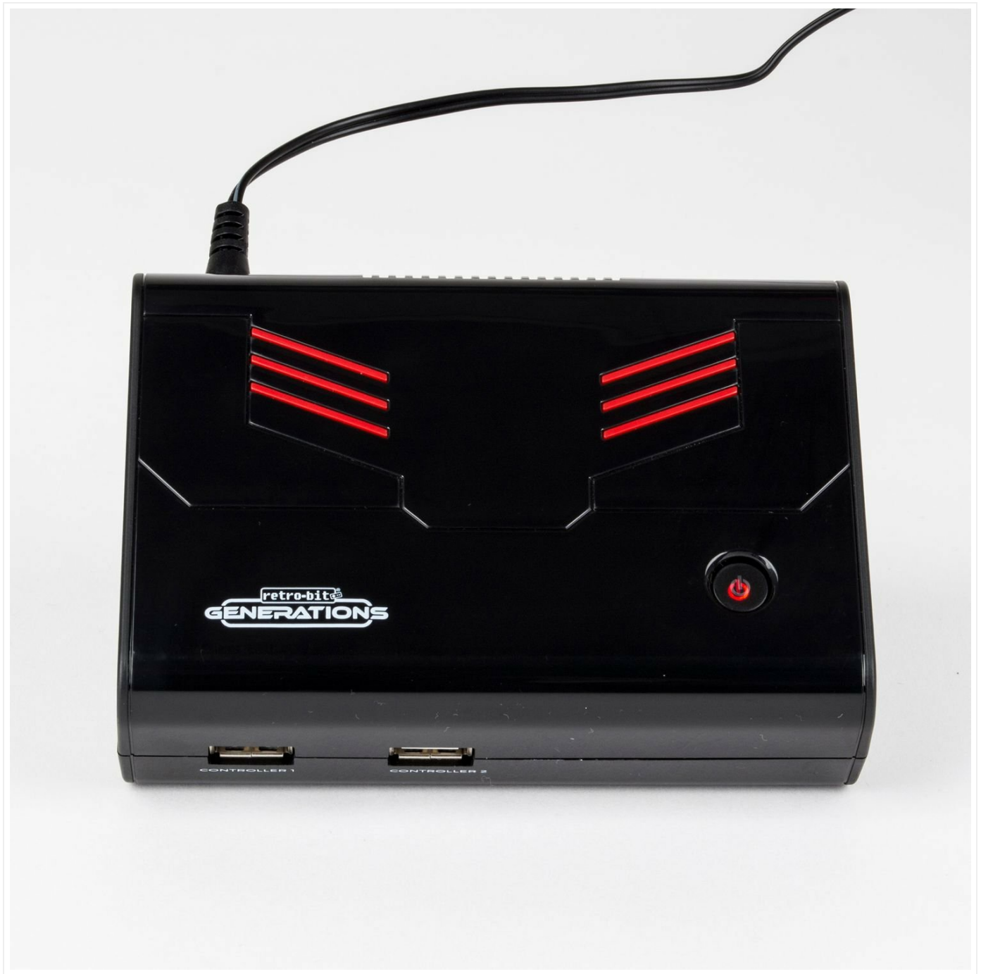
Image: A close-up top view of the Retro-Bit Generations console, highlighting the power button on the right and the two USB controller ports on the front. This image assists in identifying key connection points for setup.