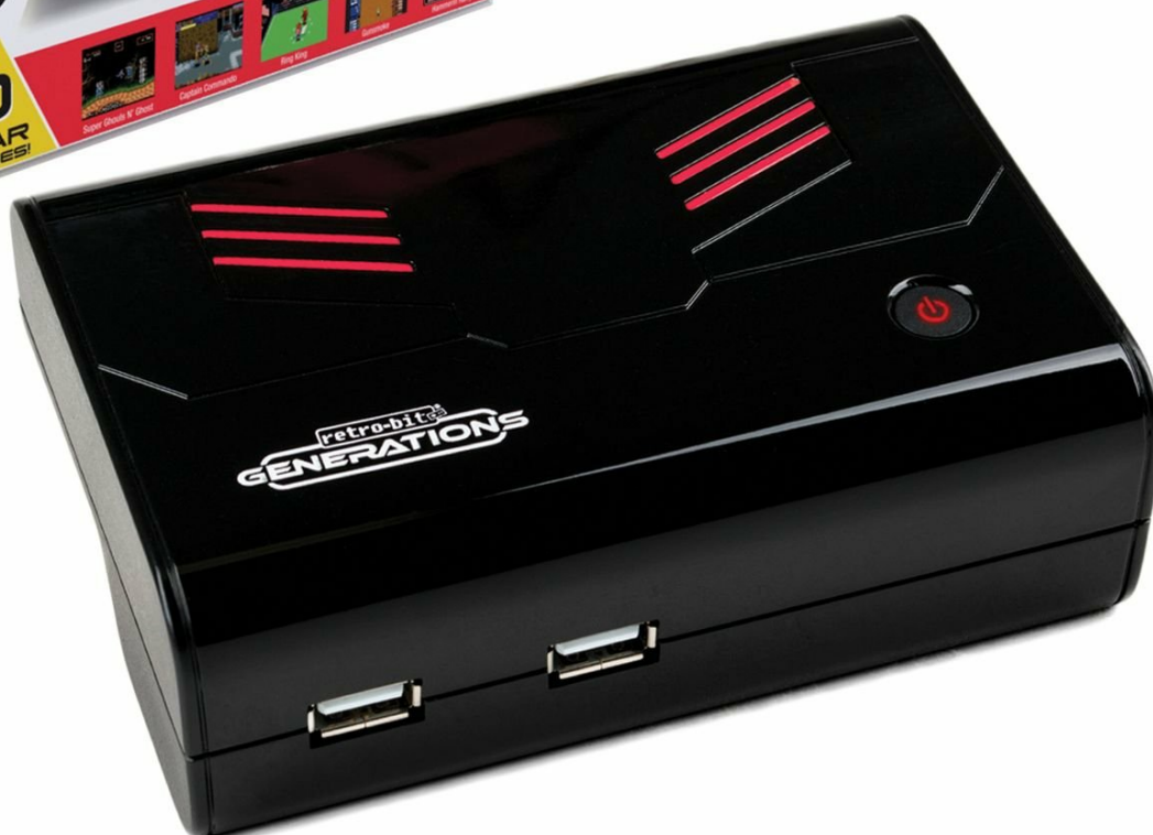
Image: The Retro-Bit Generations console, a black rectangular unit with red accents, is shown alongside its retail packaging. The box highlights "Packed with over 100 Popular Retro Games" and features various game characters.