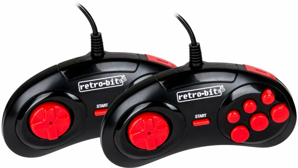
Image: A pair of black Retro-Bit Generations six-button controllers with red D-pads and action buttons. The controllers are wired and designed in a classic retro style, ready for two-player gaming.