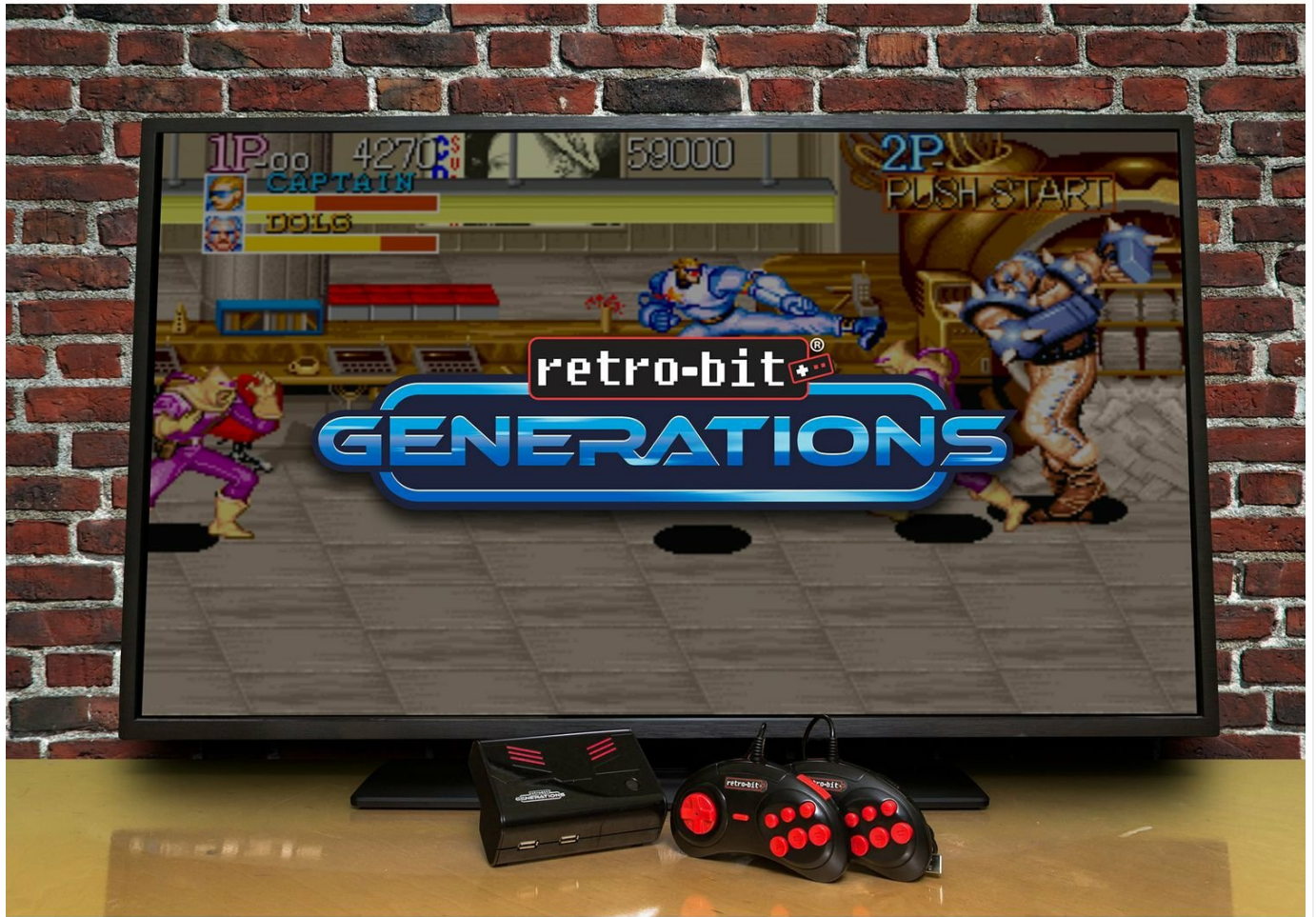
Image: The Retro-Bit Generations console is shown connected to a modern television, displaying gameplay from "Captain Commando". This illustrates the console's plug-and-play functionality and its ability to output to contemporary displays.