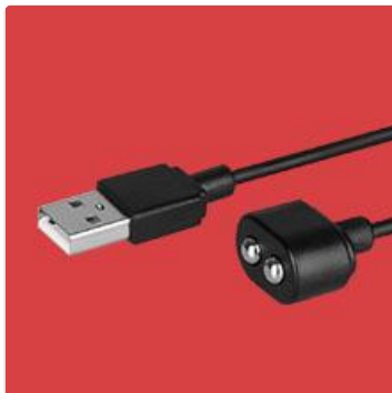
Image: The magnetic USB charging cable for the Satisfyer Double Classic.