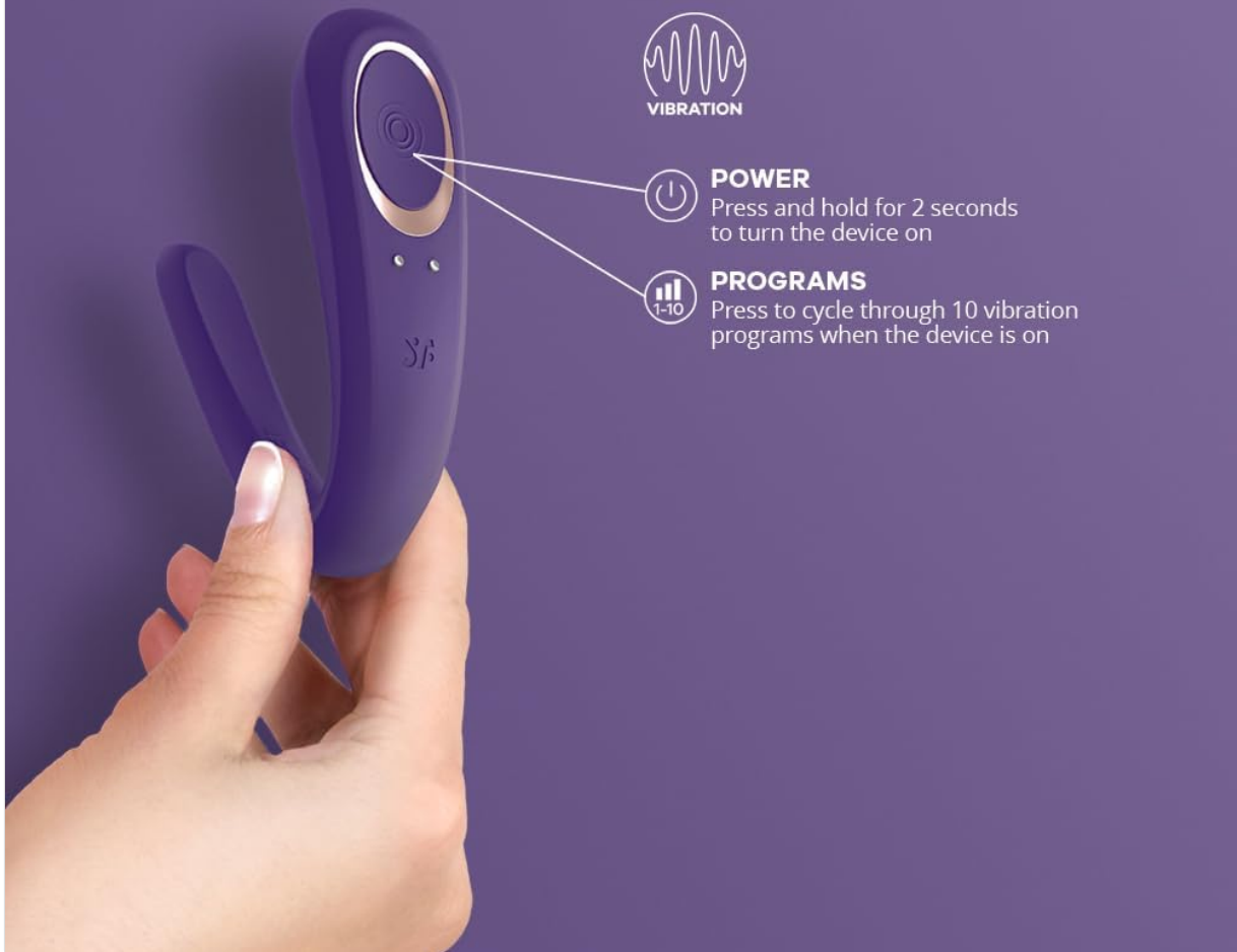
Image: The device with its power and program buttons clearly indicated.