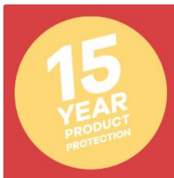
Image: Logo indicating the 15-year product guarantee.

The Satisfyer Double Classic is backed by a 15-year product guarantee , reflecting our commitment to quality and durability.