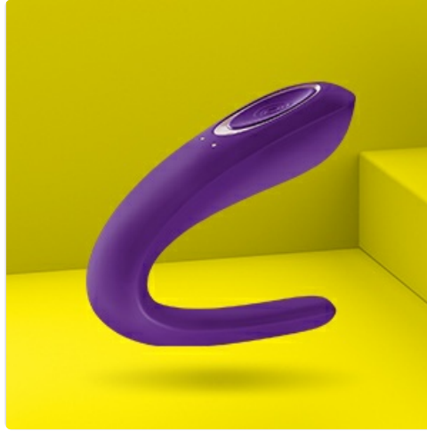
Image: A close-up view of the Satisfyer Double Classic Vibrator.

The Satisfyer Double Classic is a versatile vibrator designed to provide targeted stimulation for both solo and couple use. Its ergonomic shape and powerful vibrations are engineered for enhanced pleasure.