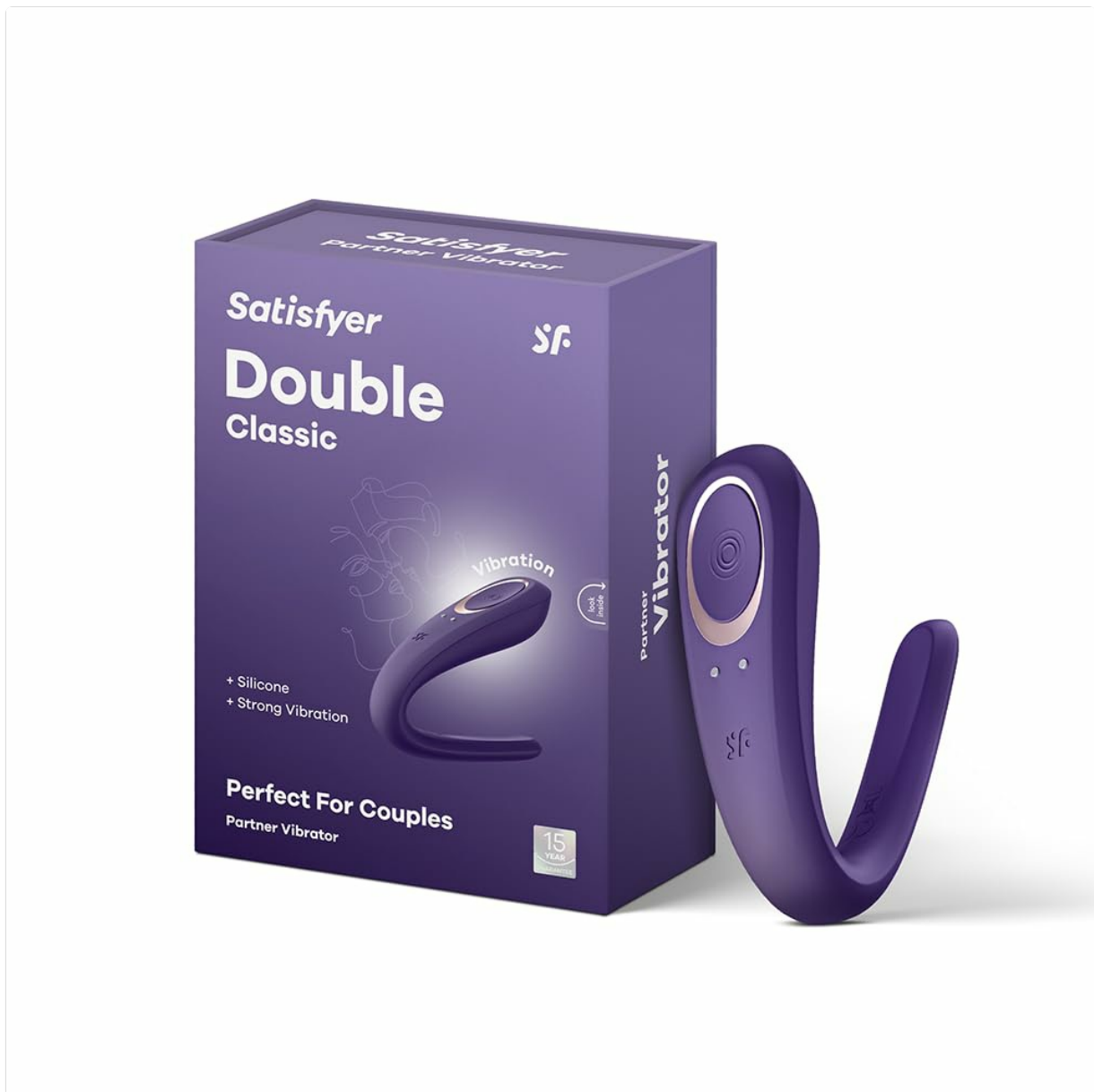
Image: The Satisfyer Double Classic Vibrator, showcasing its ergonomic design.