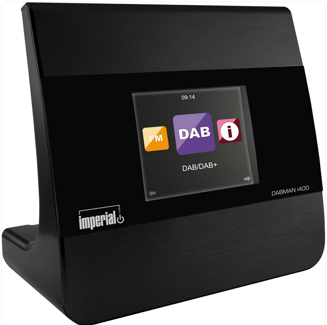
Image: The front of the Imperial DABMAN i400, showing its display and control buttons on the top edge.

The front of the DABMAN i400 features a clear 3.2-inch LCD display for navigation and information. Control buttons are located on the top edge of the device for easy access to functions like power, mode selection, volume, and station presets.