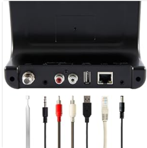
Image: Imperial DABMAN i400 with its power adapter, telescopic antenna, wire antenna, RCA cable, 3.5mm audio cable, and remote control.