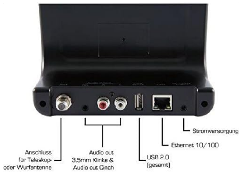
Image: The rear panel of the Imperial DABMAN i400, detailing its various connection ports. From left to right: Antenna connection (ANT), Audio output (RCA L/R and 3.5mm jack), USB 2.0 ports, Ethernet 10/100 (LAN), and Power supply (DC 5V/1A).