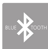
Image: Bluetooth connectivity icon.

To pair: Select Bluetooth mode on the DABMAN i400. On your external device, search for available Bluetooth devices and select 'DABMAN i400'.