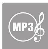
Image: MP3 music file icon.