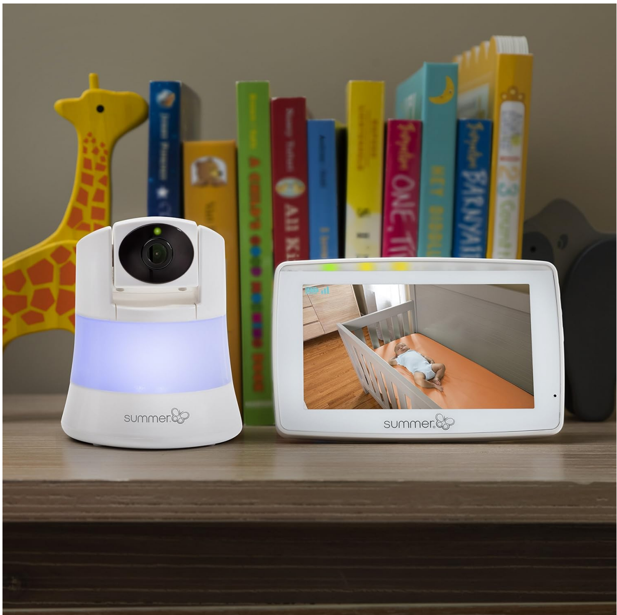
Image: The camera unit and parent unit placed on a shelf in a nursery setting.