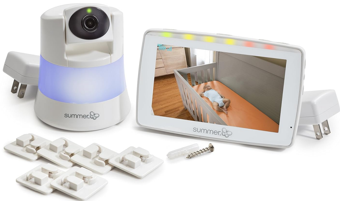
Image: Summer Infant Wide View 2.0 Monitor and Camera with included accessories.