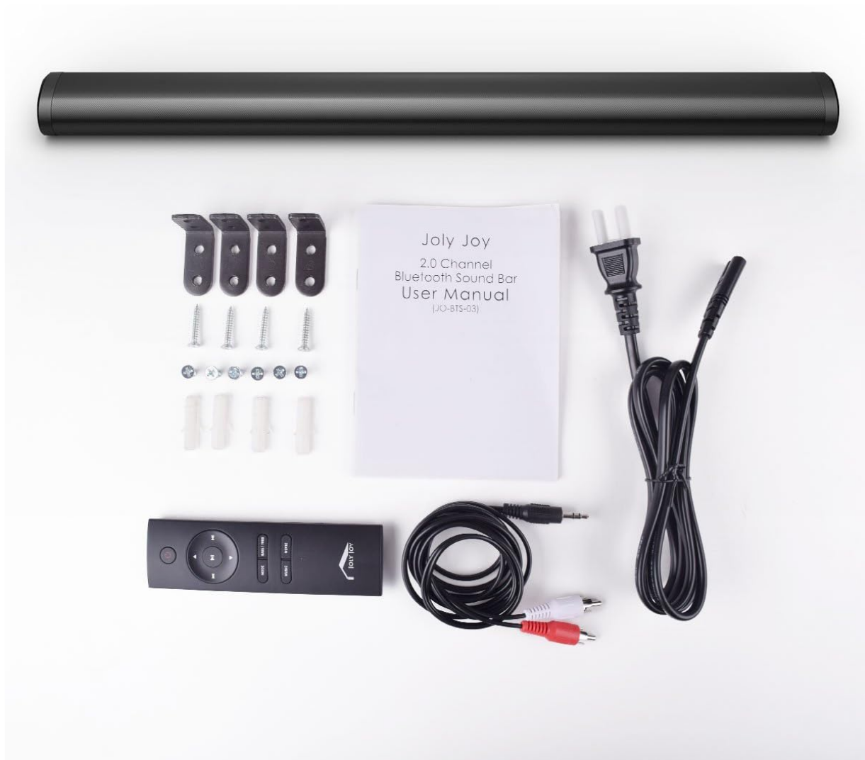
Image: All items included in the Joly Joy Soundbar package, laid out for inspection.