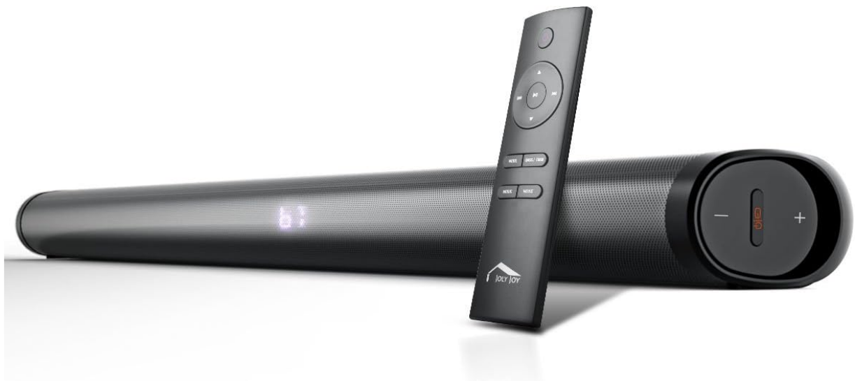
Image: The Joly Joy Soundbar with its remote control, showcasing its sleek design.

The Joly Joy JO-BTS-03-EU Soundbar is designed to enhance your audio experience with powerful stereo sound. It features multiple connectivity options, including wireless Bluetooth, AUX, Optical, Coaxial, and USB, ensuring compatibility with a wide range of devices such as TVs, smartphones, and tablets. The included remote control allows for convenient operation from a distance.