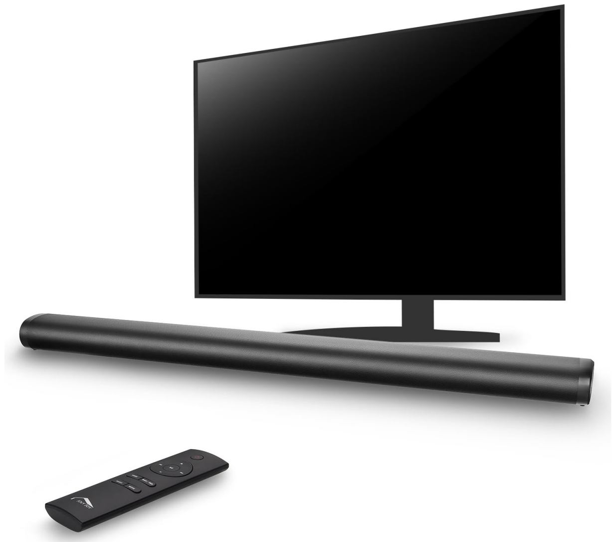
Image: The Joly Joy Soundbar positioned below a television, with the remote control in the foreground, illustrating a typical setup.