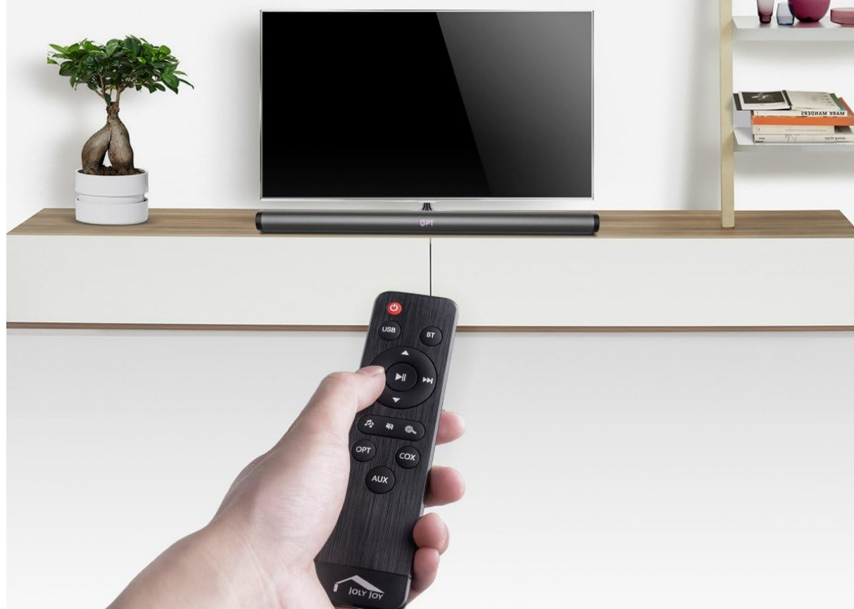
Image: The soundbar's LED display showing an input mode, with the remote control in the foreground.

With a front-panel display, you can easily know how high the volume is or what input you've selected