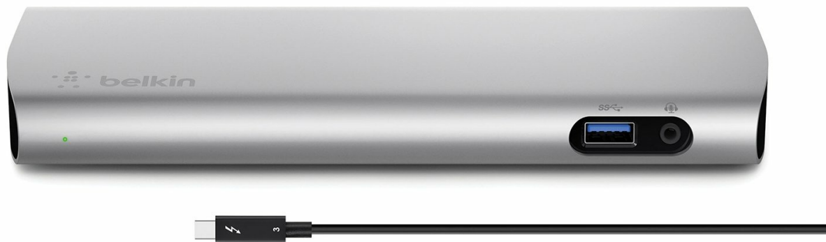
Figure 1: Front view of the Belkin Thunderbolt 3 Dock, showcasing its compact and modern design.