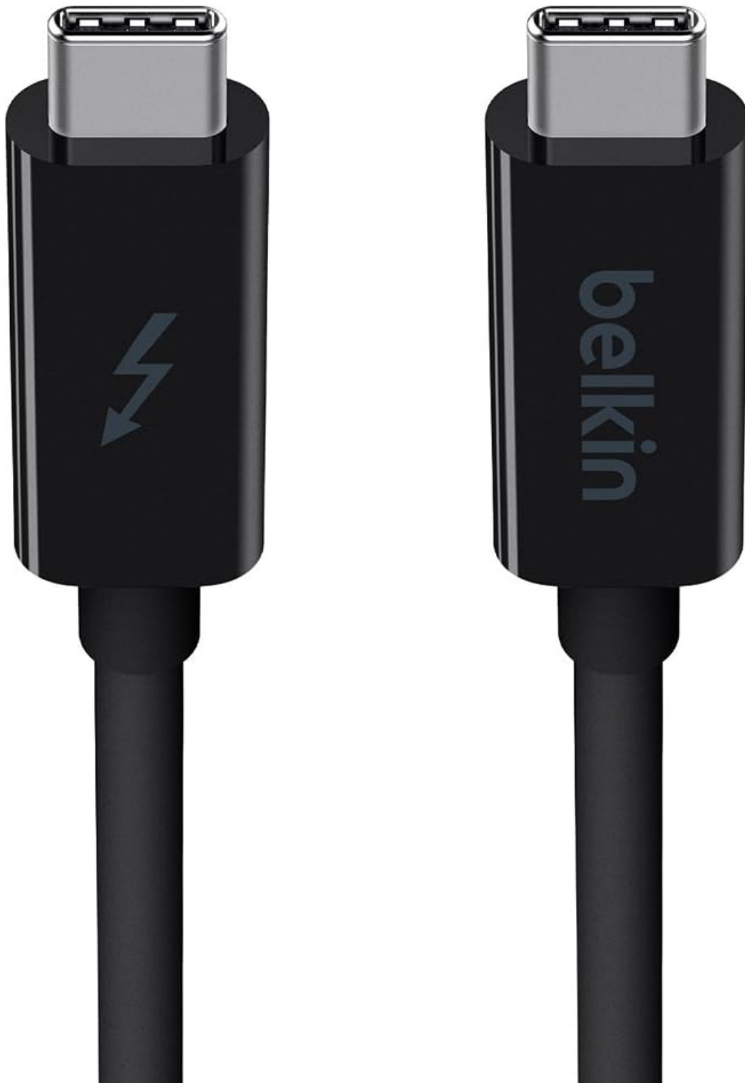
Figure 3: The included Thunderbolt 3 cable for connecting the dock to your computer.

Your browser does not support the video tag.