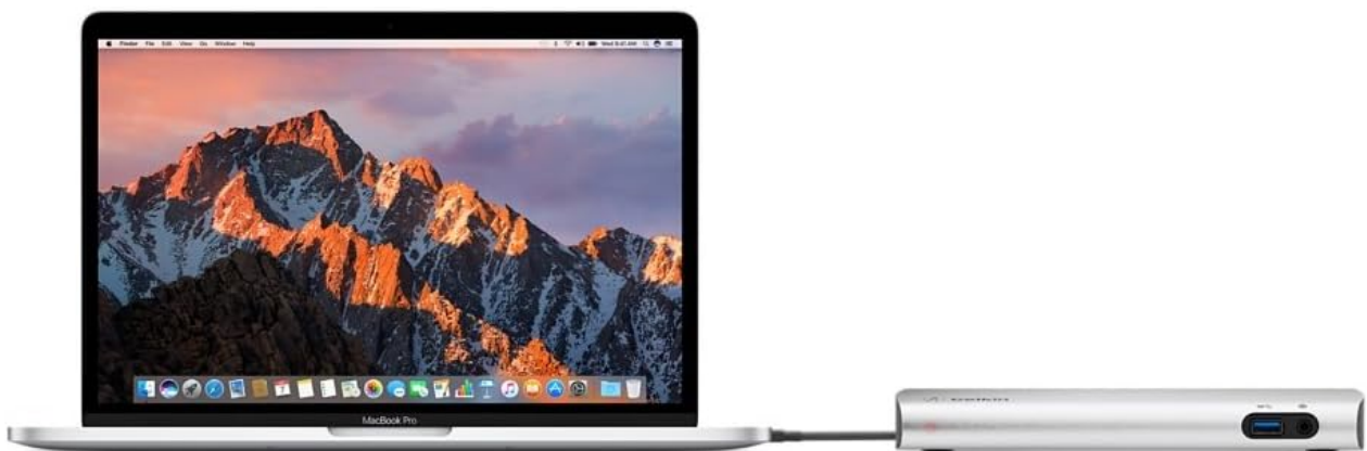
Figure 5: Visual representation of the dock supporting dual 4K displays.