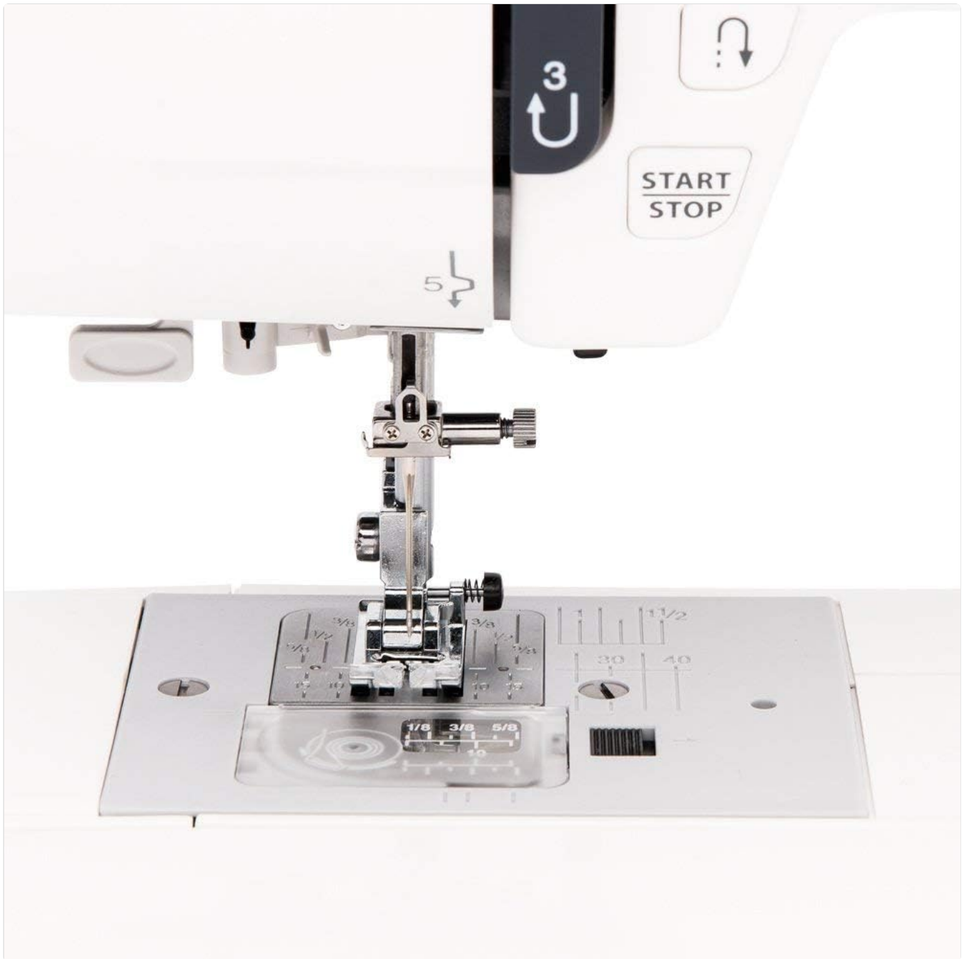
Image: The control panel of the Janome JW8100, showing the LCD screen and stitch selection buttons.