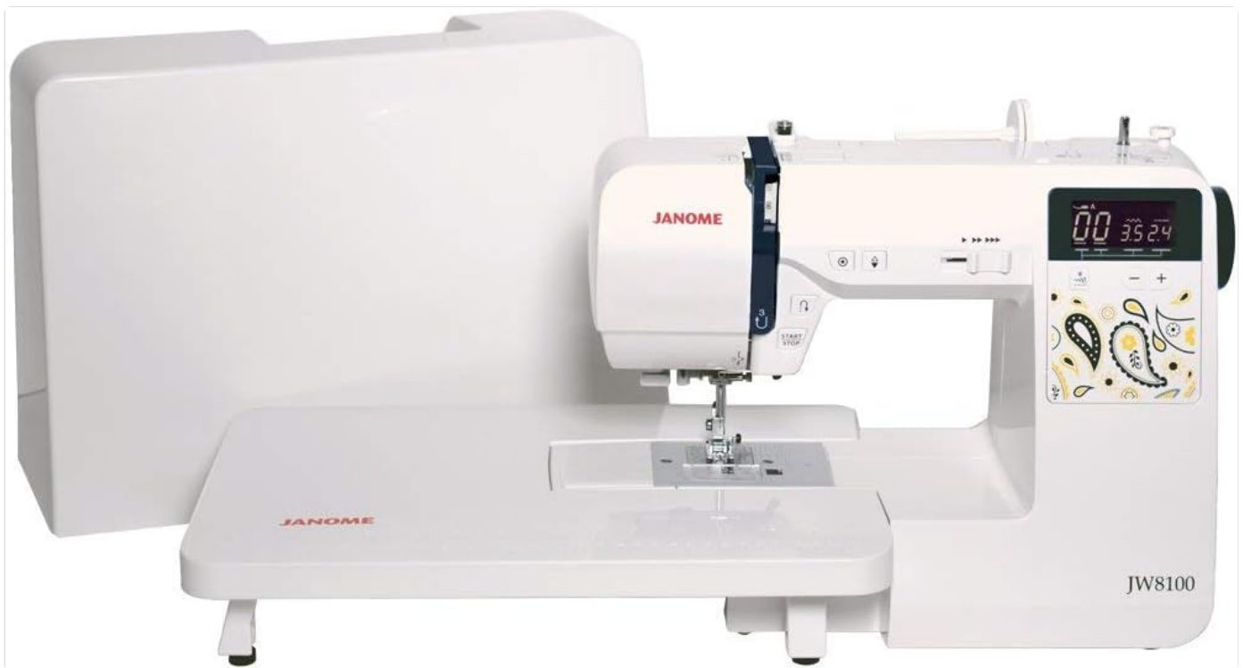
Image: The Janome JW8100 with its accessory compartment removed, revealing the free arm for circular sewing.