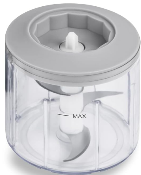
Image: The ADE Mini Electric Chopper KG2156 in use, demonstrating its ability to chop garlic and blend ingredients for a smoothie, highlighting the 300ml capacity container and sharp stainless steel blades.