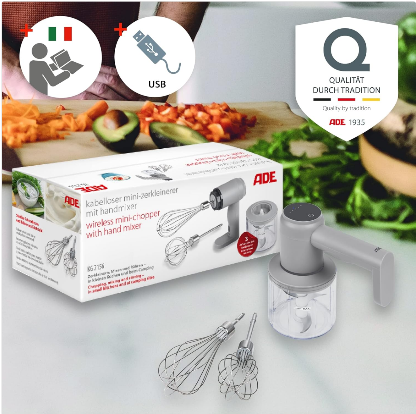
Image: All components of the ADE Mini Electric Chopper KG2156, including the main handle, transparent container, lid, blade unit, whisk, mixer, and USB charging cable, shown in their packaging.