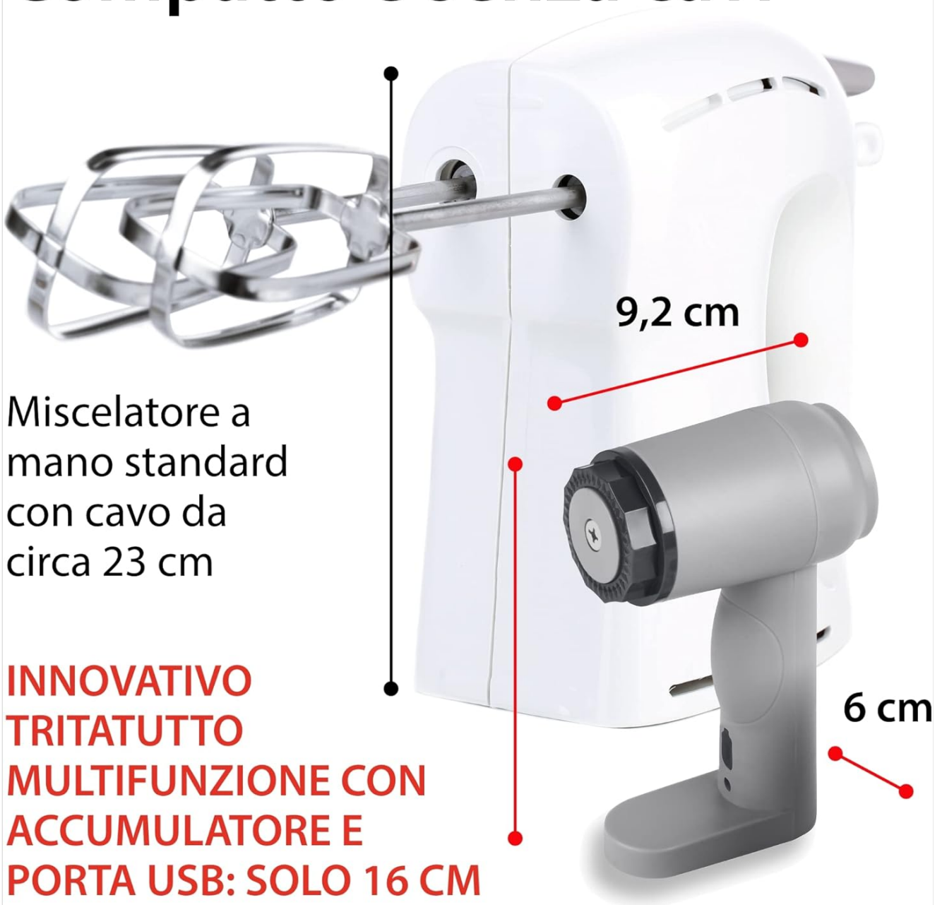
Image: Comparison of the compact ADE Mini Electric Chopper KG2156 with a standard corded hand mixer, illustrating its small size and cordless design.