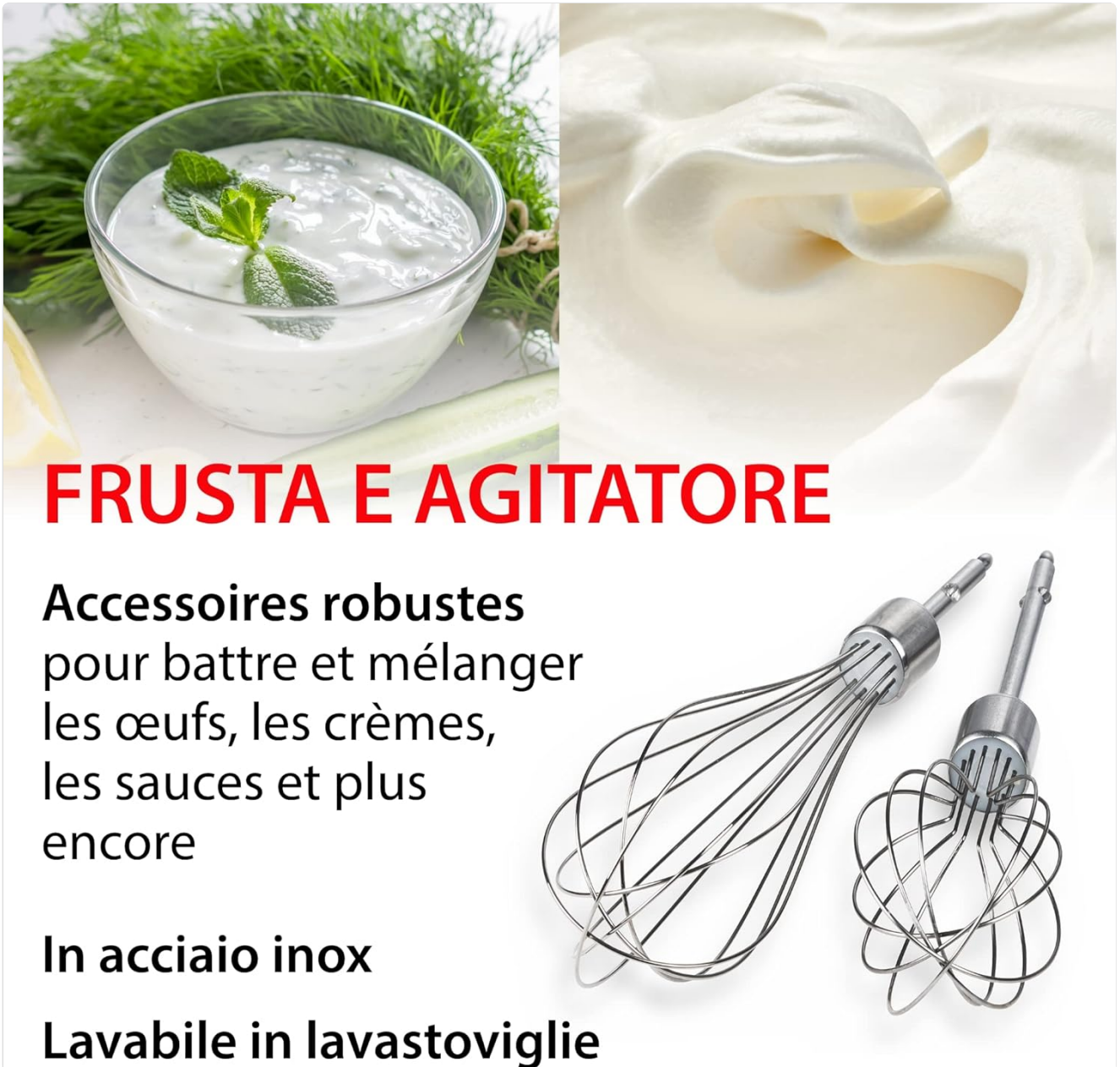
Image: The stainless steel whisk and mixer attachments for the ADE Mini Electric Chopper KG2156, designed for beating eggs, whipping cream, and mixing sauces.

3. Ensure the attachment is firmly secured before use.