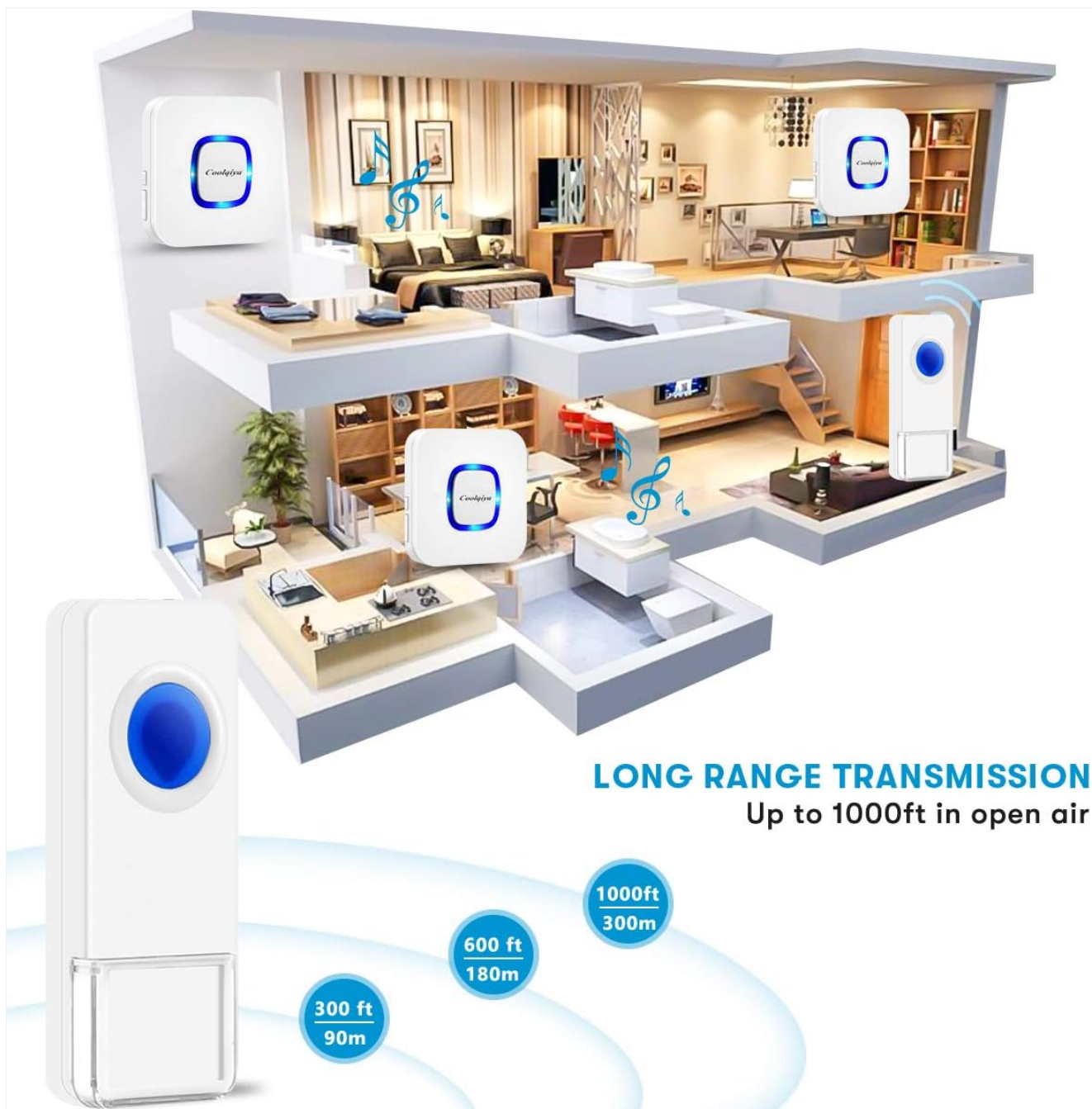
Image 8: Visual representation of the doorbell's long-range transmission.