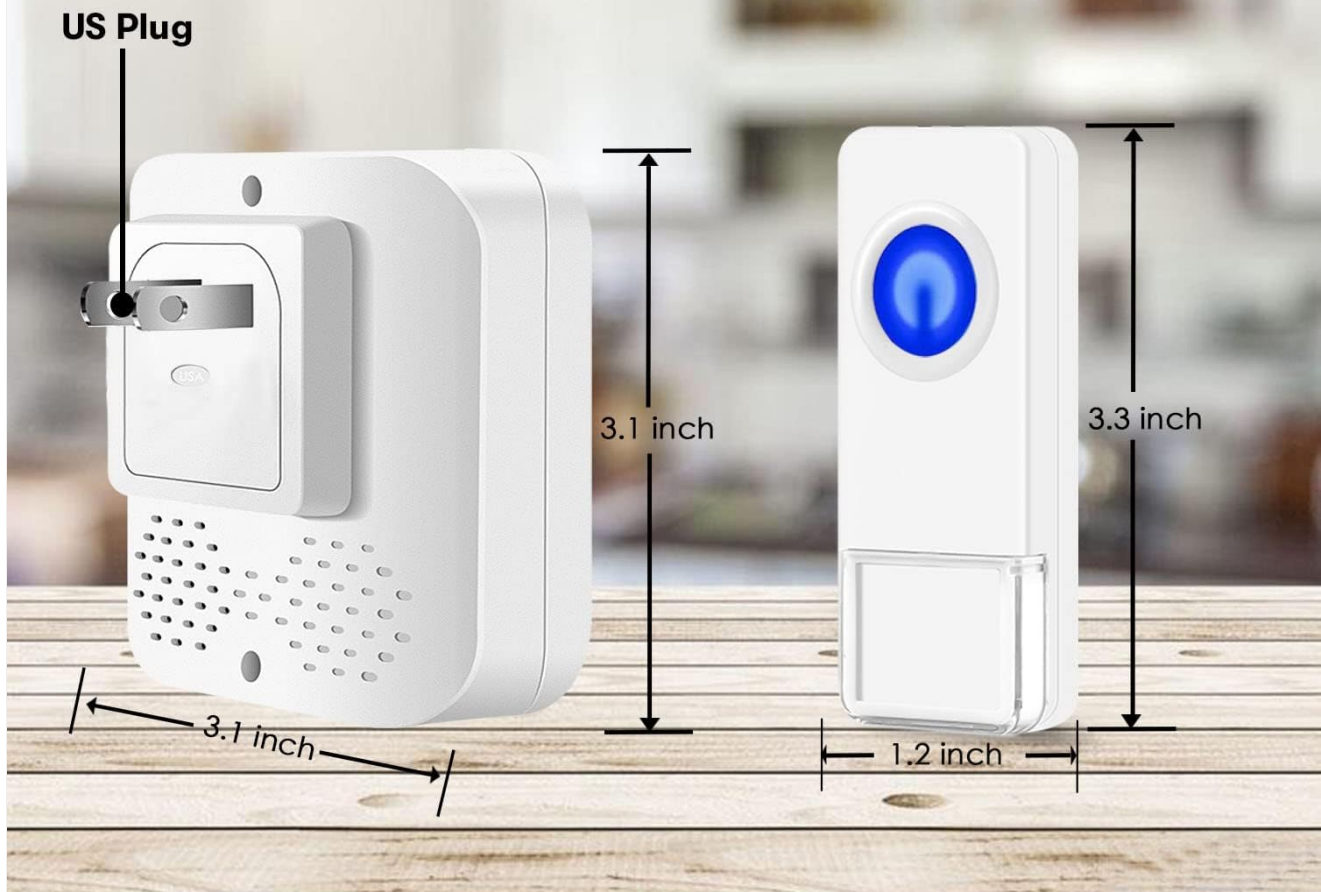
Image 5: Compact design of the receiver and transmitter, showing US plug.