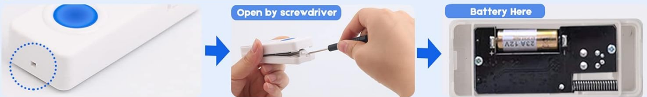
Image 3: Transmitter installation methods and battery replacement steps.