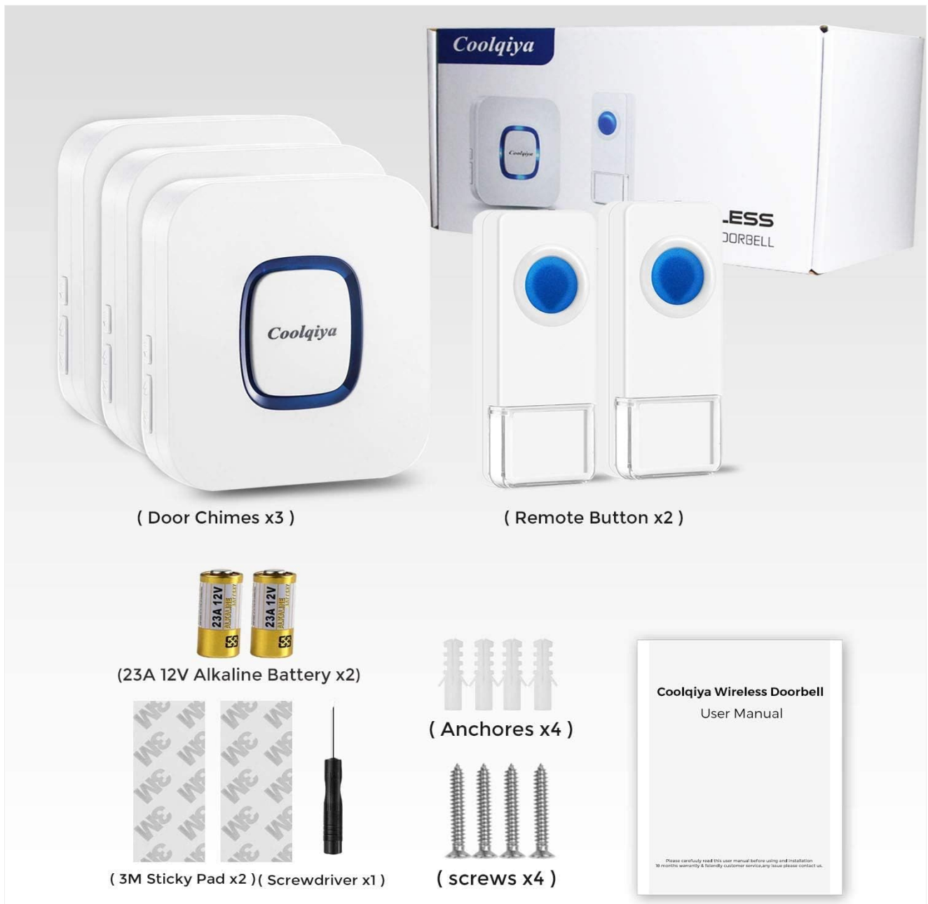
Image 2: All components included in the Coolqiya Wireless Doorbell Kit.