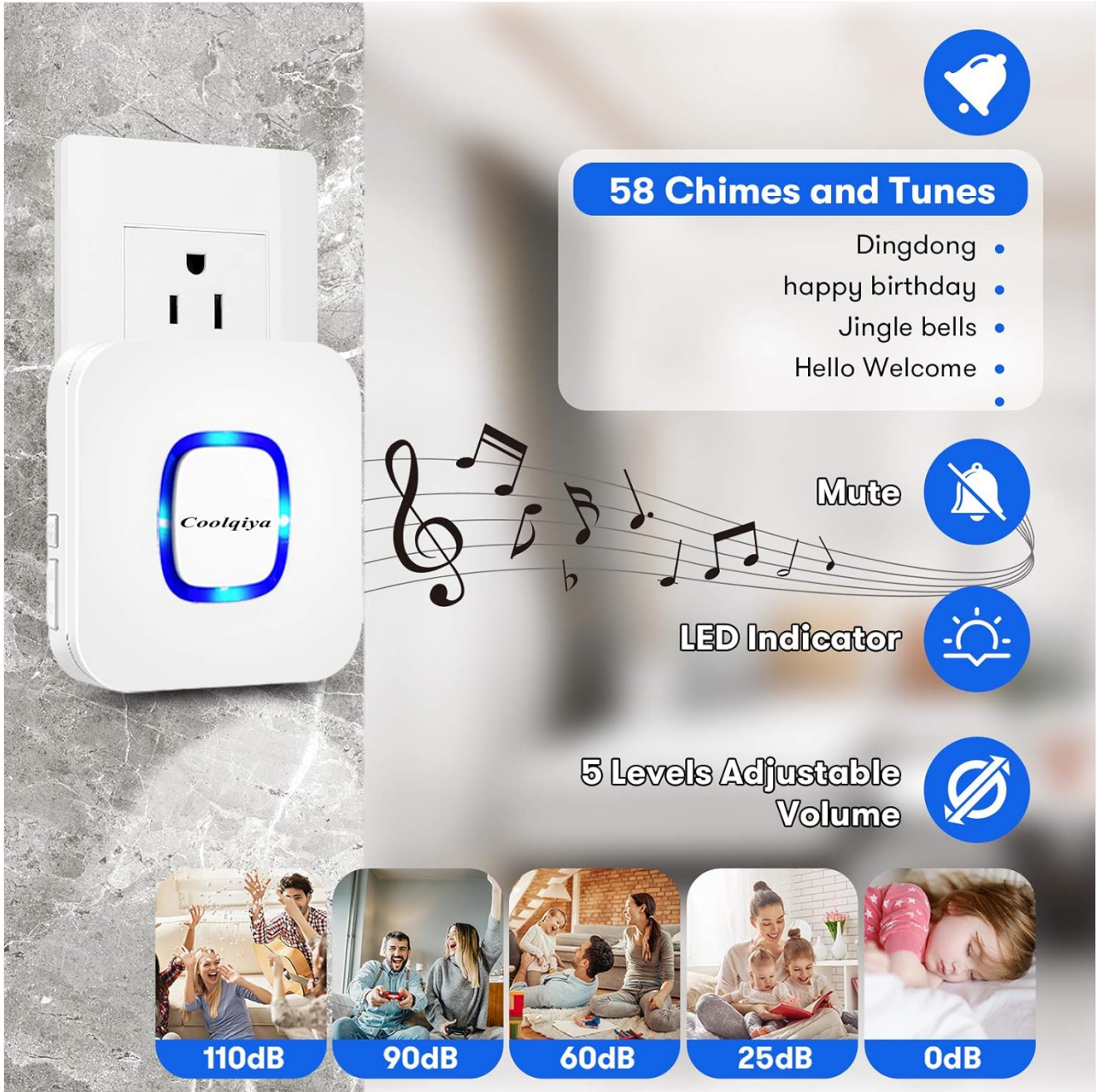
Image 6: Features of the receiver, including melody selection, volume control, and LED indicator.

When the doorbell is pressed, the receiver will not only play the selected melody but also flash a blue LED light. This feature is particularly useful for individuals with hearing impairments.