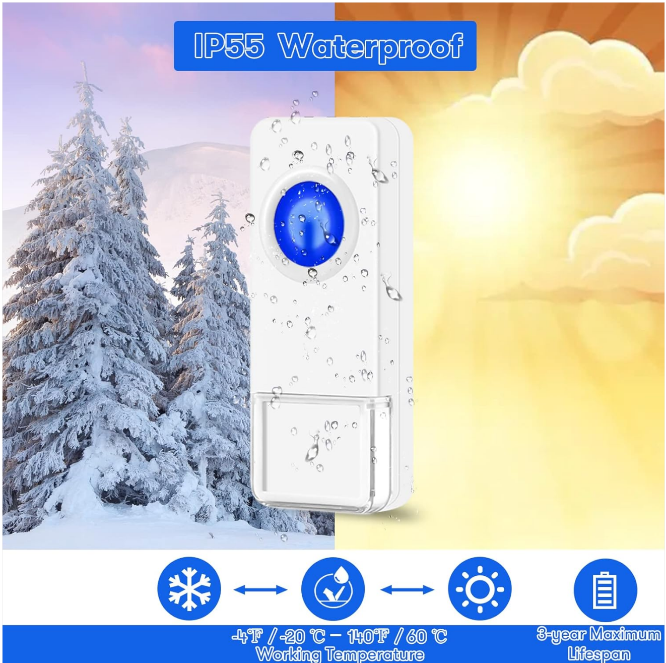
Image 9: The transmitter's IP55 waterproof rating and operational temperature range.

The transmitter has an IP55 waterproof rating, meaning it is protected against dust ingress and low-pressure water jets from any direction. While it is designed for outdoor use, avoid submerging it in water or exposing it to heavy, direct water streams for extended periods.