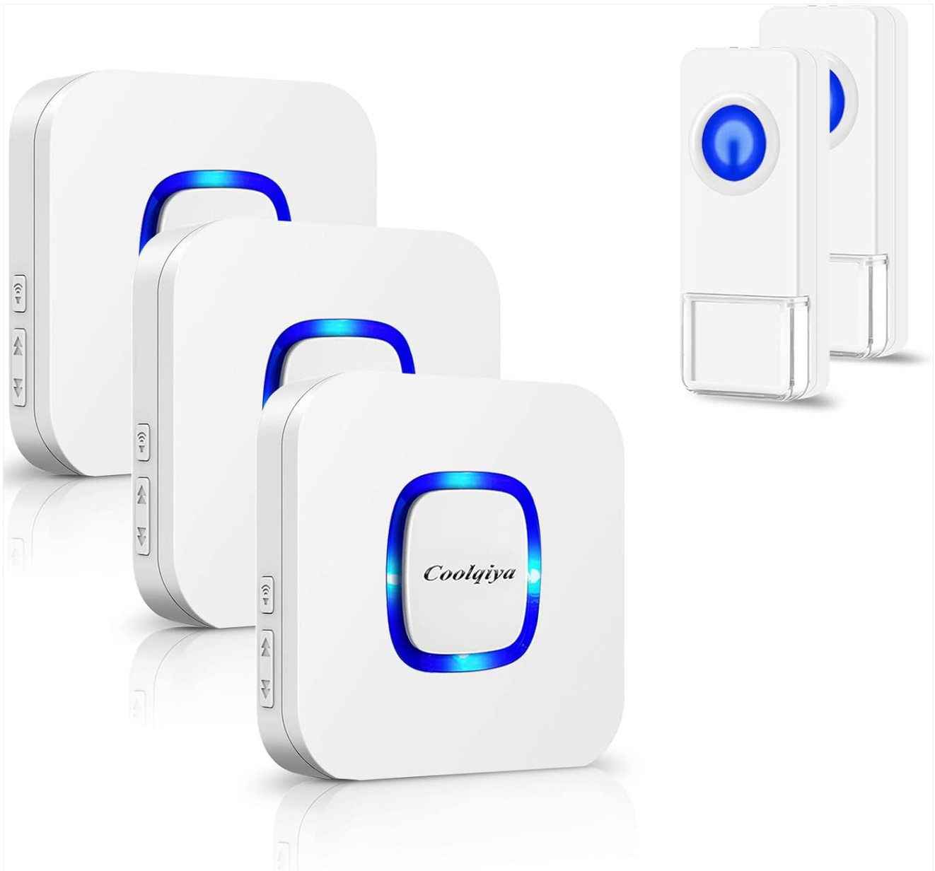
Image 1: Overview of the Coolqiya Wireless Doorbell Kit components.