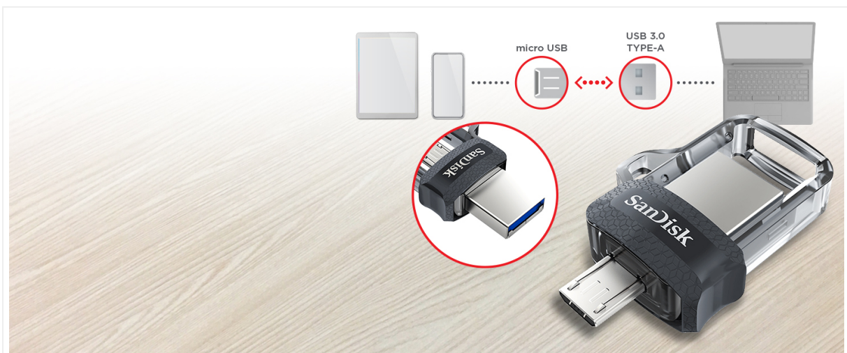
Image: Retractable Design. This image highlights the 2-in-1 retractable design of the drive, which allows users to slide out either the micro-USB or USB 3.0 connector as needed, protecting the unused connector.

The drive's retractable mechanism protects the connectors when not in use. It also includes a keyring hole for easy portability.