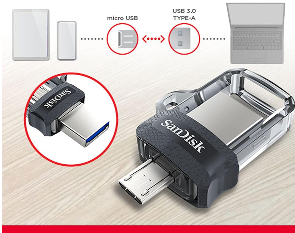
Image: Dual micro-USB and USB 3.0 Connectors. This image illustrates the two types of connectors available on the SanDisk Ultra Dual Drive m3.0: a micro-USB connector on one side and a USB 3.0 Type-A connector on the other, allowing connectivity with various devices.

The drive's retractable mechanism protects the connectors when not in use. It also includes a keyring hole for easy portability.