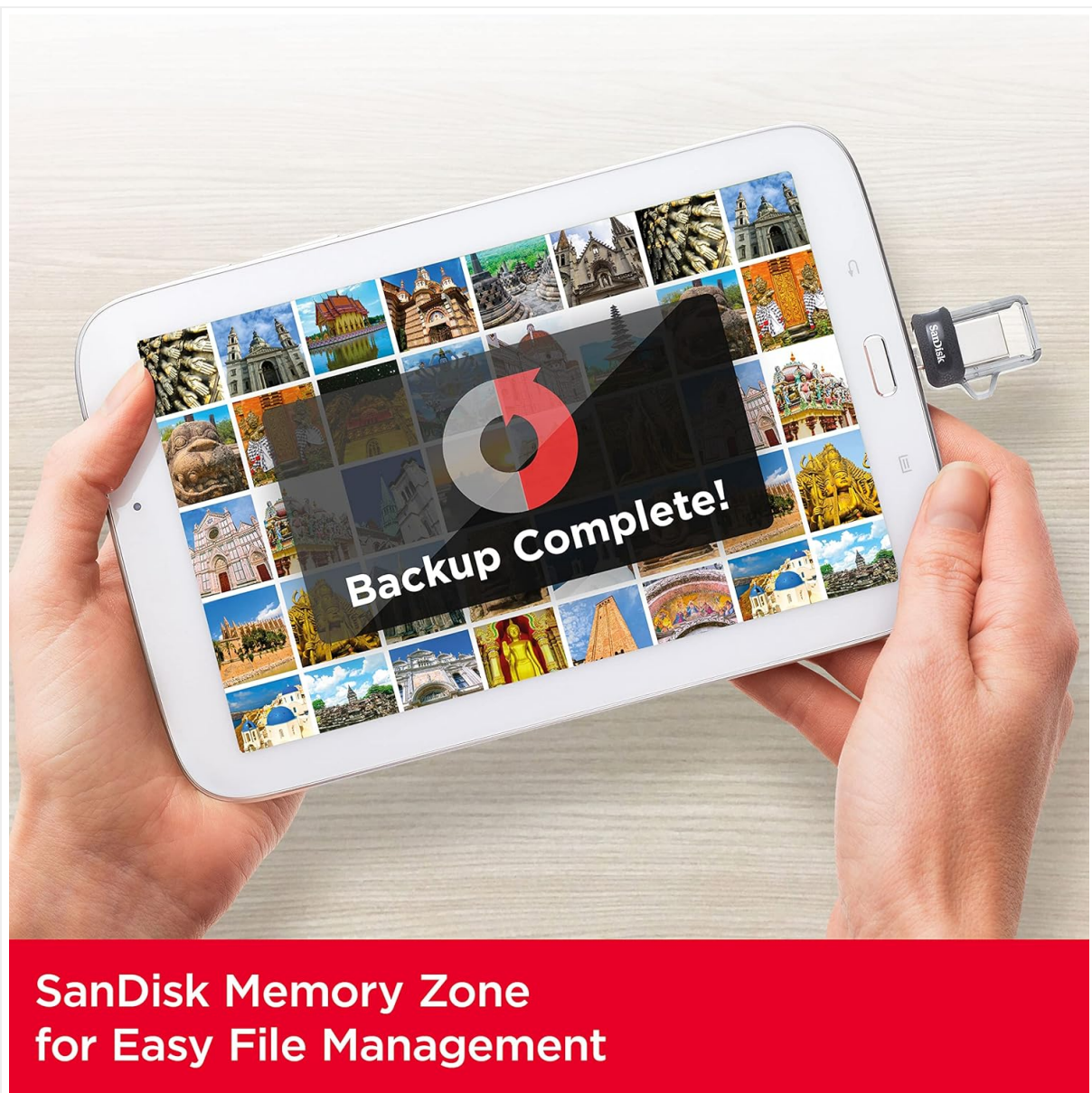
Image: Backup Complete. This image shows a tablet screen displaying 'Backup Complete!' with the SanDisk Ultra Dual Drive m3.0 connected, demonstrating the successful use of the SanDisk Memory Zone app for data backup.