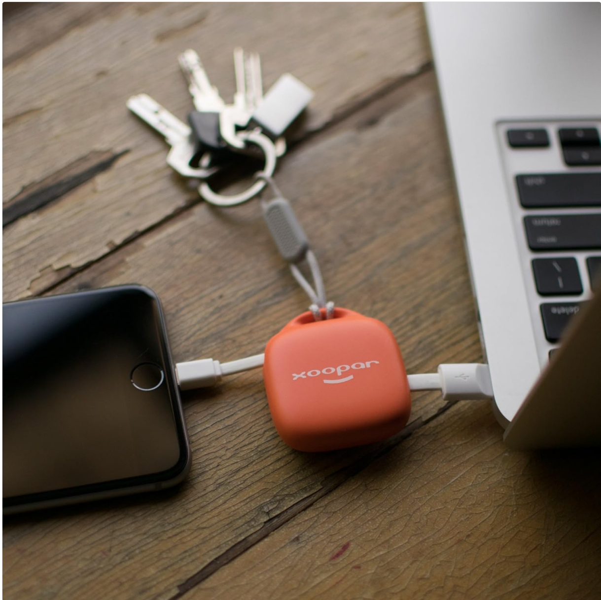
Image: The Xoopar HUG Power Bank, attached to a keychain, connected to both an iPhone and a laptop. This demonstrates its portability and convenience for charging devices while on the go or at a workstation.