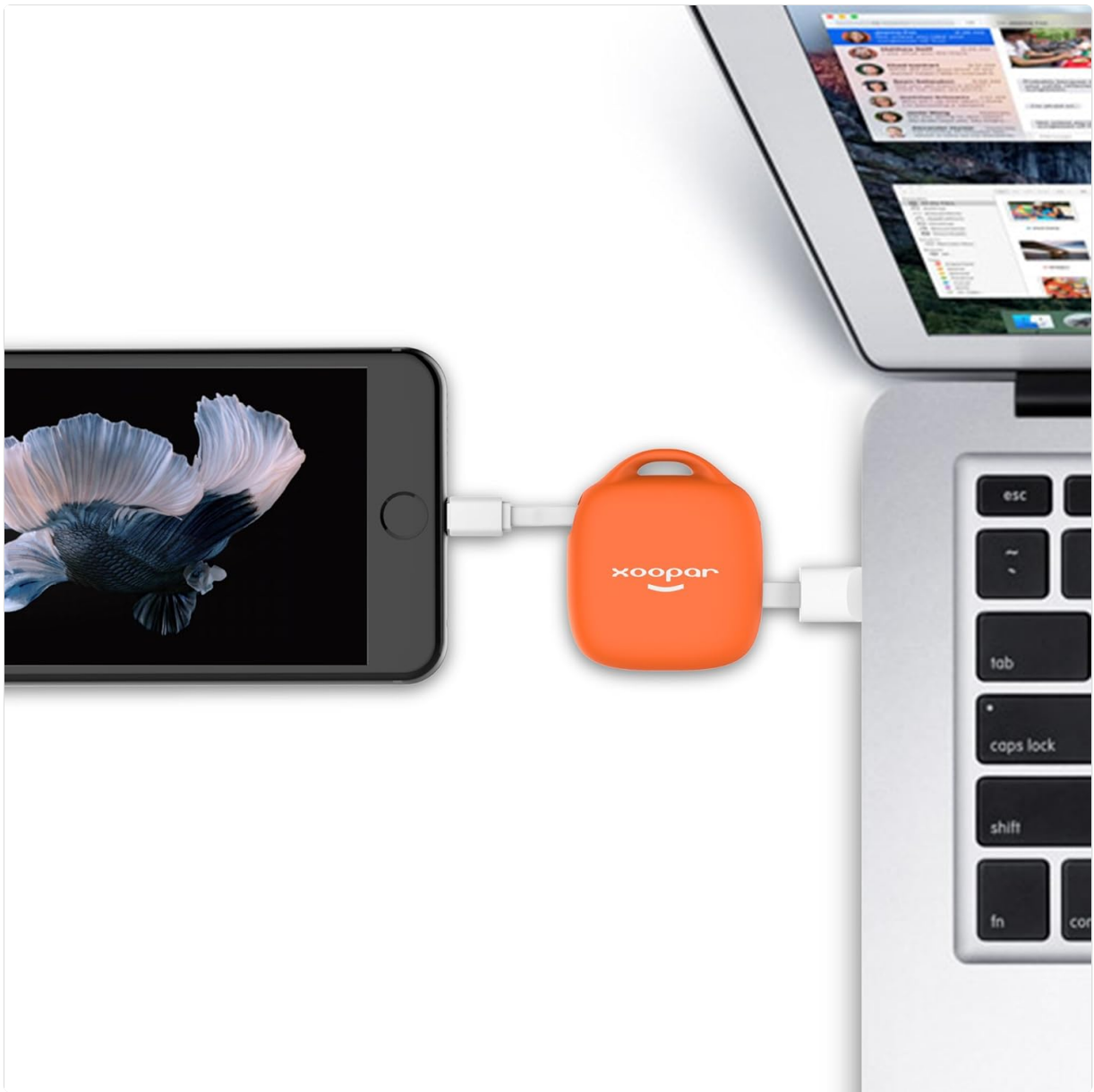
Image: The Xoopar HUG Power Bank acting as a bridge, connecting an iPhone to a laptop's USB port. This illustrates the pass-through charging capability, allowing both devices to be charged simultaneously.