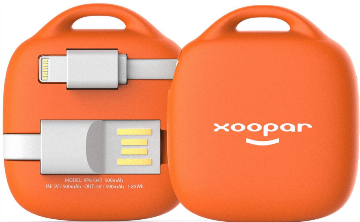
Image: A detailed view of the Xoopar HUG Booster Power Bank, displaying both its front and back. The image clearly shows the integrated Micro USB and Lightning connectors, along with the model number (XP61047) and electrical specifications (IN: 5V / 500mAh, OUT: 5V / 500mAh, 1.85Wh).