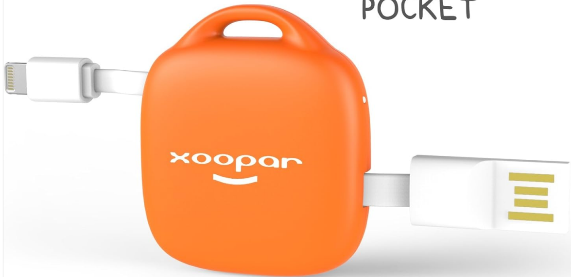
Image: The Xoopar HUG Booster Power Bank in orange, showcasing its compact design with integrated charging cables for both Apple Lightning and Micro USB devices. The image highlights its portability and dual functionality.