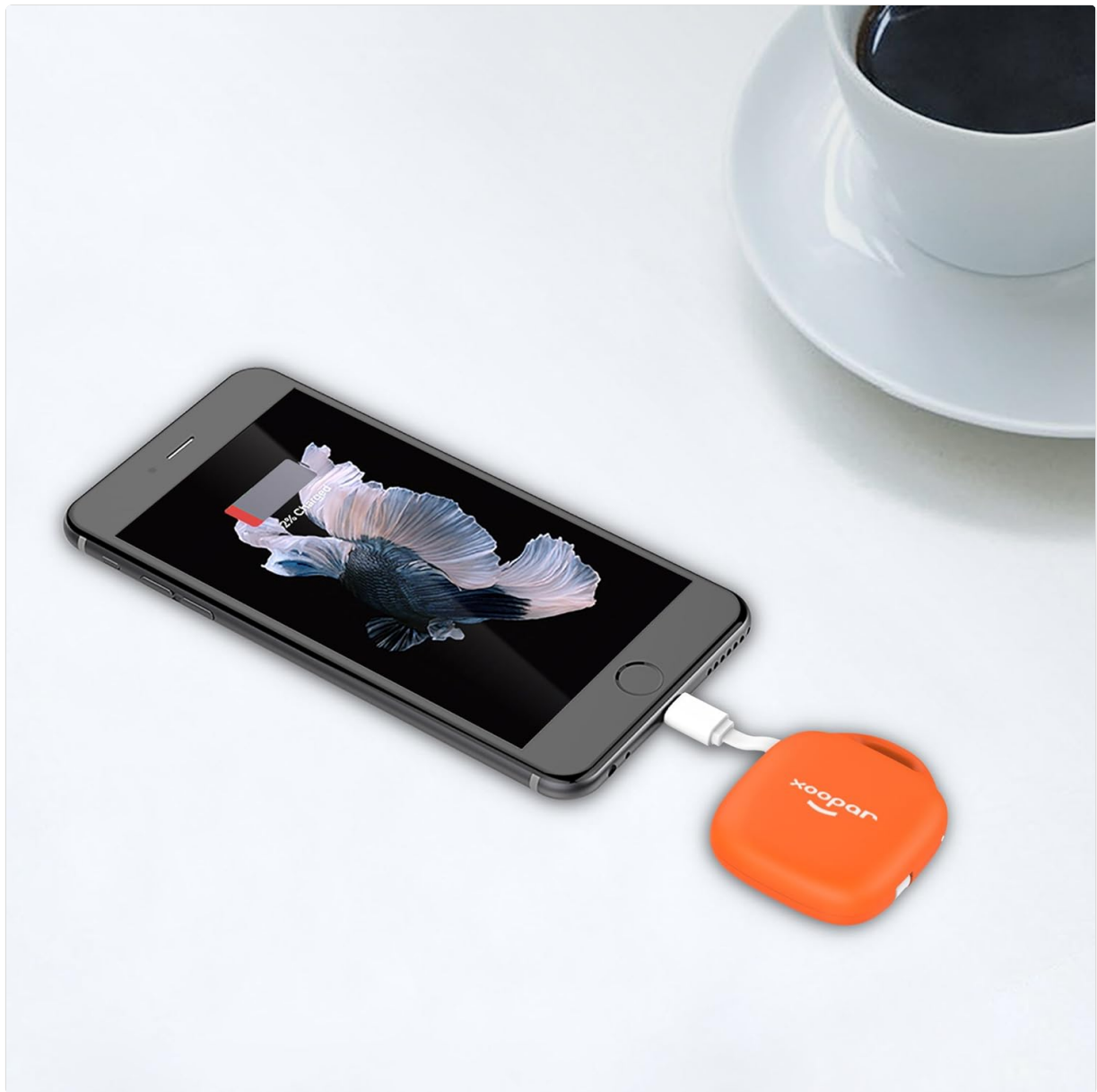
Image: The Xoopar HUG Power Bank connected to an iPhone, actively charging the device. The phone screen shows a low battery indicator, demonstrating the power bank's function in a real-world scenario.