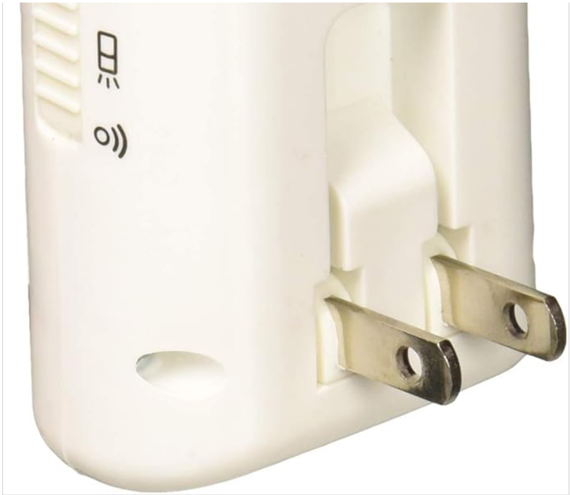
Image: Bottom view of the Globe Electric 8933301 LED Night Light, revealing the two bright LED bulbs that function as a flashlight when the unit is unplugged.