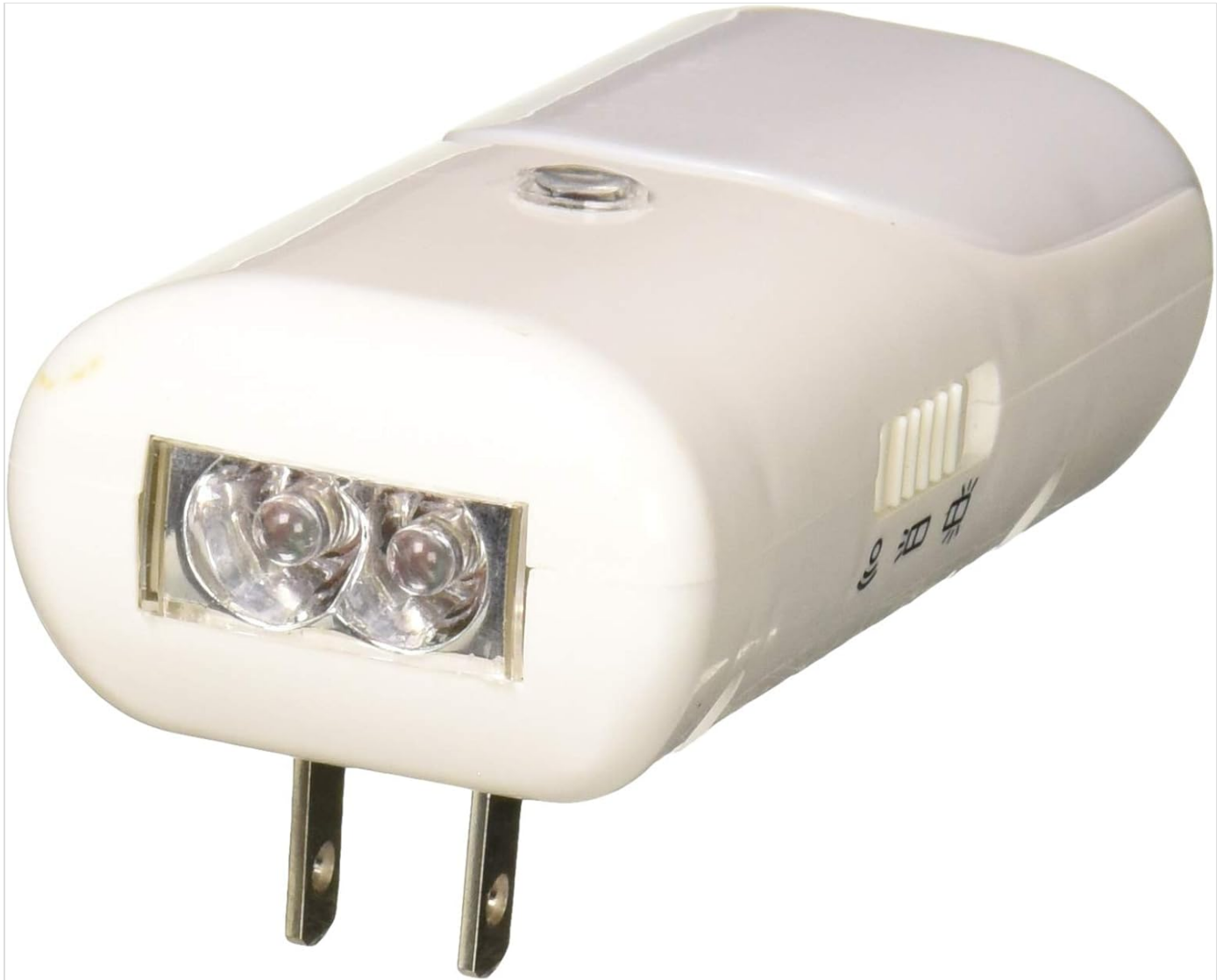
Image: The Globe Electric 8933301 LED Night Light with its electrical prongs extended, ready to be plugged into a wall outlet. A side switch is visible.

Plug the night light directly into a wall outlet. The device is designed to be tabletop mounted or plugged into a wall outlet.