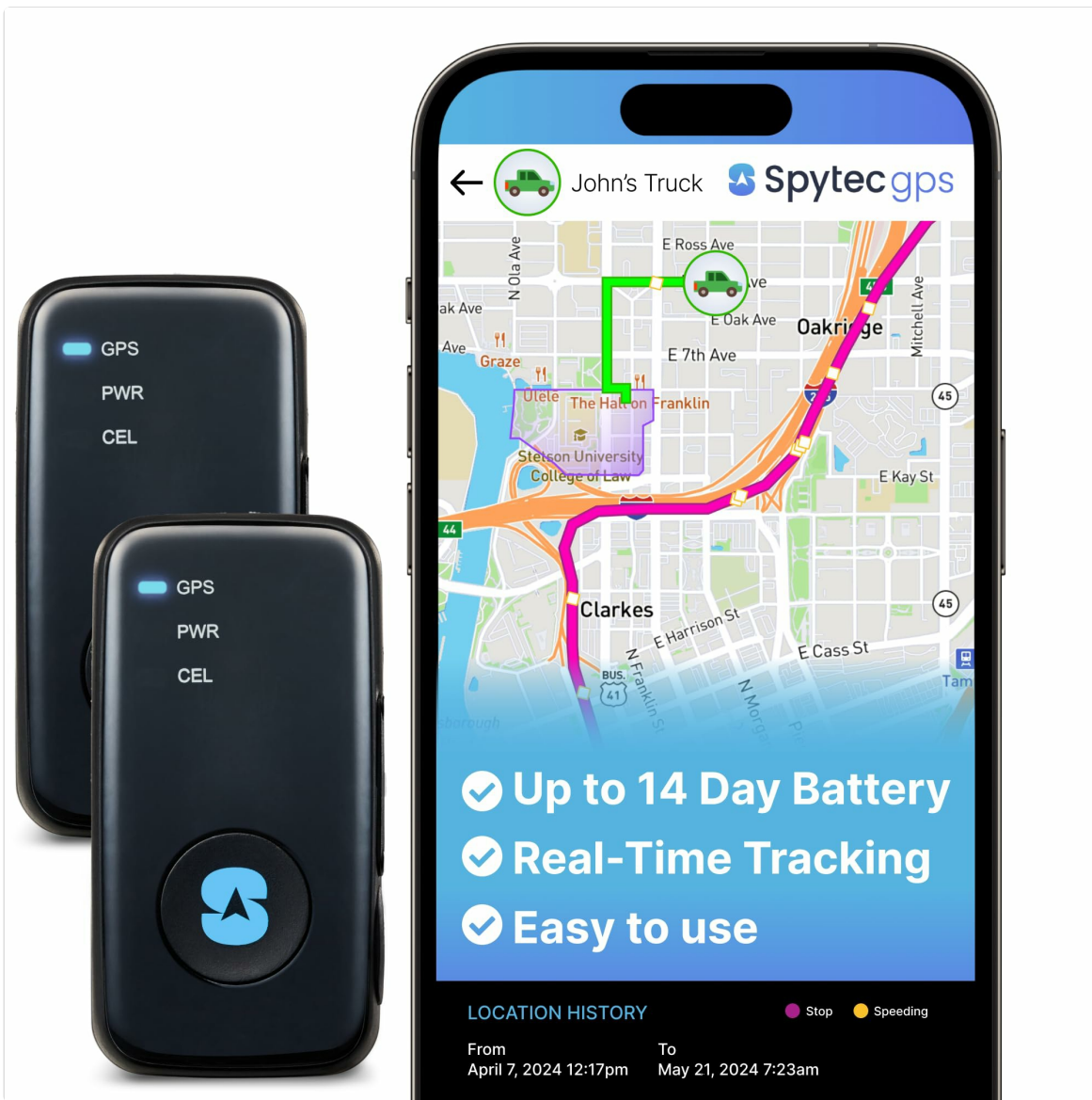
Image: The Spytec Atlas GL300MA GPS Tracker highlighting its up to 14-day battery life, fast charging, and low-battery notifications.