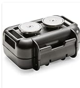
Image: The Spytec GPS M2 Weatherproof Magnetic Case, designed to protect the GL300 Mini Real-Time GPS Tracker in various environments.