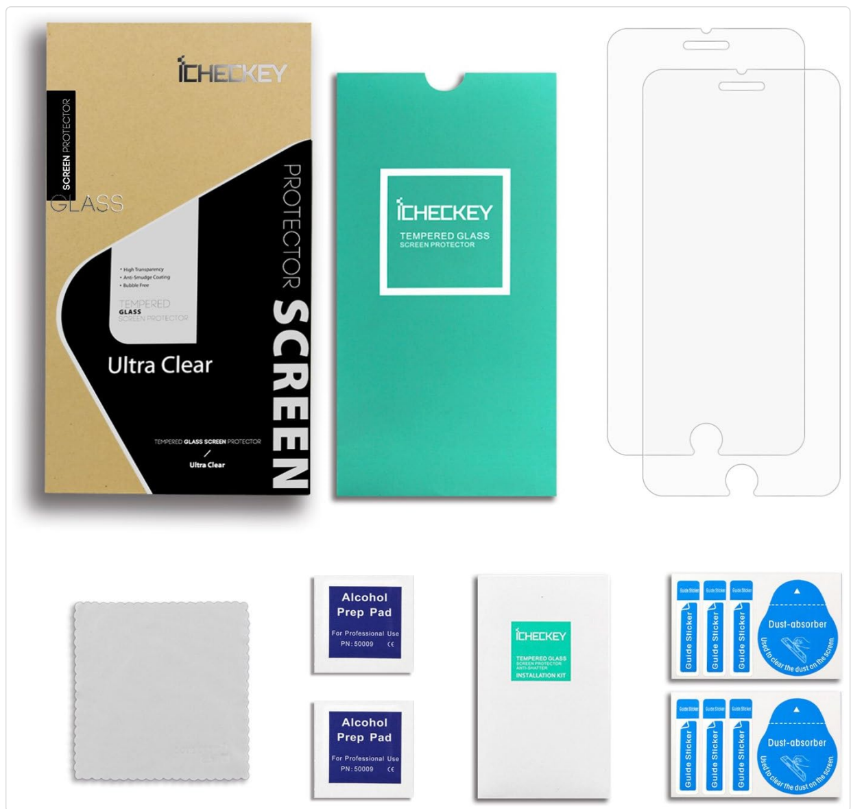
Image: All components included in the ICHECKKEY Screen Protector package: two screen protectors, alcohol pads, dust remover stickers, and a microfiber cloth.