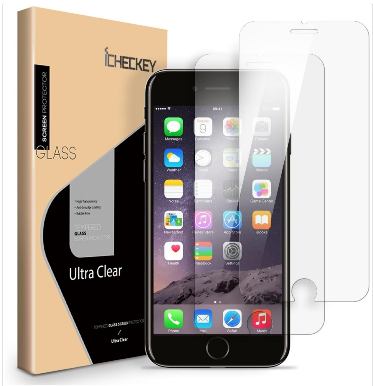
Image: ICHECKKEY Tempered Glass Screen Protector packaging and the protector itself, shown alongside an iPhone.