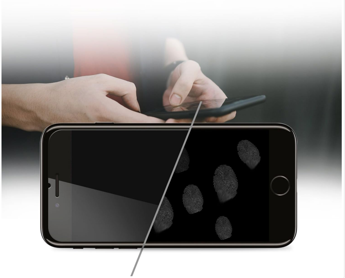
Image: A visual representation of the screen protector's oleophobic coating, showing how it repels fingerprints and smudges.

A long-lasting, oil-resistant design helps prevent fingerprints and smudges