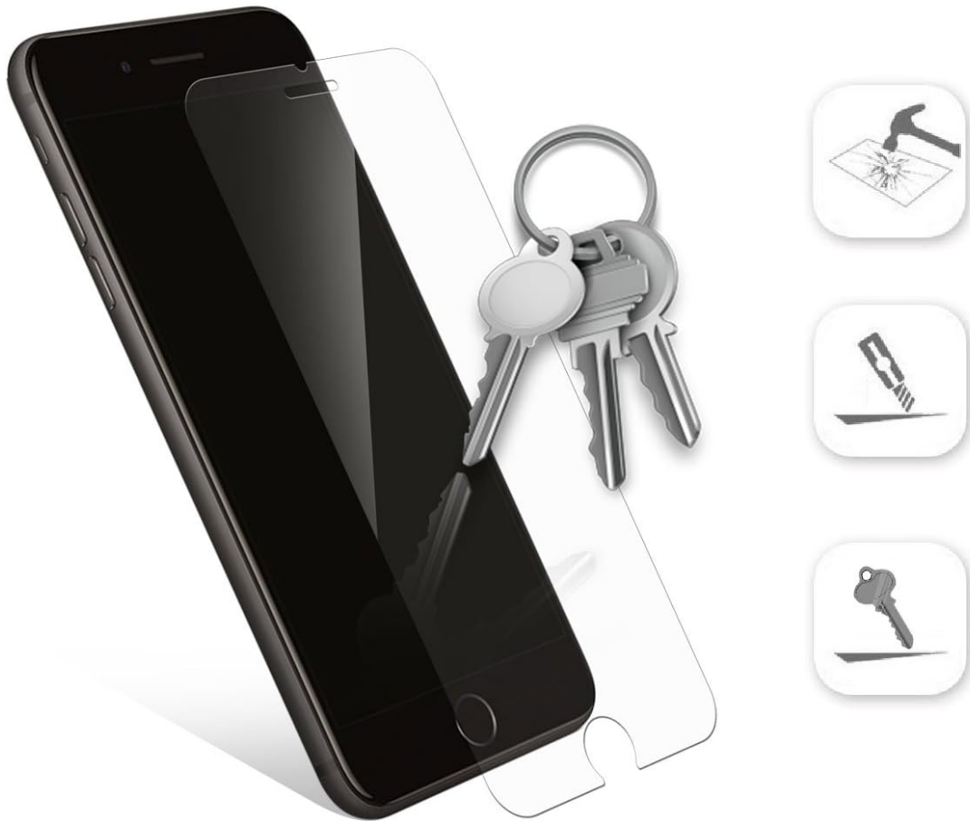
Image: Visual demonstration of the screen protector's resistance to scratches from keys and impacts, illustrating its 9H hardness.

9H rated tempered glass helps preserve every inch with maximum impact and scratch protection