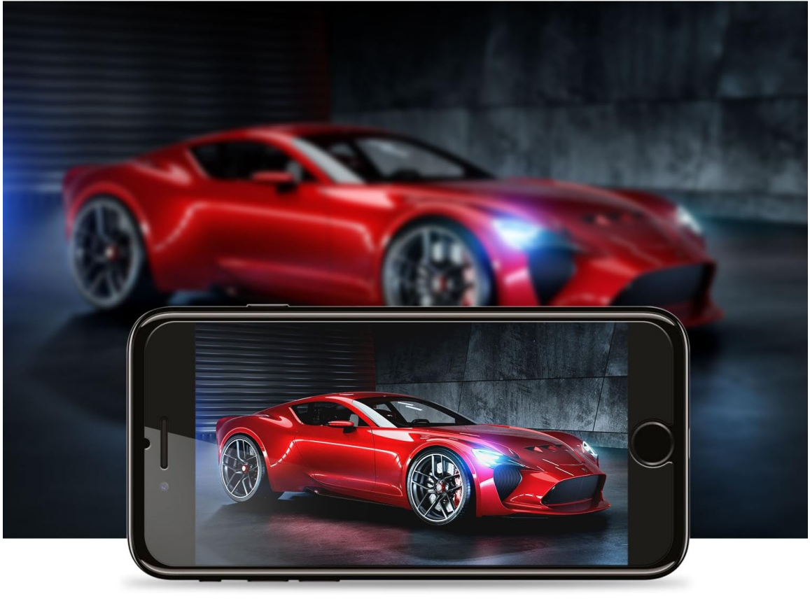
Image: An iPhone displaying a vibrant image of a car, demonstrating the screen protector's high clarity and transparency.

Rigorously tested materials ensure 99.99% transparency delivering a high-definition image clarity