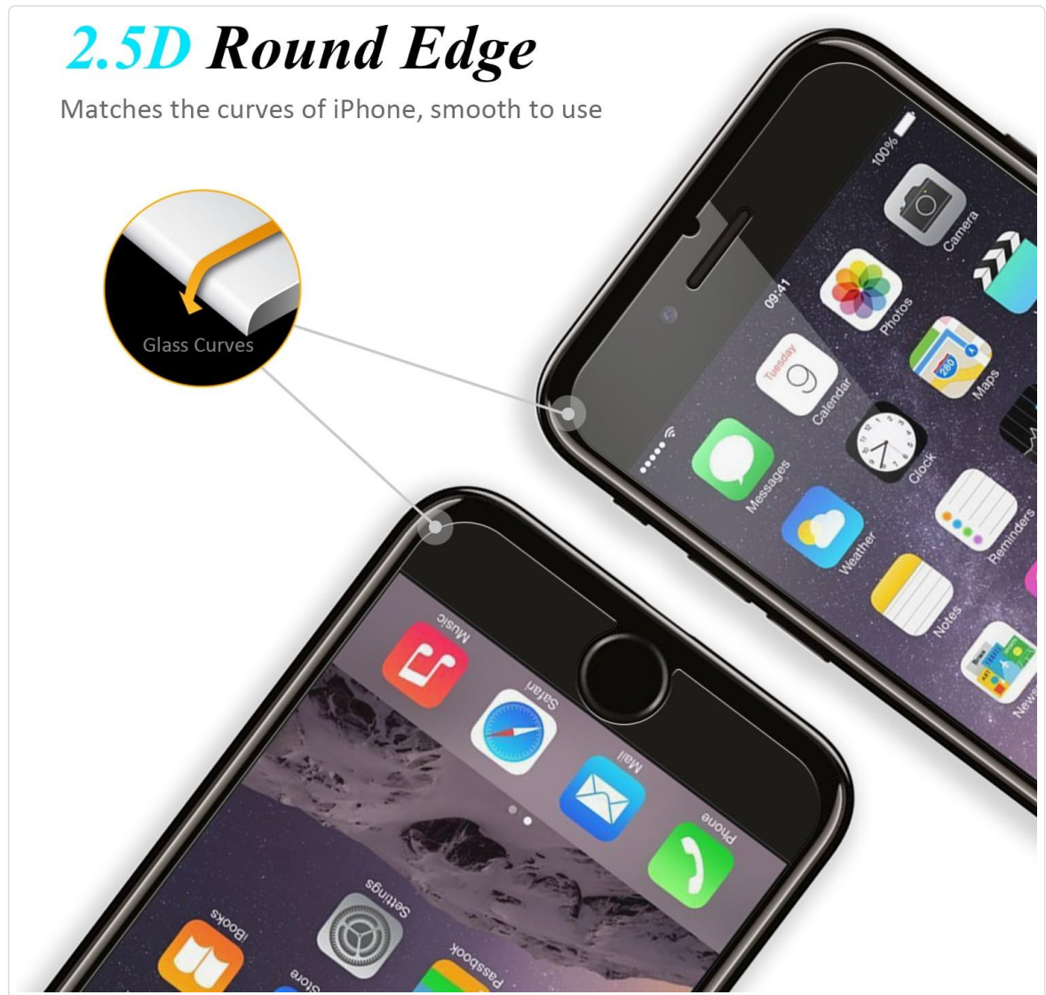
Image: Close-up illustration highlighting the 2.5D rounded edge of the tempered glass screen protector, designed to match the phone's curves.