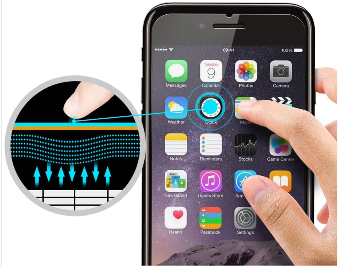
Image: Diagram showing how the 0.26mm screen protector maintains full 3D Touch functionality and accuracy on the iPhone screen.

Only 0.26mm thickness ensures high 3D touch accuracy for quick app launch, smooth games and video playing