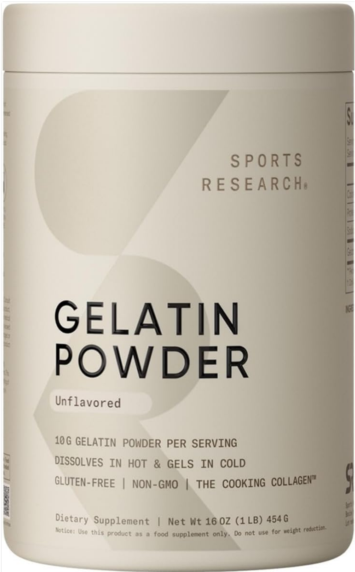
Figure 1: The product container for Sports Research Gelatin Powder, highlighting its unflavored nature and key features.