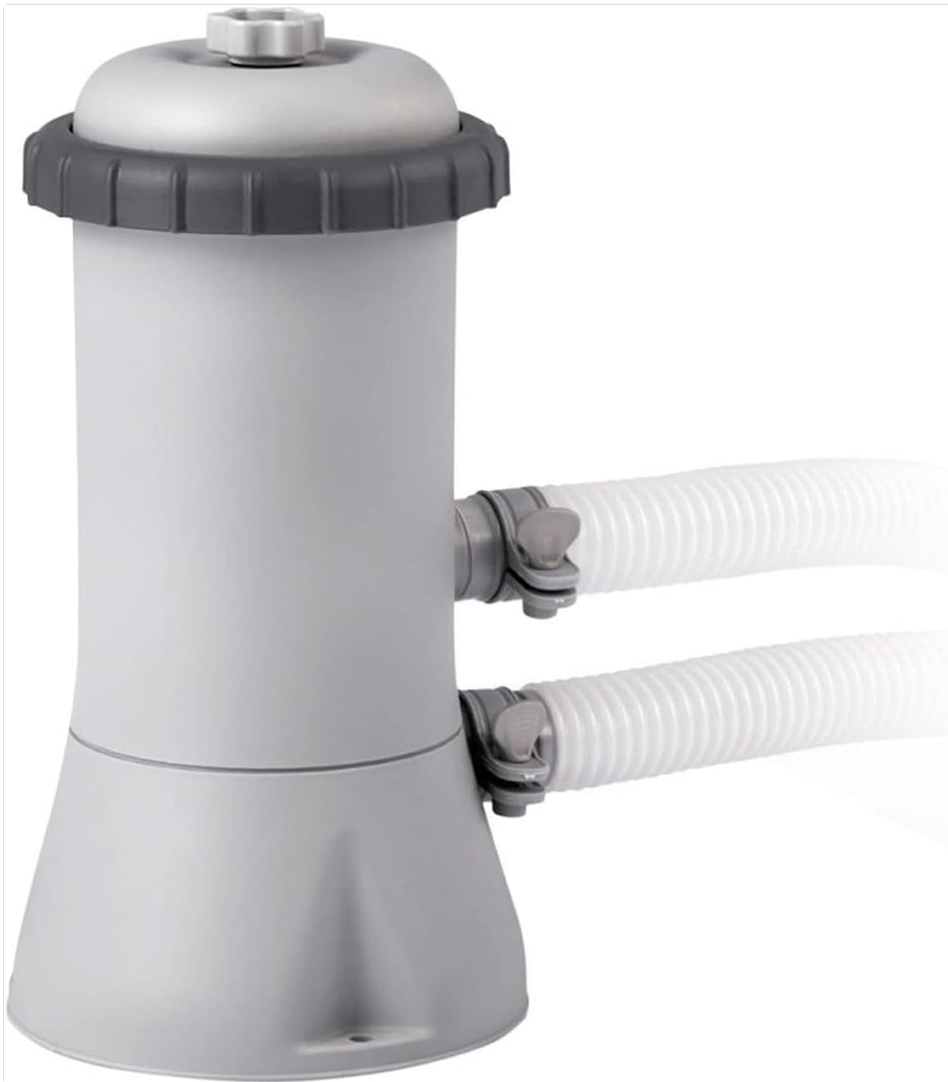
Figure 1: Intex Krystal Clear Cartridge Filter Pump (Model 28604).

530 gallons (US) per hour (2000 liters per hour).