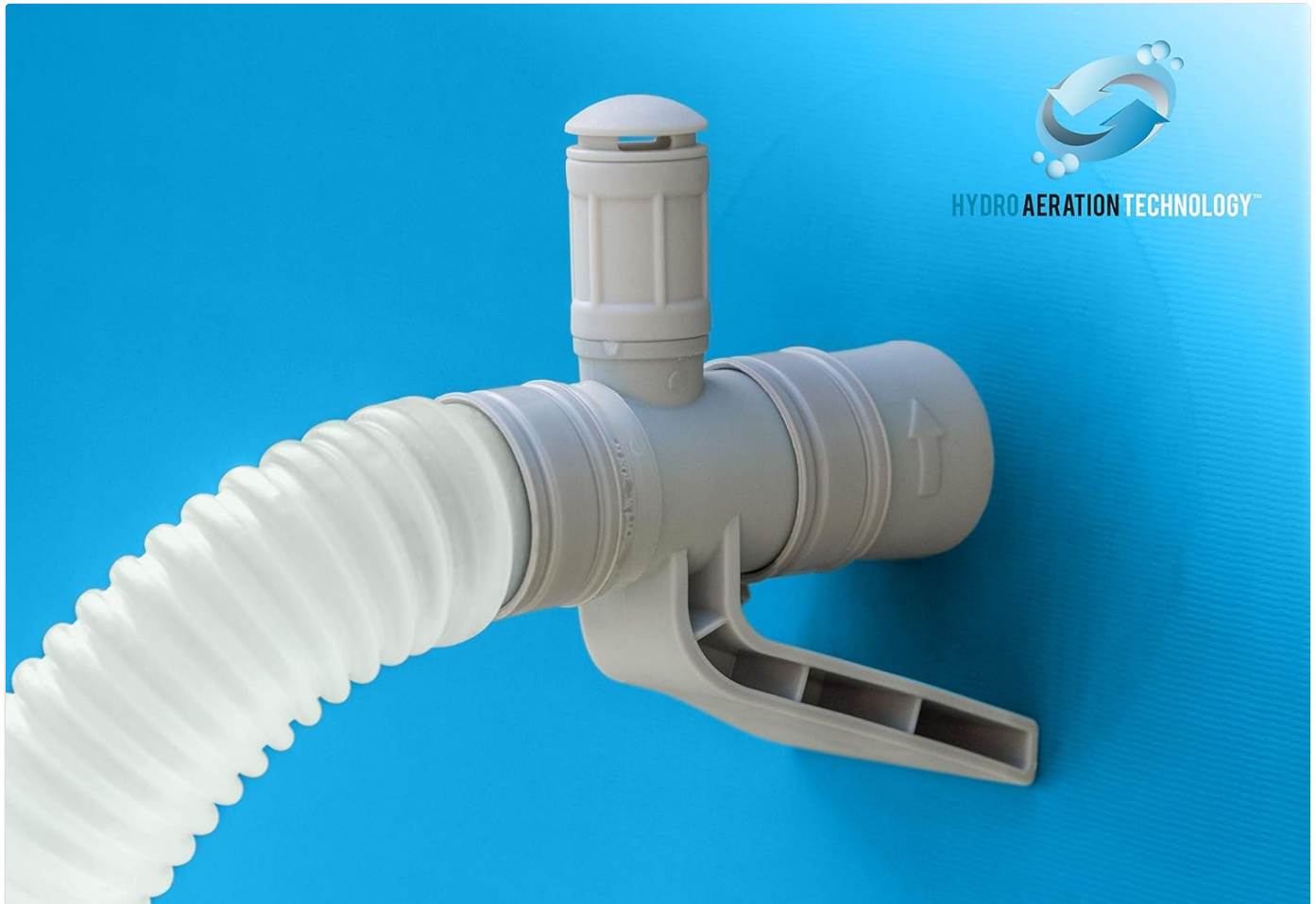
Figure 6: The Hydro Aeration Technology outlet, which enhances water circulation and filtration.