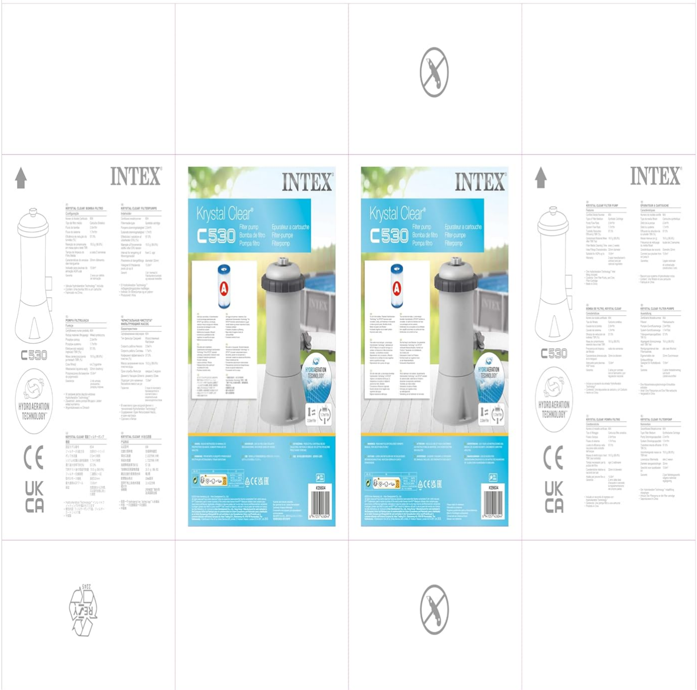
Figure 2: Components of the Intex Krystal Clear Filter Pump, including the pump body, filter cartridge, hoses, and connectors.

#28604 All Panel Box Size: 11.75" x 11.75" x 15" Date: 04/07/2023