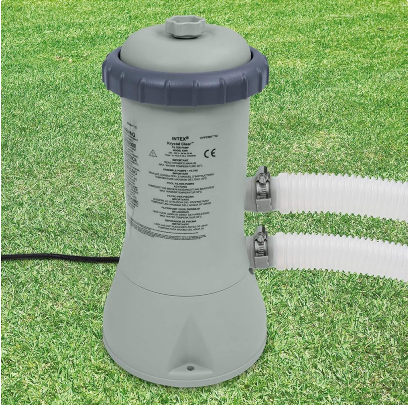
Figure 5: A Type A filter cartridge, essential for the pump's filtration process.