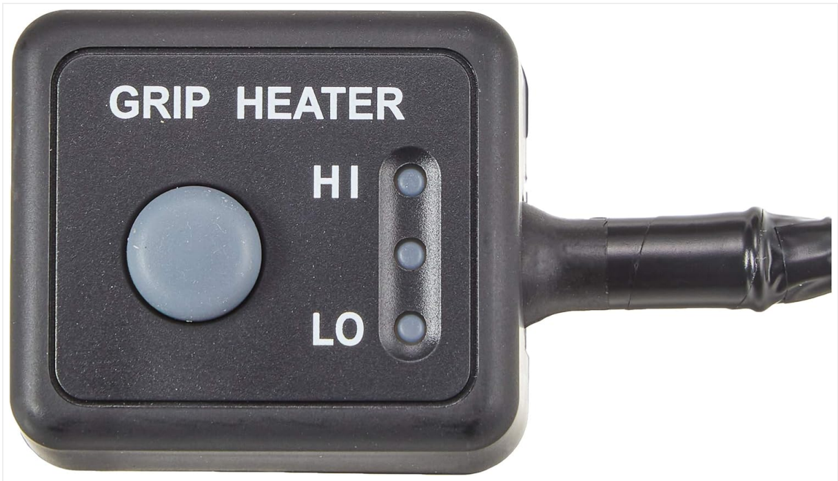
Figure 2: Detail of the control switch for the grip heater.

functionality. Verify that all temperature settings work and the indicator lights function correctly.