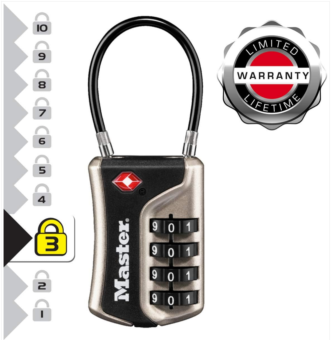
Image: A close-up view of the Master Lock 4697EURDNKL padlock, highlighting its four combination dials. The image also features a "Limited Lifetime Warranty" seal, indicating the product's guarantee.

Important: Remember your combination. Master Lock does not retain user-set combinations.