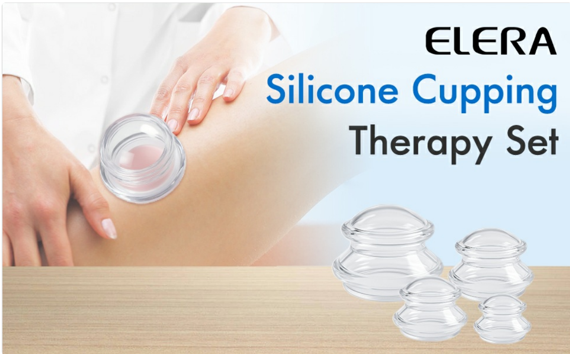
Image: Overview of the four different sizes of ELERA silicone cupping cups and their suggested application areas on the body.