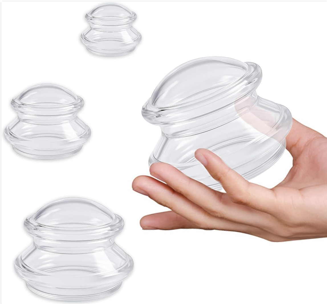
Image: The ELERA Silicone Cupping Therapy Set, showcasing the four transparent cups and one being held to demonstrate size.