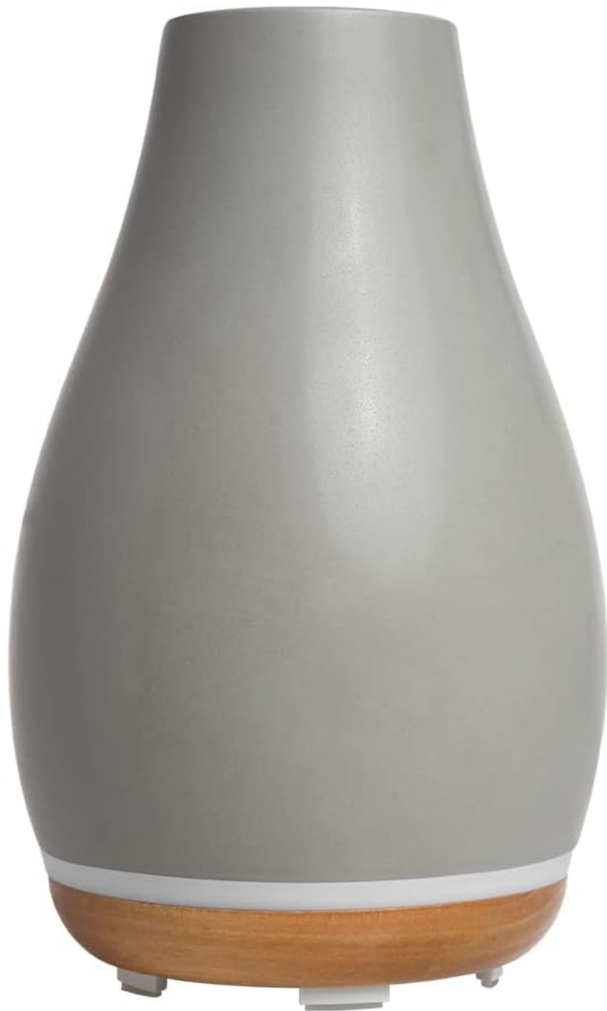
Image: The Ellia Blossom Aroma Diffuser in grey, featuring its ceramic body and wooden base.