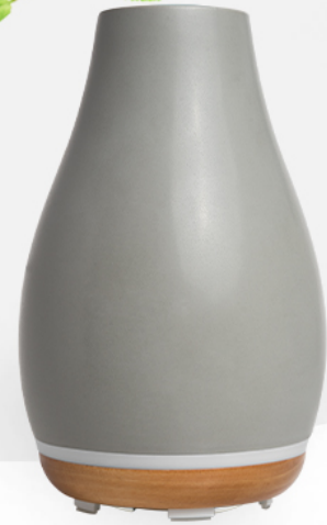
Image: The Ellia Blossom Diffuser with a close-up of its top opening, highlighting its stylish design and mist outlet, relevant for cleaning.