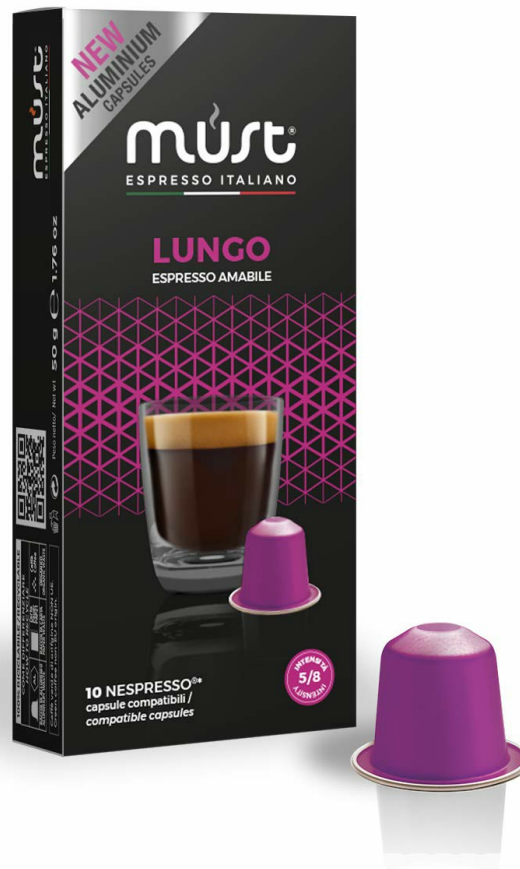
Image: MUST Lungo coffee capsules and a brewed cup of coffee, highlighting the product packaging and a single capsule.