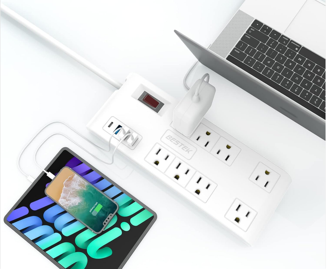
Image: The power strip actively charging a laptop and a tablet via its AC and USB outlets, demonstrating its multi-device charging capability.

3 x USB-A 2.4A 5V Per Ports 15W, 1 x USB-C 3A 5V Per Port 20W Automatically Detects Devices to Maximum the Charging Speed