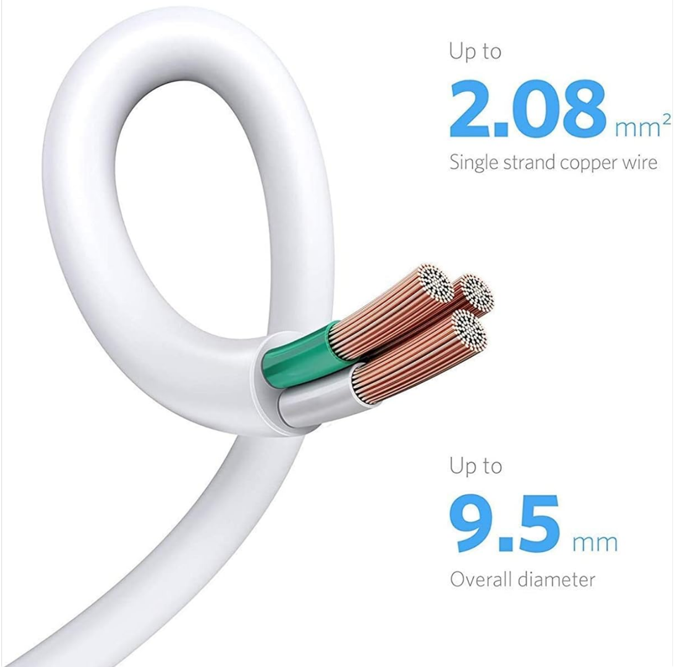
Image: A detailed view of the UL Certified Strong Copper Wire used in the power strip, highlighting its thickness (up to 2.08 mm 2 single strand copper wire) and overall diameter (up to 9.5 mm) for efficient and safe power delivery.

The Thicker SJT 3x14AWG Wires Conducts Electricity Quickly with a low-loss, Low Heat&Safety