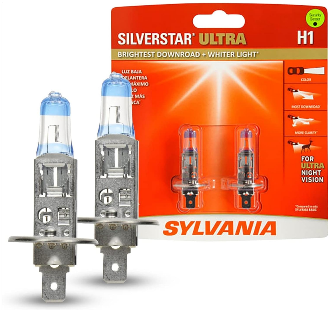
Image 1.1: SYLVANIA H1 SilverStar Ultra Halogen Headlight Bulbs and packaging.