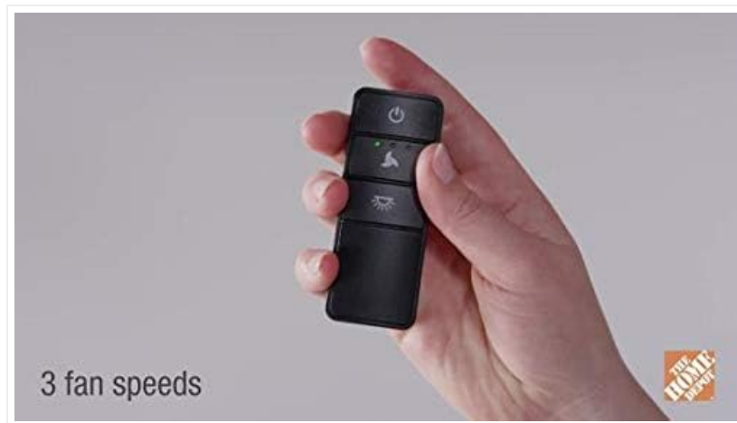
Figure 3: Remote in use, demonstrating control over a ceiling fan.