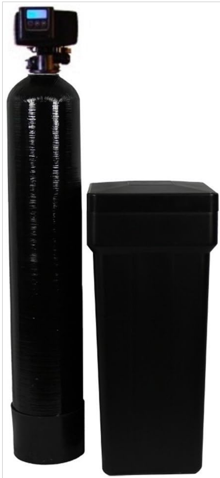
Image 1.1: Complete DuraWater Fleck 5600 SXT Water Softener System, showing the mineral tank with control head and the brine tank.