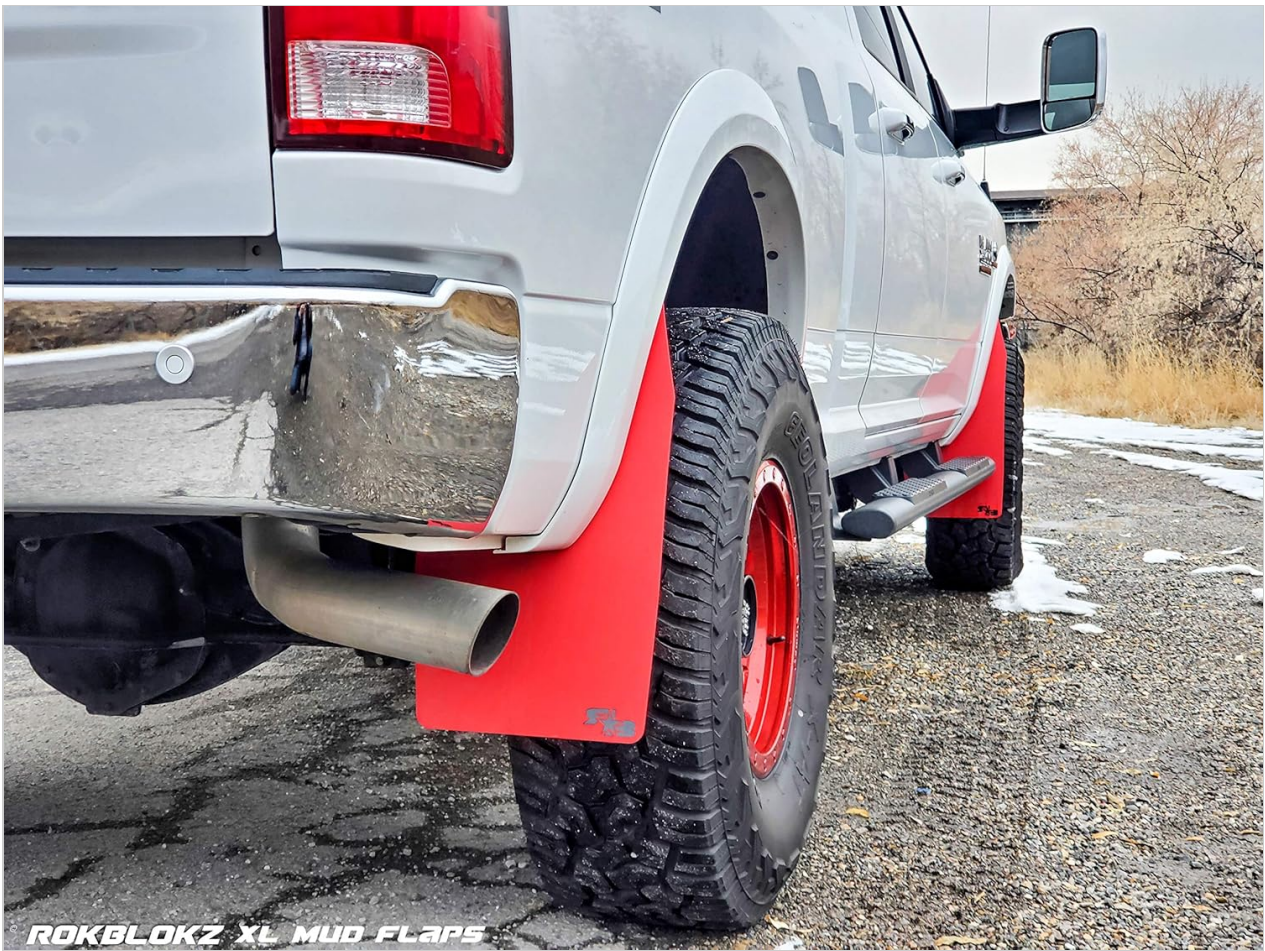
Image 2: Close-up view of an XL size mud flap, showing its protective coverage.