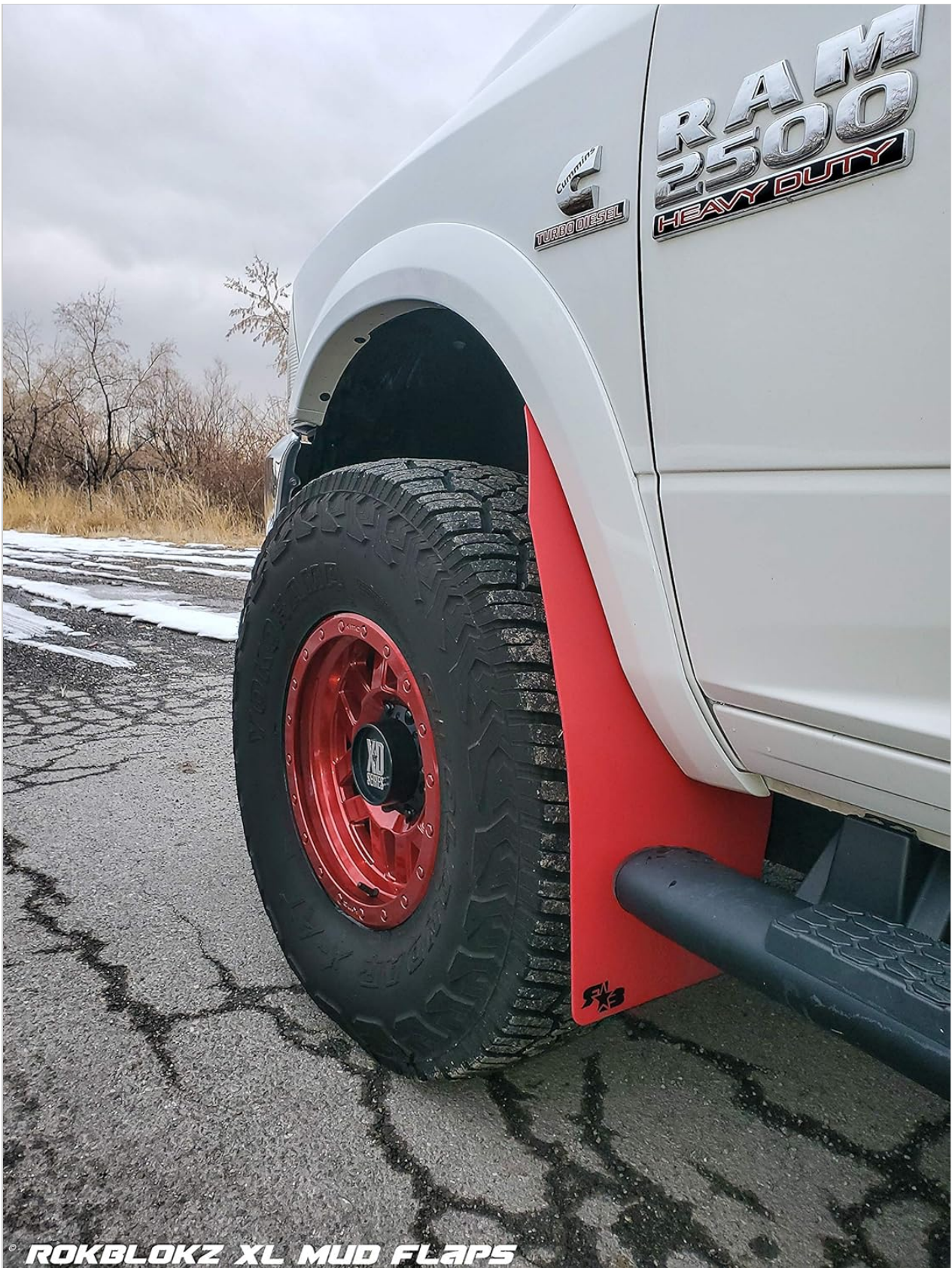
Image 1: RokBlokz Mud Flaps installed on a Dodge Ram truck, demonstrating coverage.