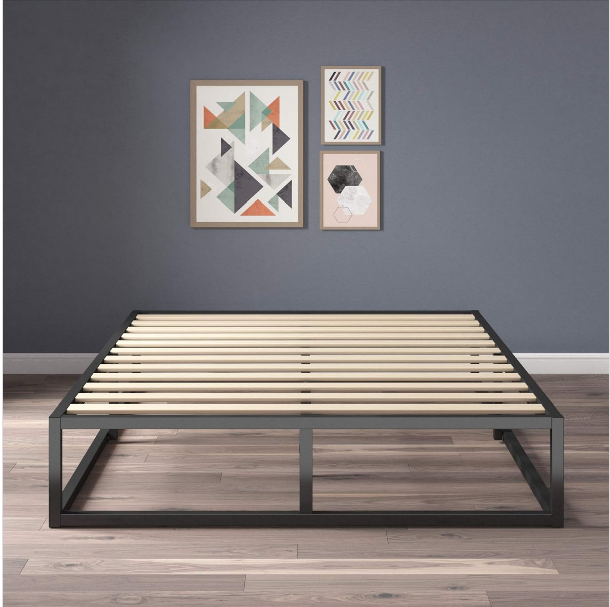
Image: The fully assembled Zinus Modern Studio bed frame, viewed from above, showcasing the evenly spaced wooden slats that provide direct support for a mattress.