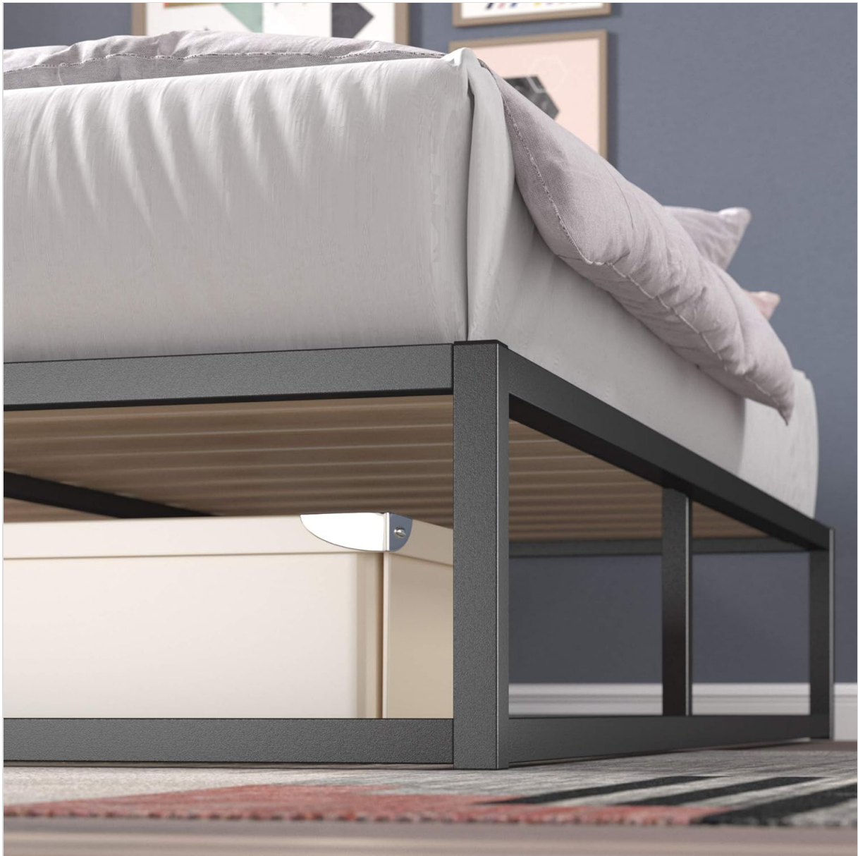
Image: A close-up view of the Zinus Modern Studio bed frame, highlighting the generous under-bed clearance with a storage box neatly placed beneath, demonstrating its storage capability.