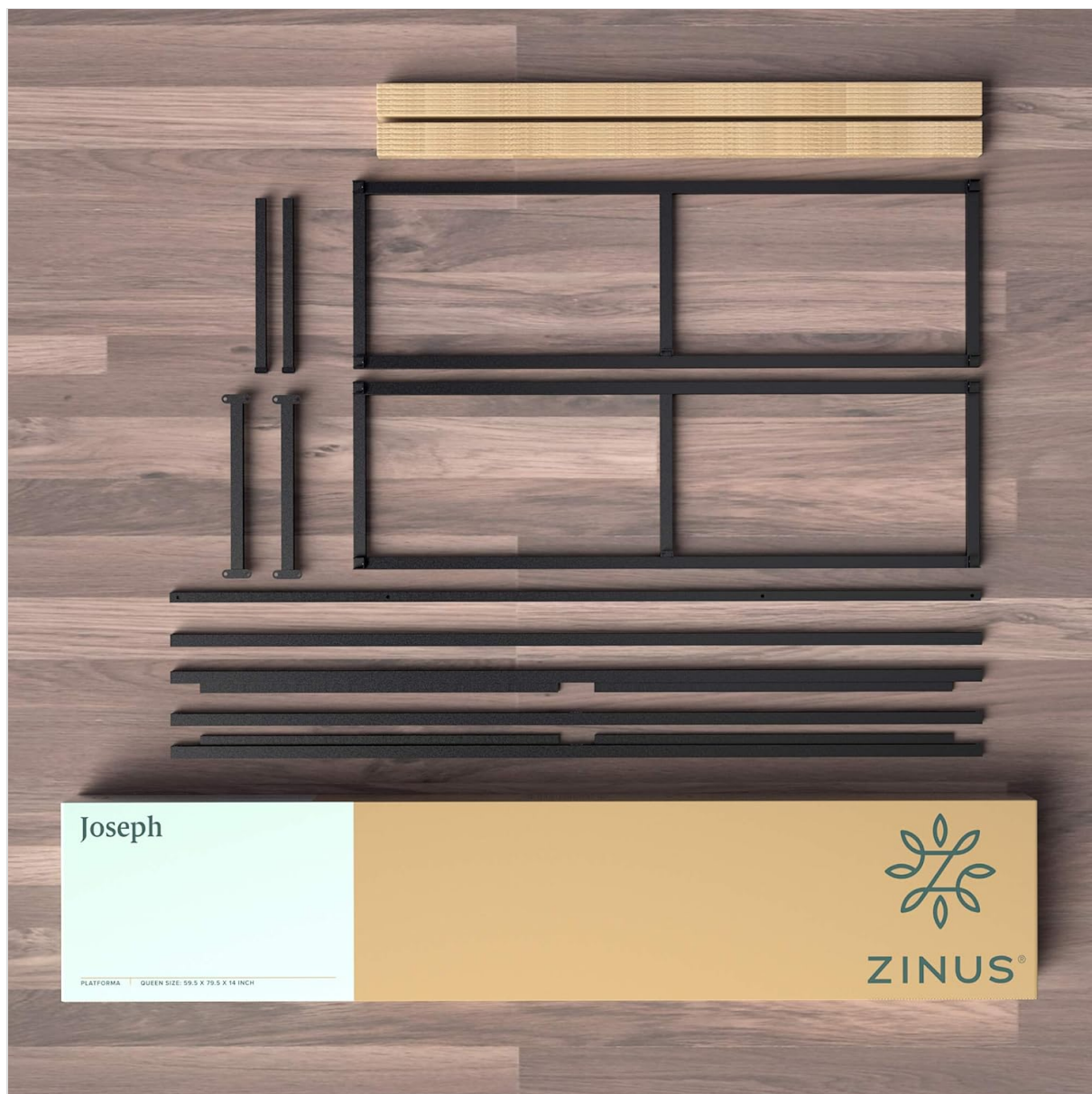
Image: All components of the Zinus Modern Studio bed frame, including the metal frame pieces, wooden slats, and assembly tools, are laid out on a wooden floor, ready for assembly.