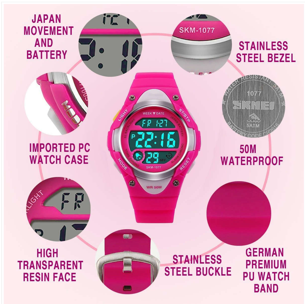
Image: Key features of the cofuo CF-1077-R watch, highlighting the Japan movement and battery, stainless steel bezel, 50M waterproof rating, imported PC watch case, high transparent resin face, stainless steel buckle, and German premium PU watch band.