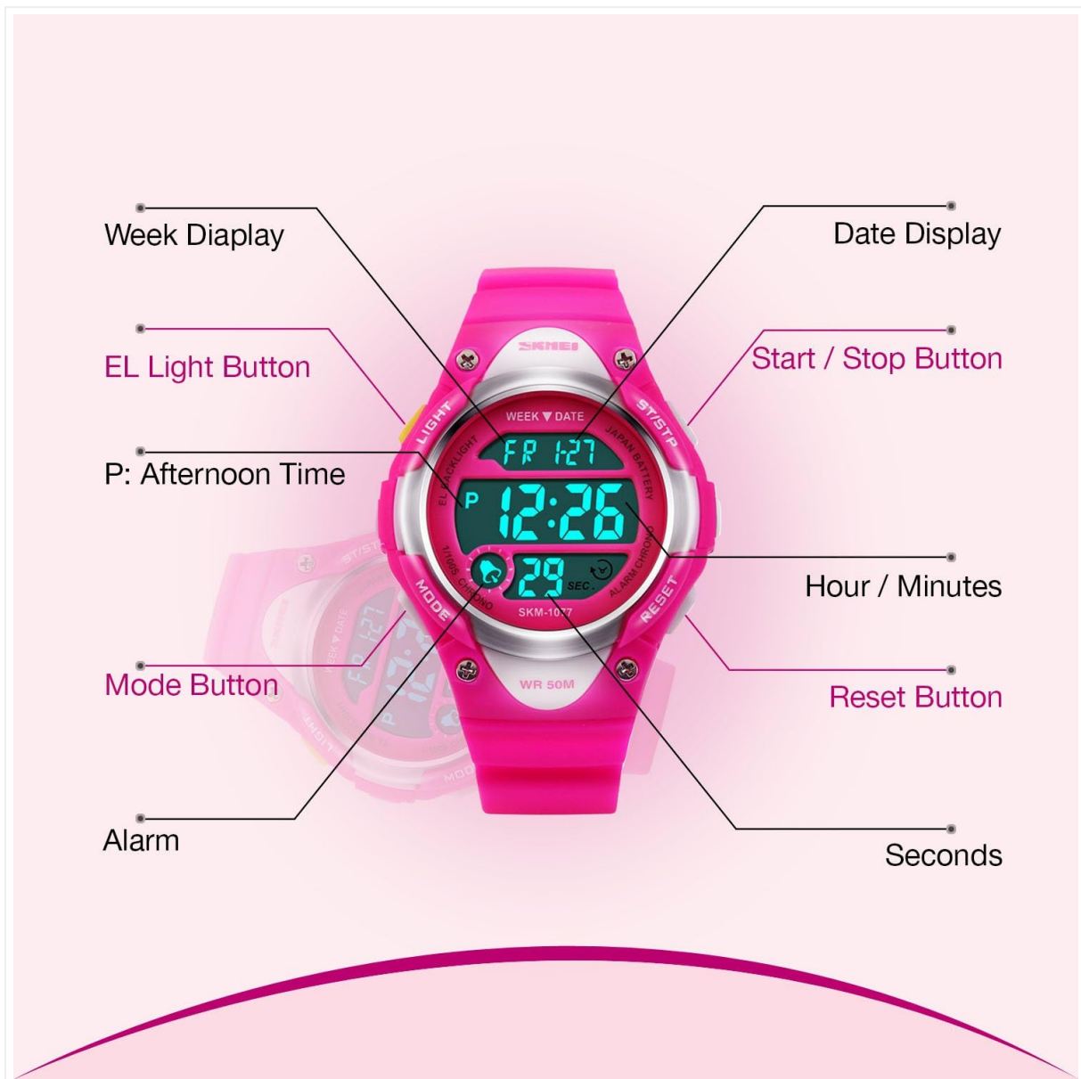
Image: Diagram showing the watch face with labels for Week Display, Date Display, EL Light Button, Start/Stop Button, P: Afternoon Time indicator, Hour/Minutes, Mode Button, Reset Button, Alarm indicator, and Seconds display.