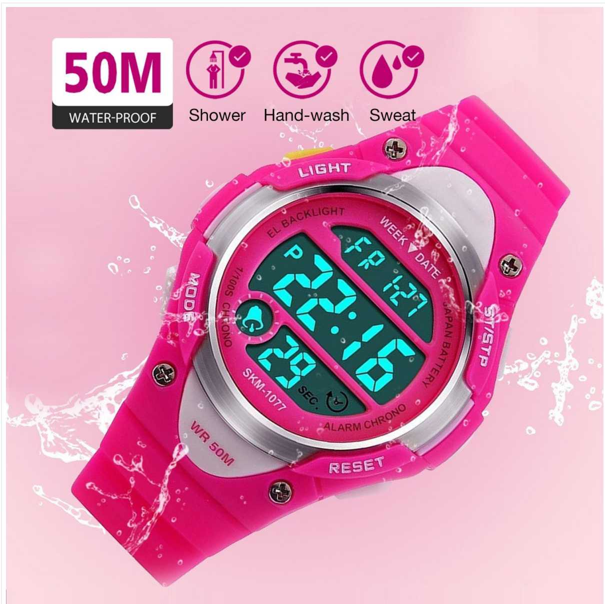
Image: Icons illustrating the 50M water resistance rating, suitable for showering, hand-washing, and exposure to sweat.

This watch is rated for 50 meters (5ATM) water resistance. This means it is suitable for showering, hand-washing, and exposure to sweat. It is generally suitable for short periods of recreational swimming, but not for diving or snorkeling. Do not press any buttons while the watch is submerged or wet, as this can compromise the water resistance. Avoid exposing the watch to hot water or steam, as extreme temperature changes can affect the seals.