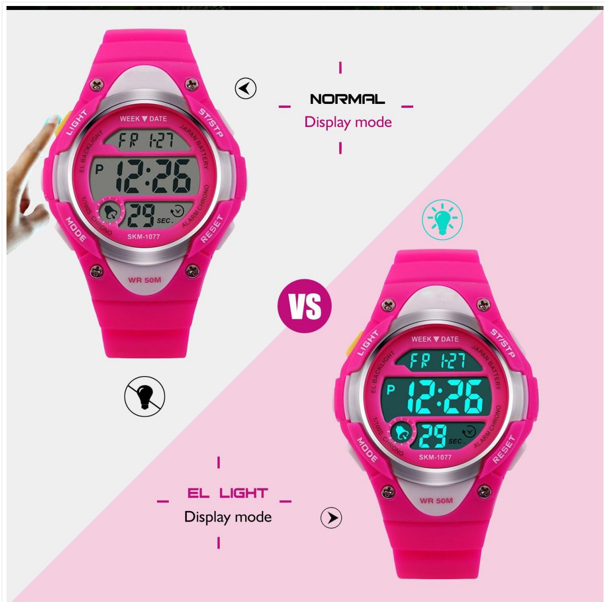
Image: A side-by-side comparison showing the watch display in normal mode (unlit) and with the EL backlight activated, illustrating improved visibility.

Press the LIGHT button (top-left) to illuminate the display for a few seconds. This feature is useful in dark environments.