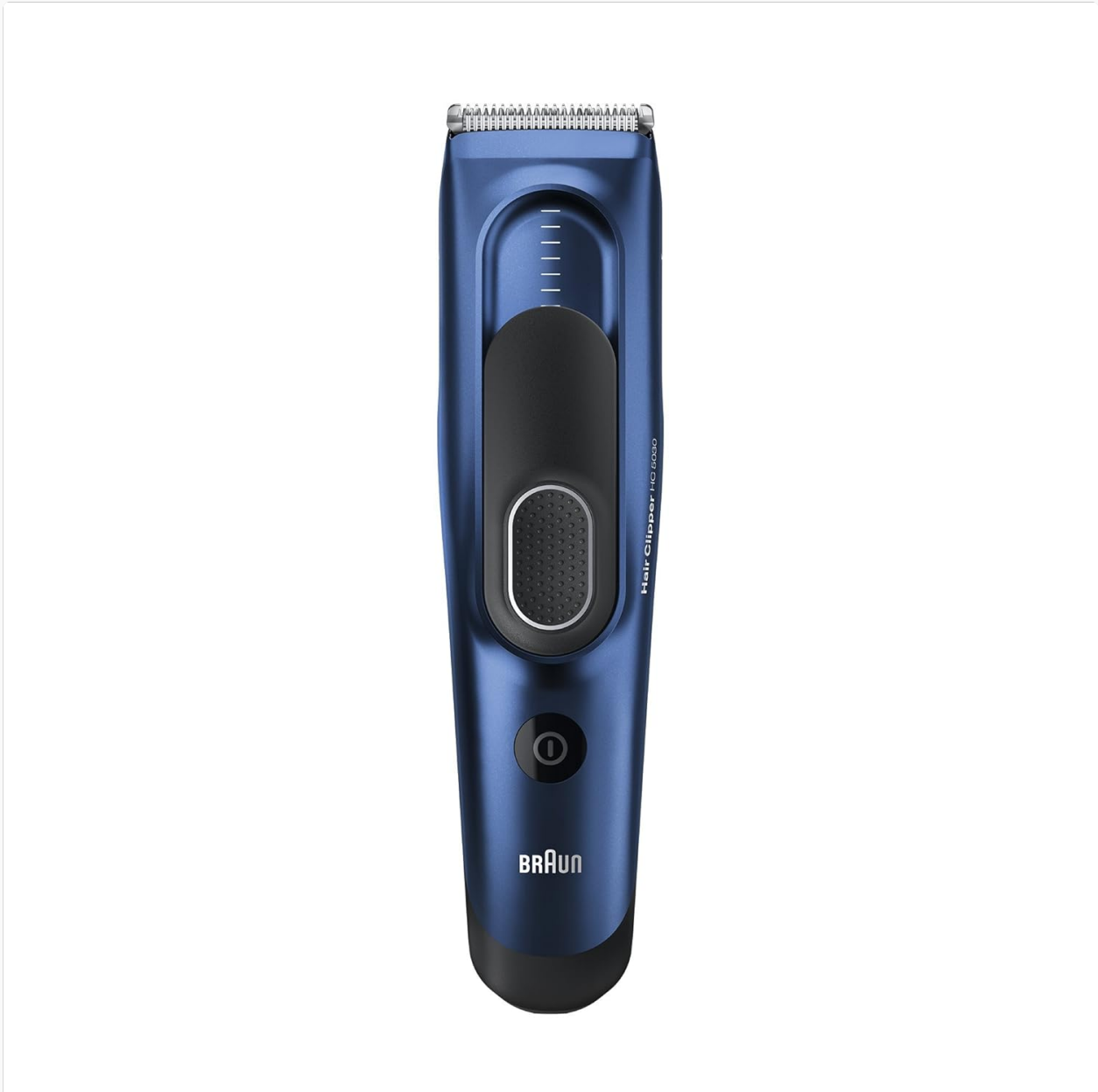
Image 4.1: Front view of the Braun Hair Clipper HC5030, highlighting the blade assembly, length setting indicator, power switch, and Braun branding.

Familiarize yourself with the components of your Braun Hair Clipper HC5030.