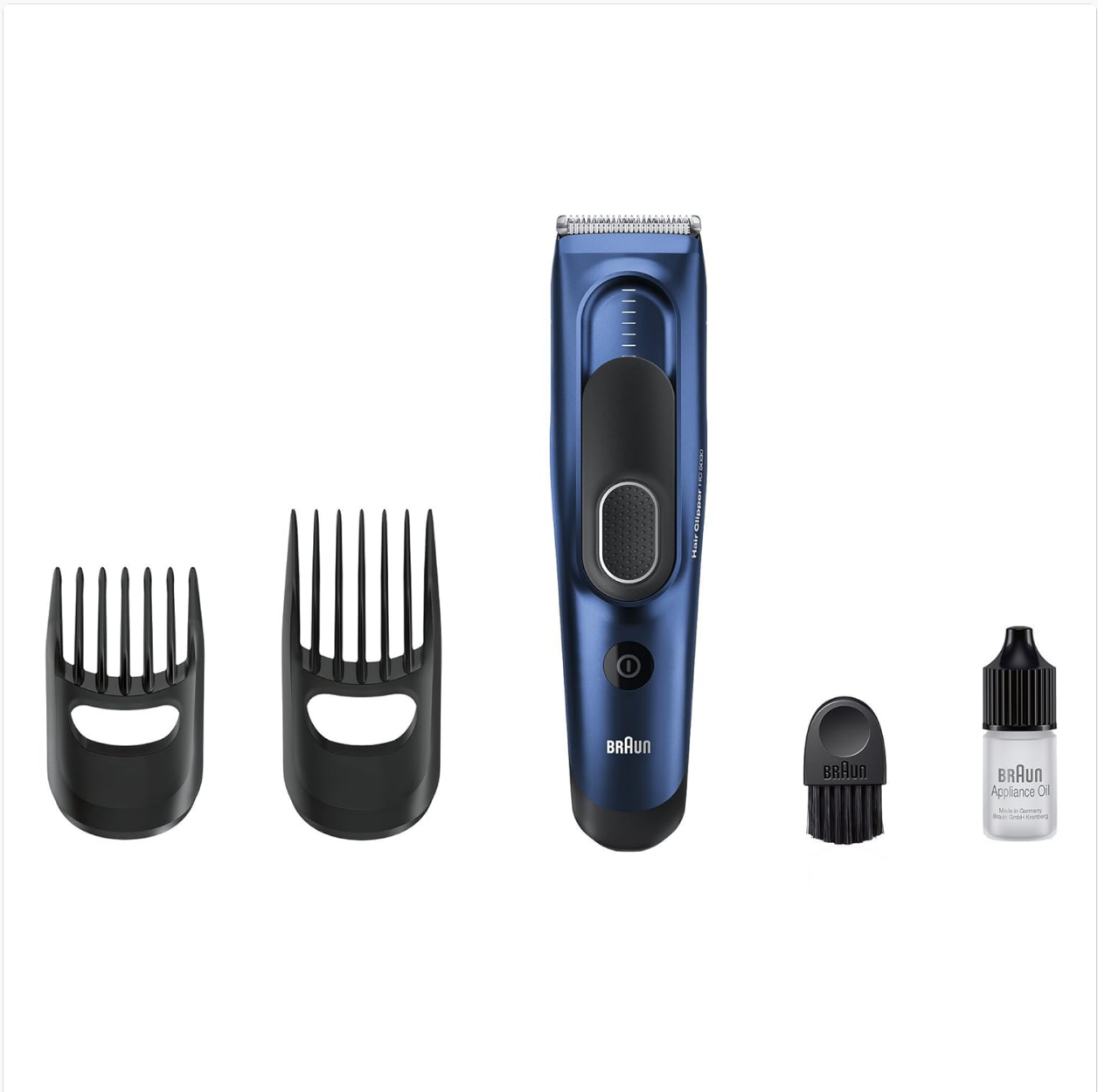
Image 3.1: Contents of the Braun Hair Clipper HC5030 package, including the clipper, two comb attachments, charging adapter, cleaning brush, and lubricating oil.