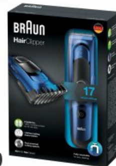
Image 4.2: Visual representation of the Braun Hair Clipper HC5030's main features, such as adjustable length settings, safety lock, durable blades, battery power, and global voltage compatibility.