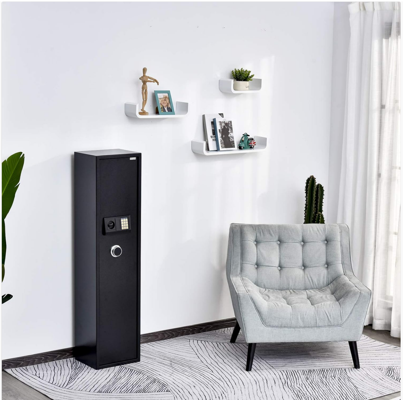
Image 1.1: The HOMCOM 56-inch Electronic 5-Rifle Gun Security Cabinet in a typical home environment.