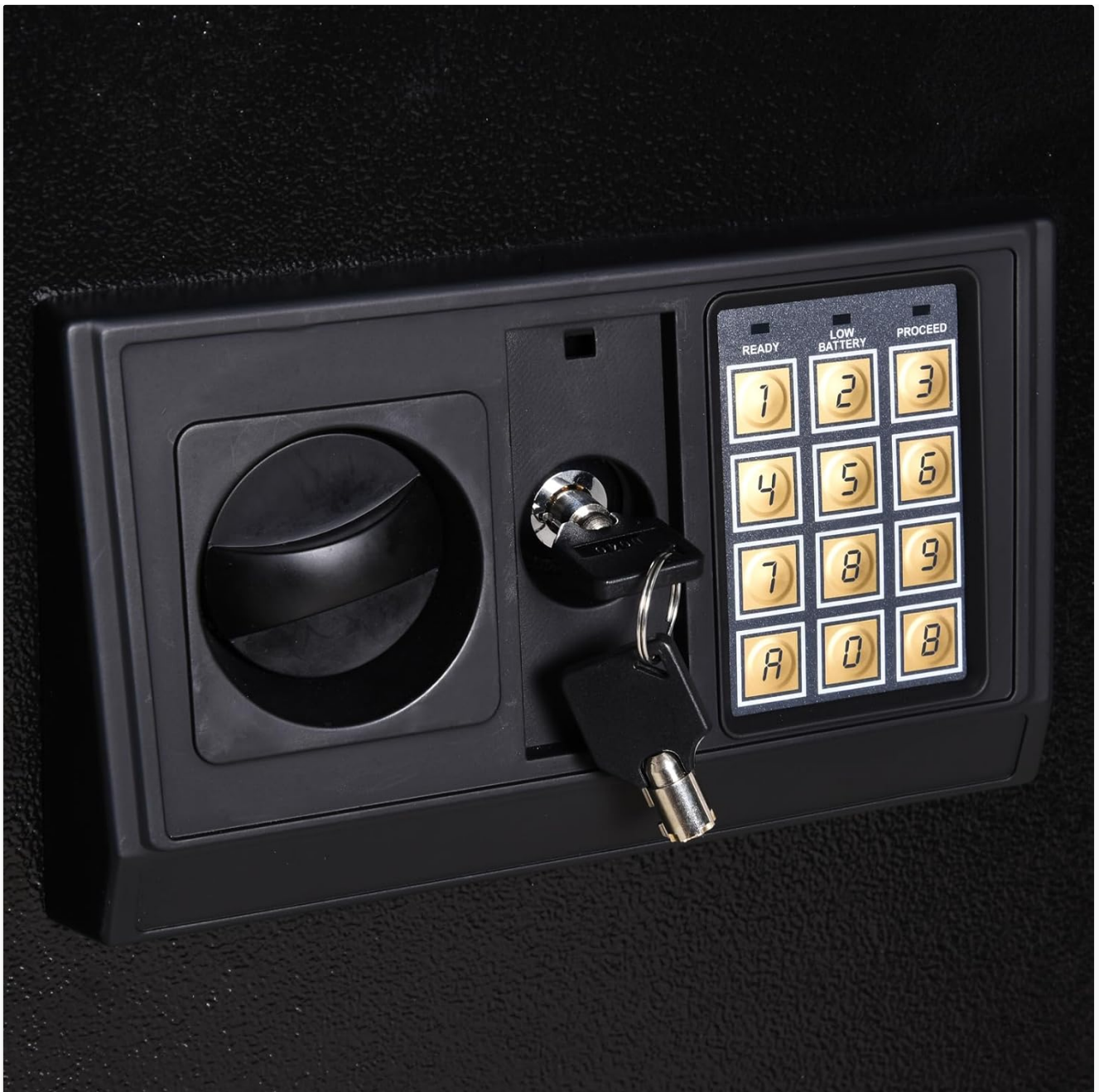
Image 5.2: Detail of the digital keypad and manual key entry point.