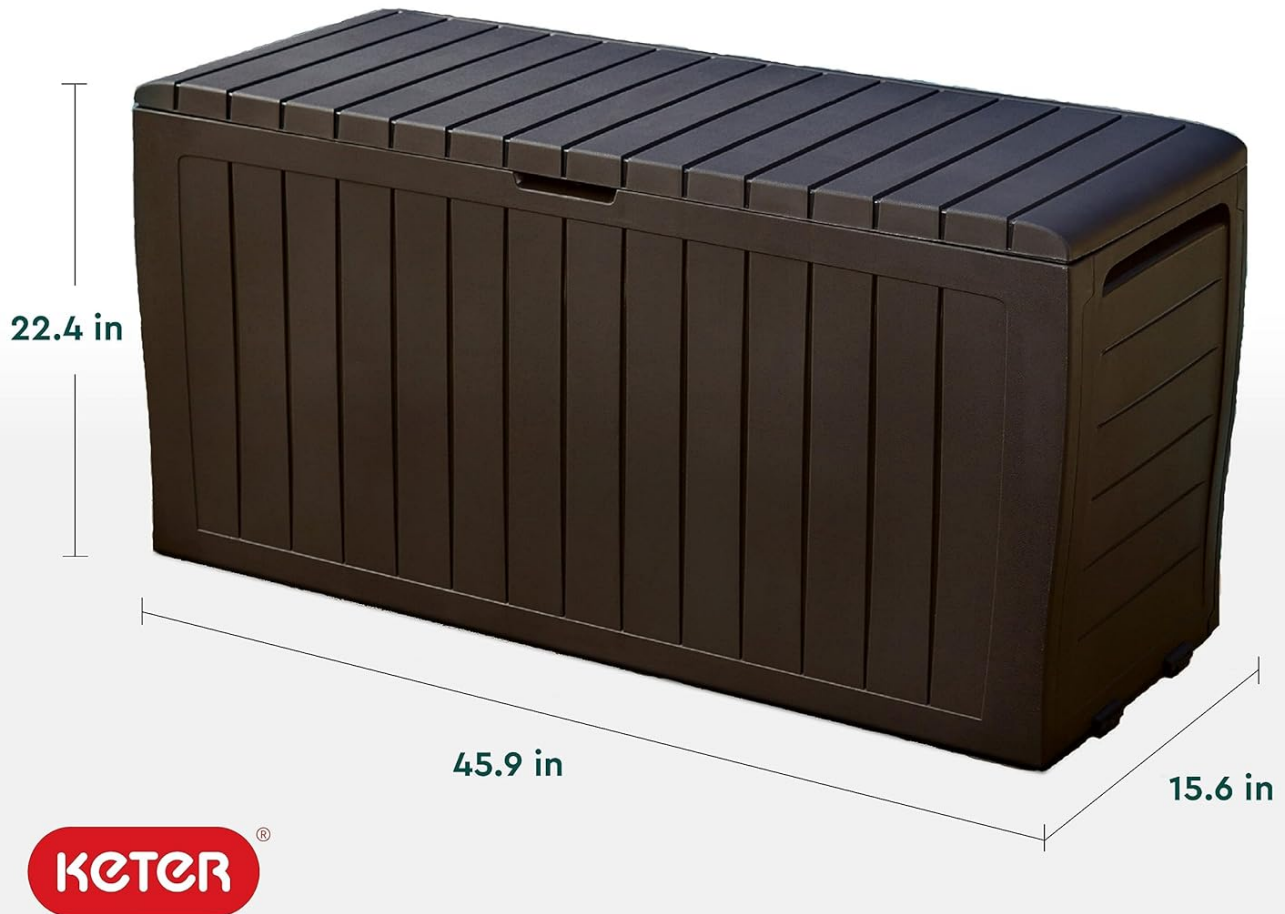
Image: Diagram illustrating the dimensions of the Keter Marvel Deck Box: 45.9 inches W x 15.6 inches D x 22.4 inches H, highlighting its 71-gallon storage capacity and 485 lbs weight capacity.