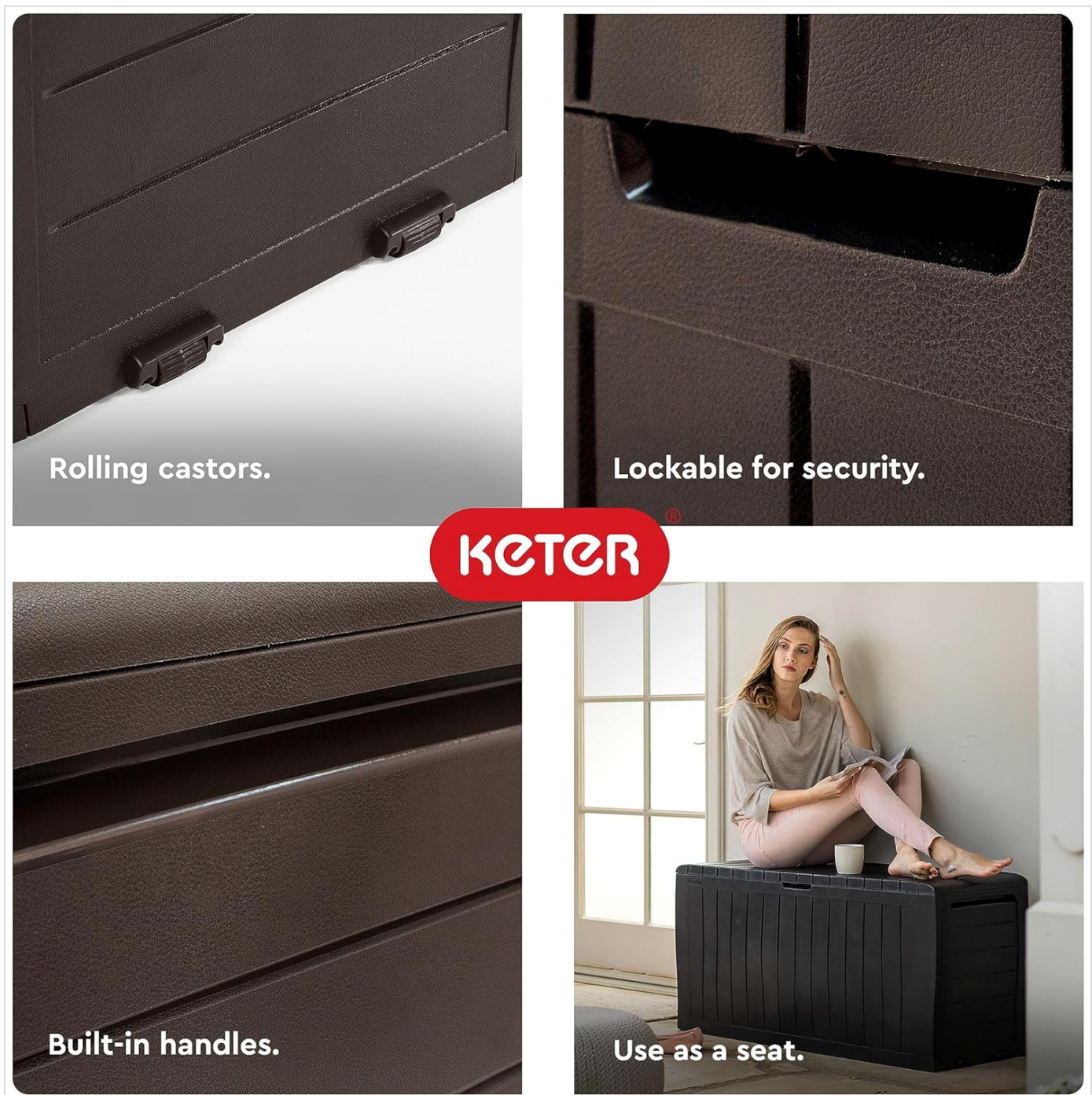
Image: Collage of close-up images highlighting features of the Keter Marvel Plus deck box: rolling castors, lockable mechanism, built-in handles, and the box being used as a seat.