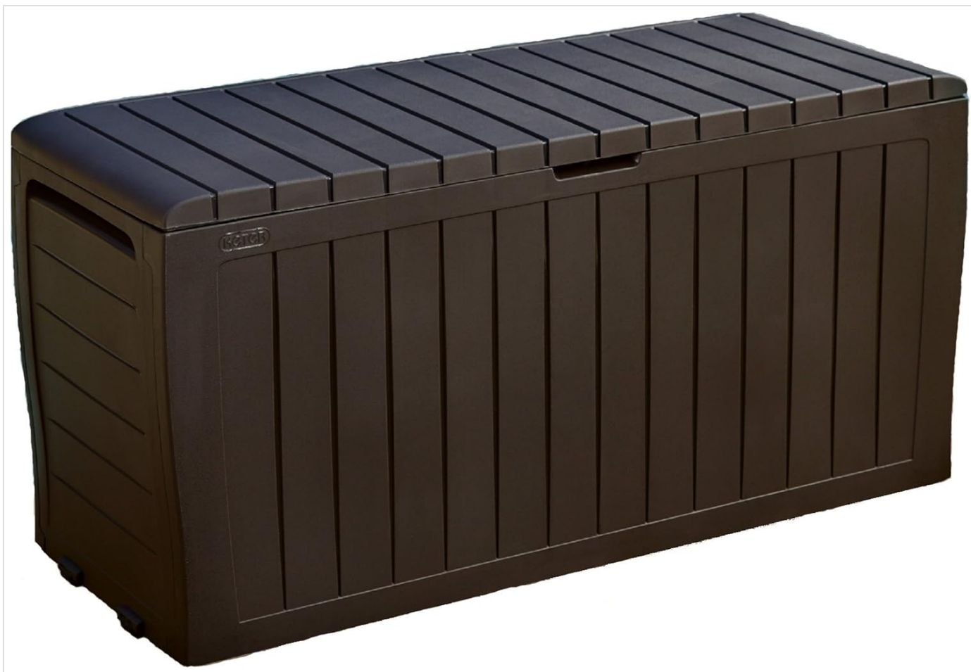
Image: Keter Marvel Plus 71 Gallon Resin Outdoor Storage Box in brown.