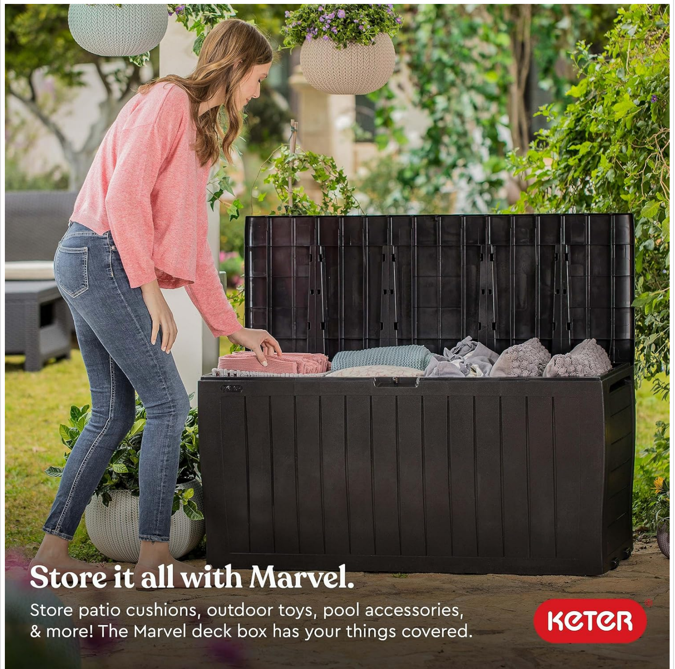
Image: A person organizing items inside the Keter Marvel Plus deck box, demonstrating its storage capacity for patio cushions, outdoor toys, and pool accessories.