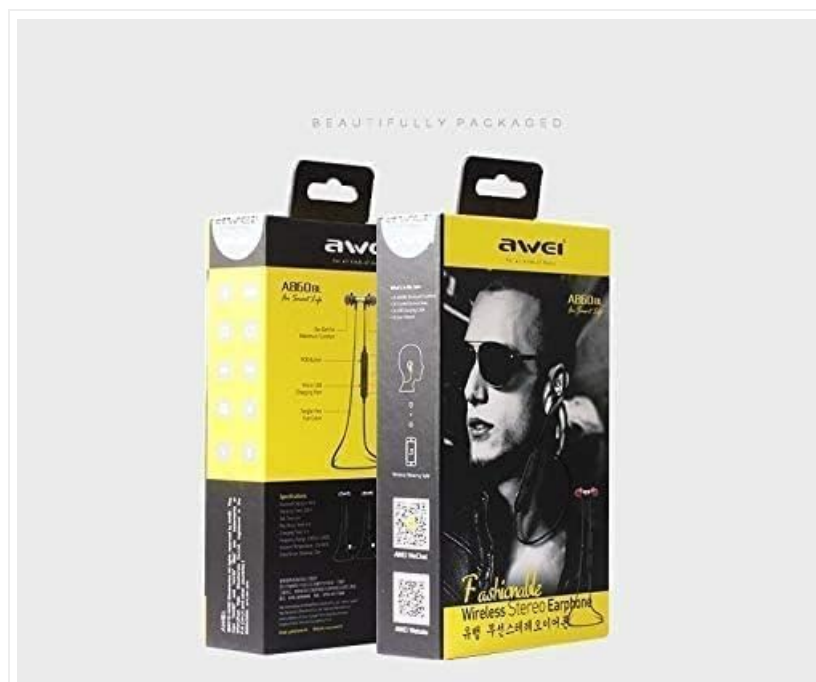
Image: The retail packaging for the Awei A860BL-BK Bluetooth In-Ear Earphones, showing the product and its features.