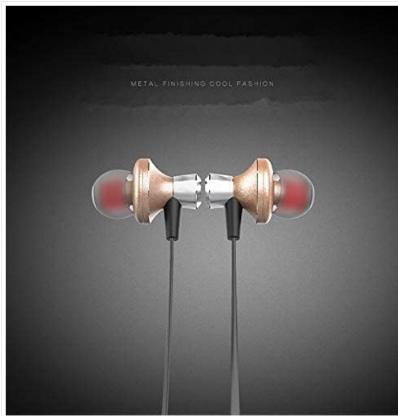
Image: A close-up view of the Awei A860BL-BK earphones, highlighting the earbud design and cable.

Image: The Awei A860BL-BK Bluetooth In-Ear Earphones, showcasing their sleek design and in-ear form factor.