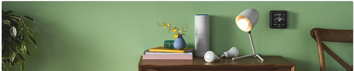
Figure 6: The T5 Smart Thermostat integrates with popular smart home platforms.

The T5 Smart Thermostat is compatible with various smart home ecosystems, including Amazon Alexa, Apple HomeKit, Google Assistant, IFTTT, and Cortana. This allows for voice control and integration into broader smart home routines.