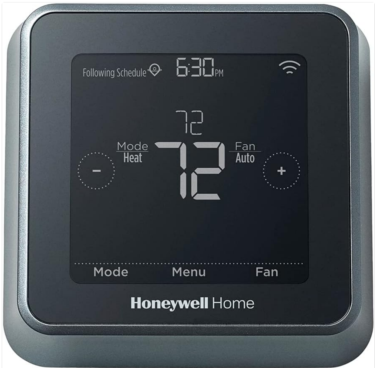
Figure 1: Front view of the Honeywell Home T5 Smart Thermostat.