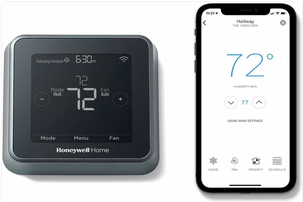
Figure 4: The T5 Smart Thermostat and its companion mobile application.

Video 1: Overview of the Honeywell Home RCHT8610WF2006 Thermostat, including its features and basic operation.