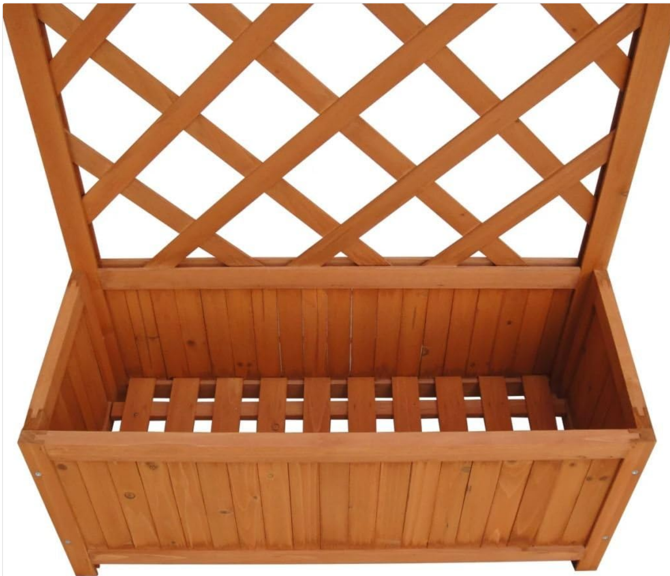
Image: Top-down view of the planter box, showing the internal slatted base for drainage and space for soil.