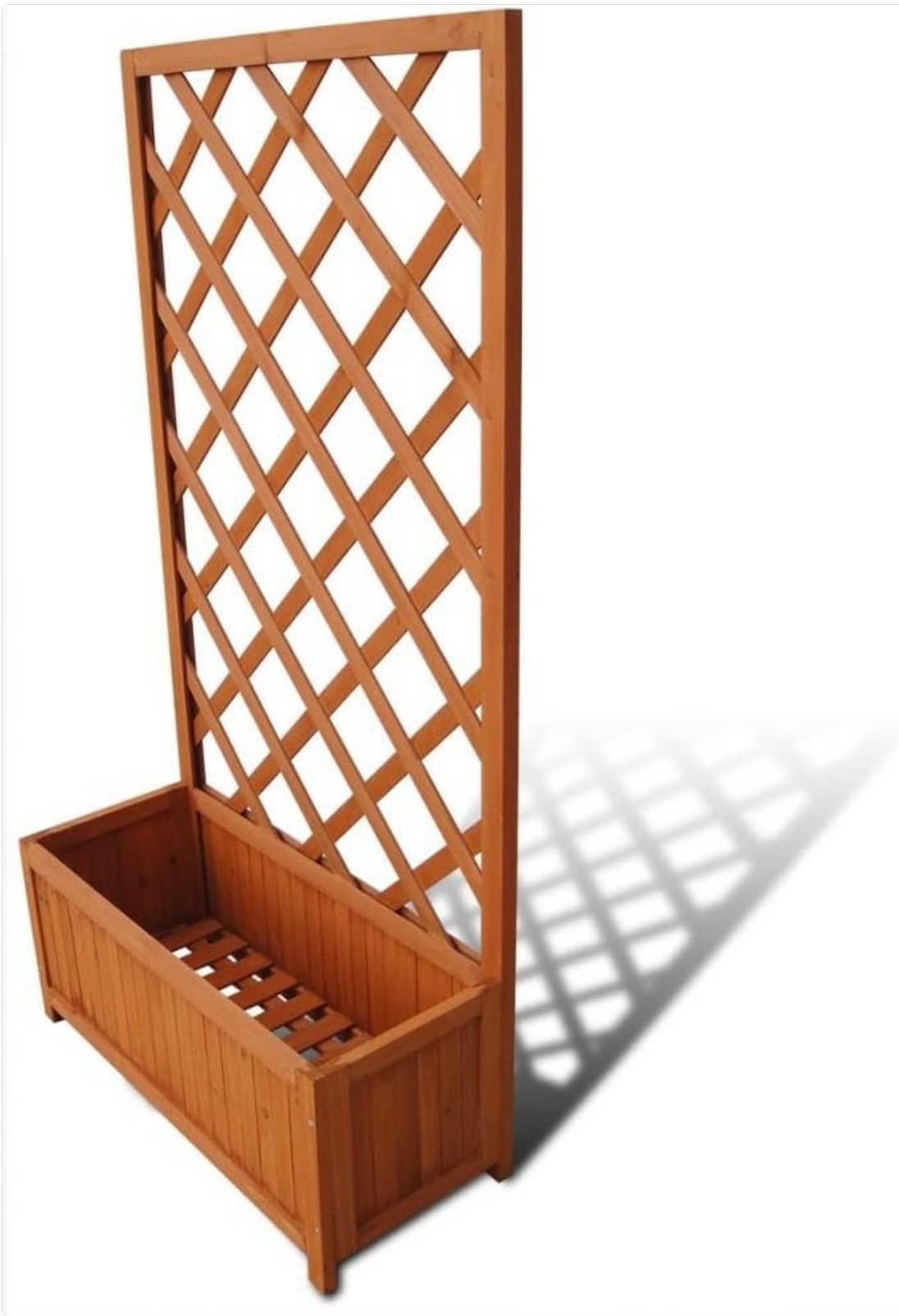
Image: Front view of the vidaXL Garden Planter with Trellis, showcasing its wooden construction and slatted design.