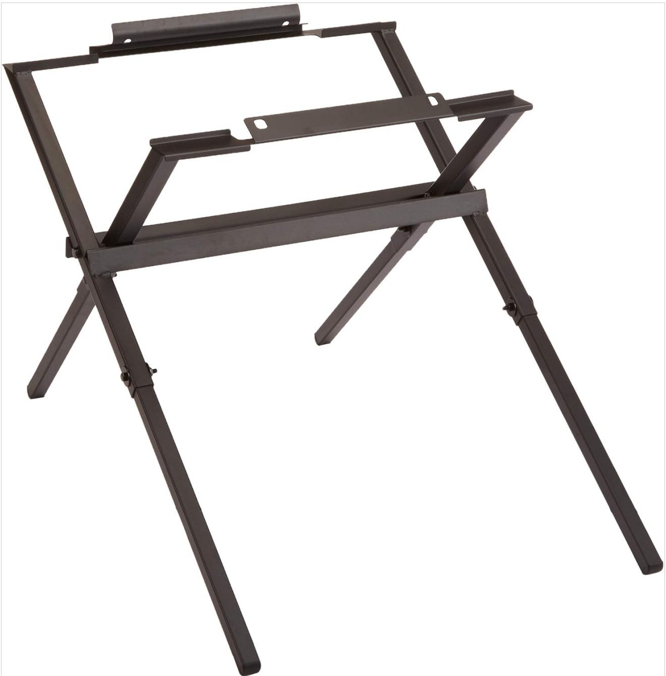
Image: The table saw stand fully unfolded, showing its stable, X-frame design. This configuration is ready for a table saw to be mounted.