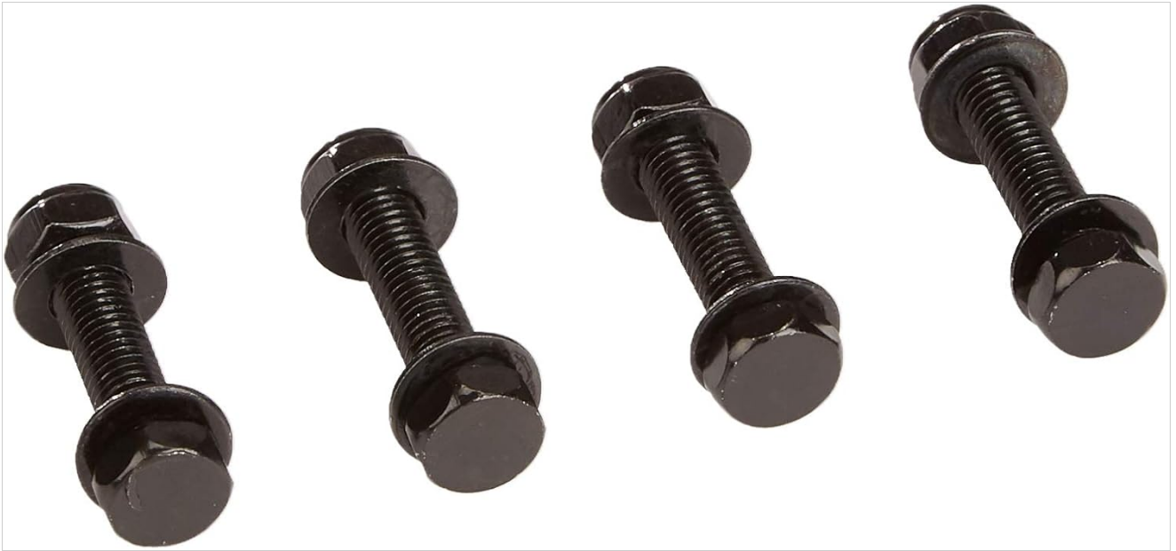
Image: Included mounting hardware, consisting of bolts, washers, and nuts, essential for securely attaching the table saw to the stand's integrated support bar hardware holes.