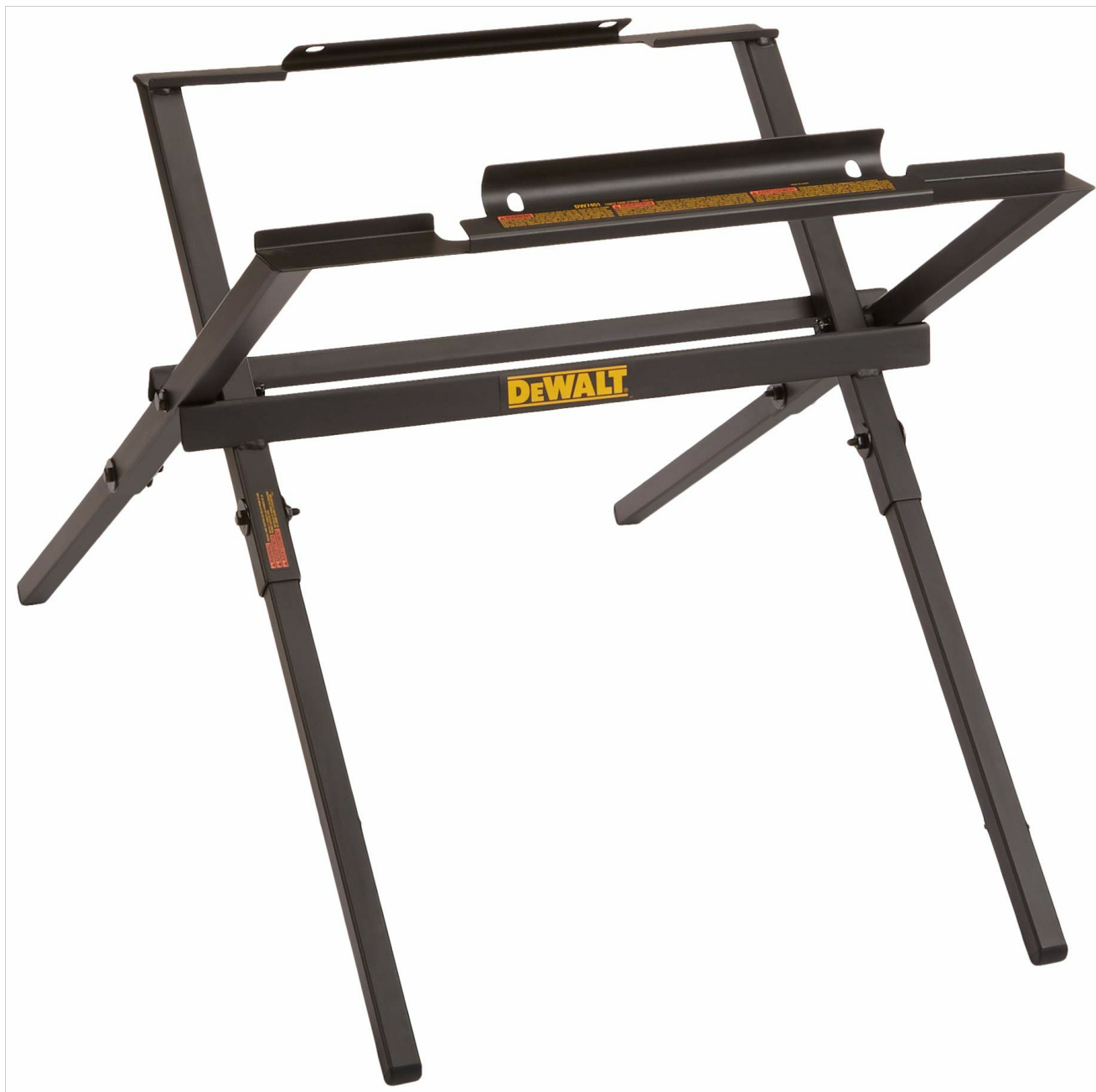
Image: The DEWALT DW7451 Table Saw Stand in its unfolded, operational configuration. This stand provides a stable base for compatible DEWALT table saws.