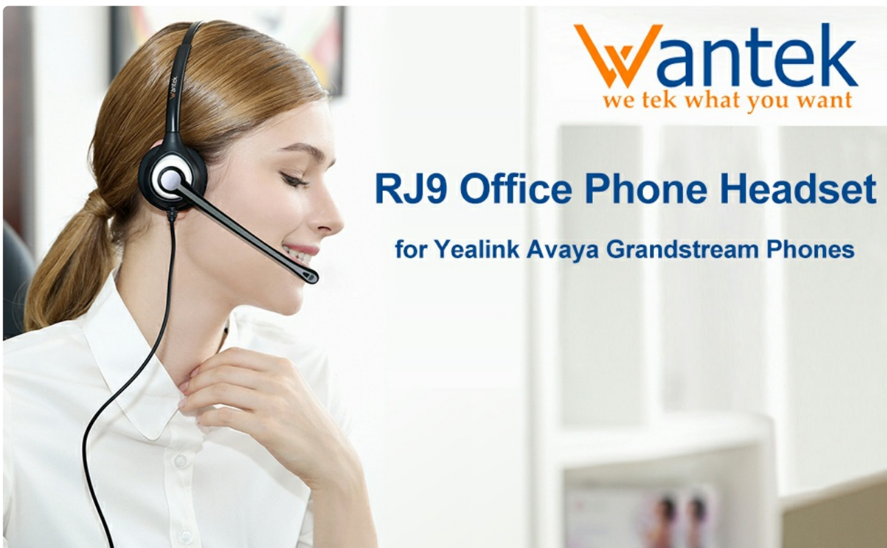
Image 4.1: A visual representation of the headset's broad compatibility with various phone brands, including a note that it is not for computers or cell phones.

Important: If your phone model is not listed, please contact Wantek for compatibility advice before purchase.