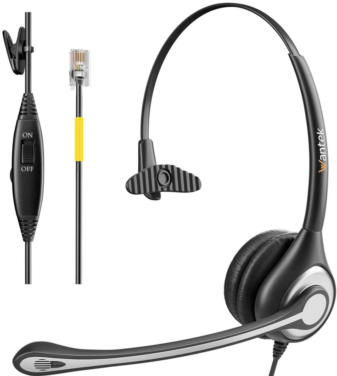
Image 1.1: Wantek RJ9 Wired Phone Headset, showing the earpiece, microphone boom, and in-line controls.