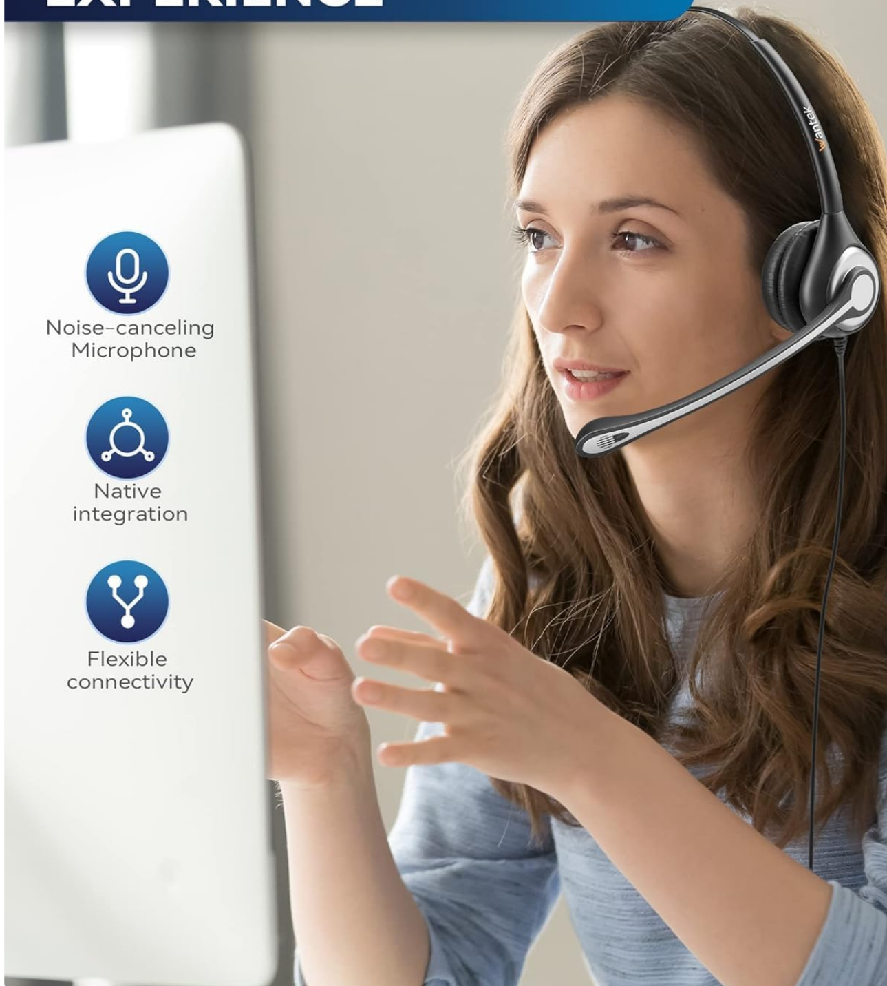
Image 2.1: A user wearing the Wantek headset, highlighting the clear audio experience.