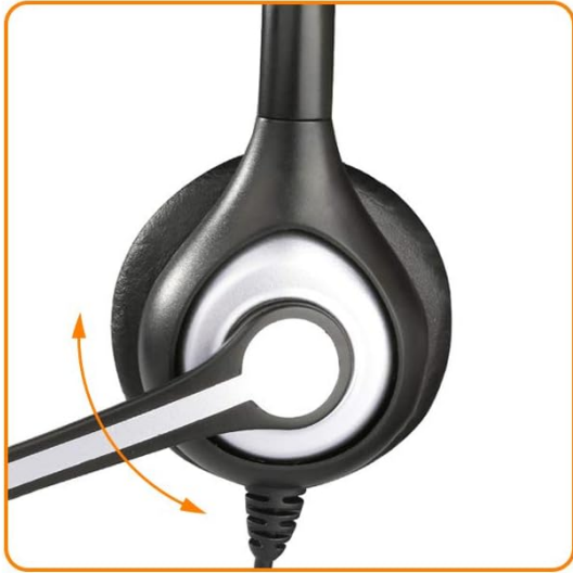
330° Rotatable Microphone Arm