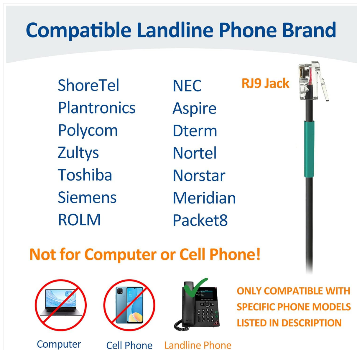
Figure 1: Visual representation of compatible landline phone brands and non-compatible devices. The image clearly indicates that the headset is designed for landline phones with an RJ9 jack and should not be used with computers or cell phones.

If your phone model is not listed, please contact Wantek for compatibility advice before purchase.