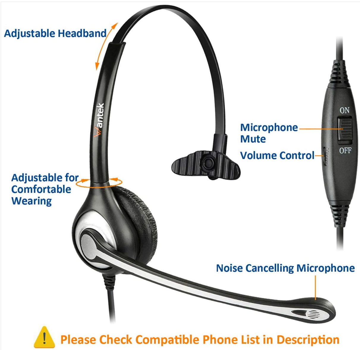
Figure 2: Overview of headset features including adjustable headband, in-line controls for microphone mute and volume, and the noise-cancelling microphone.