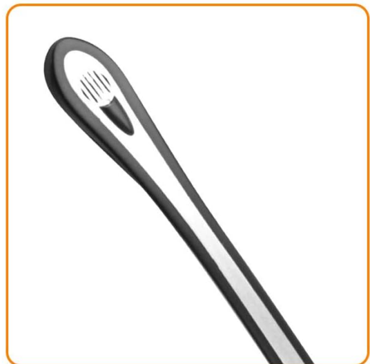
Noise Cancelling Microphone