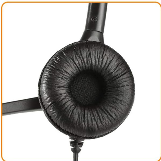
Soft Leatherette Ear Cushion