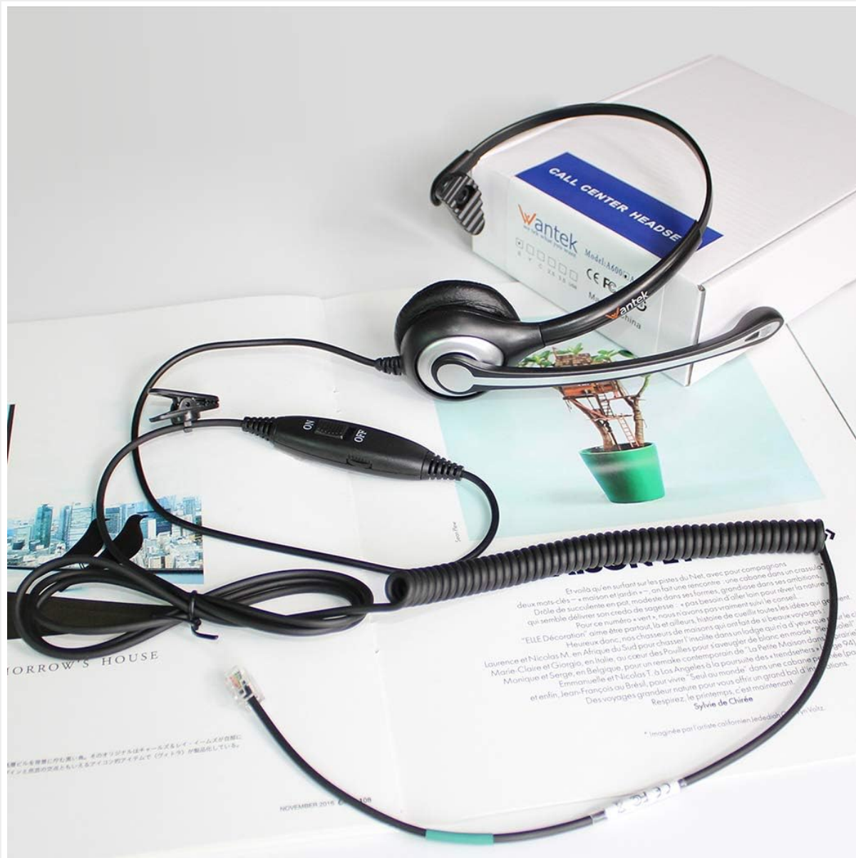
Figure 4: The Wantek F600S2 headset, including the coiled cord with in-line controls and the RJ9 connector, displayed with its packaging and a manual.