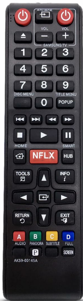
Image: Front view of the AK59-00145A remote control, showing all buttons and layout.