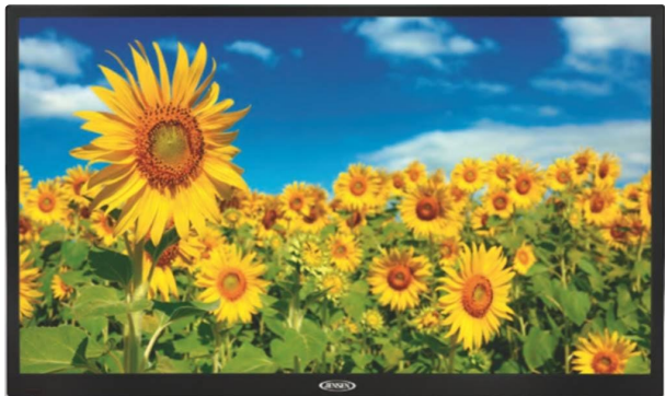
Front view of the Jensen JE2415 24-inch LED TV, showcasing its display with a vibrant image.