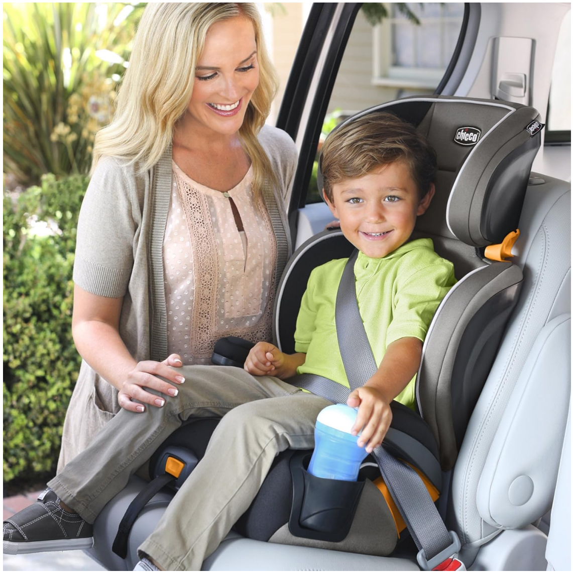
Figure 4.1: A child correctly seated and secured in the Chicco KidFit Zip Booster, demonstrating proper belt fit.