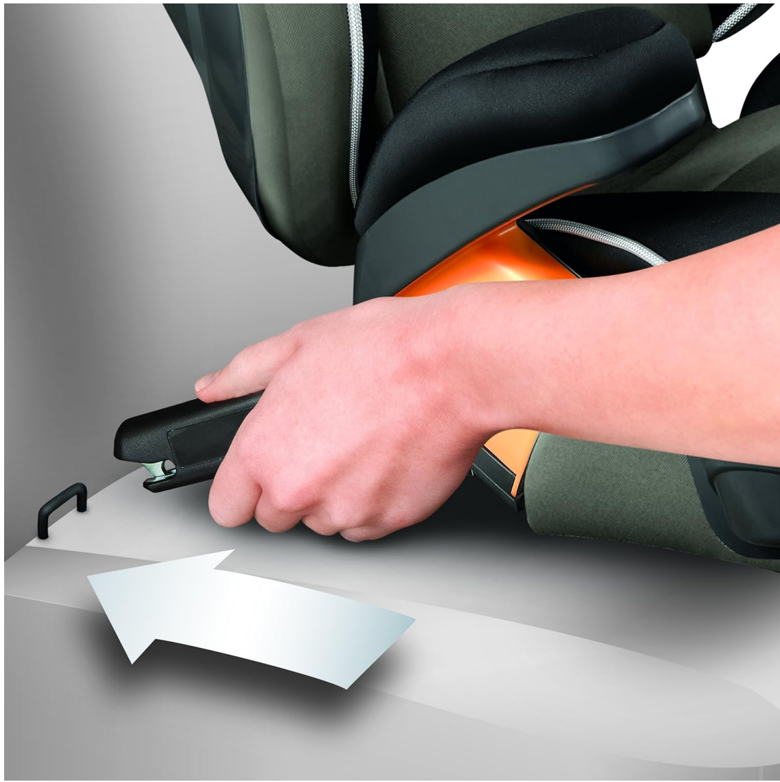
Figure 3.3: Close-up view of a LATCH connector being attached to a vehicle's lower anchor bar.