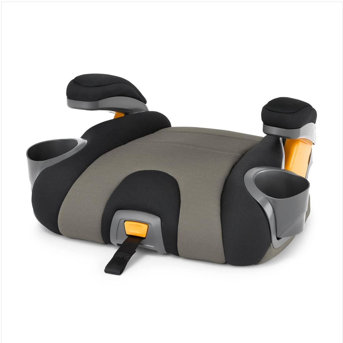
Figure 3.4: The Chicco KidFit Zip Booster configured as a backless booster seat.