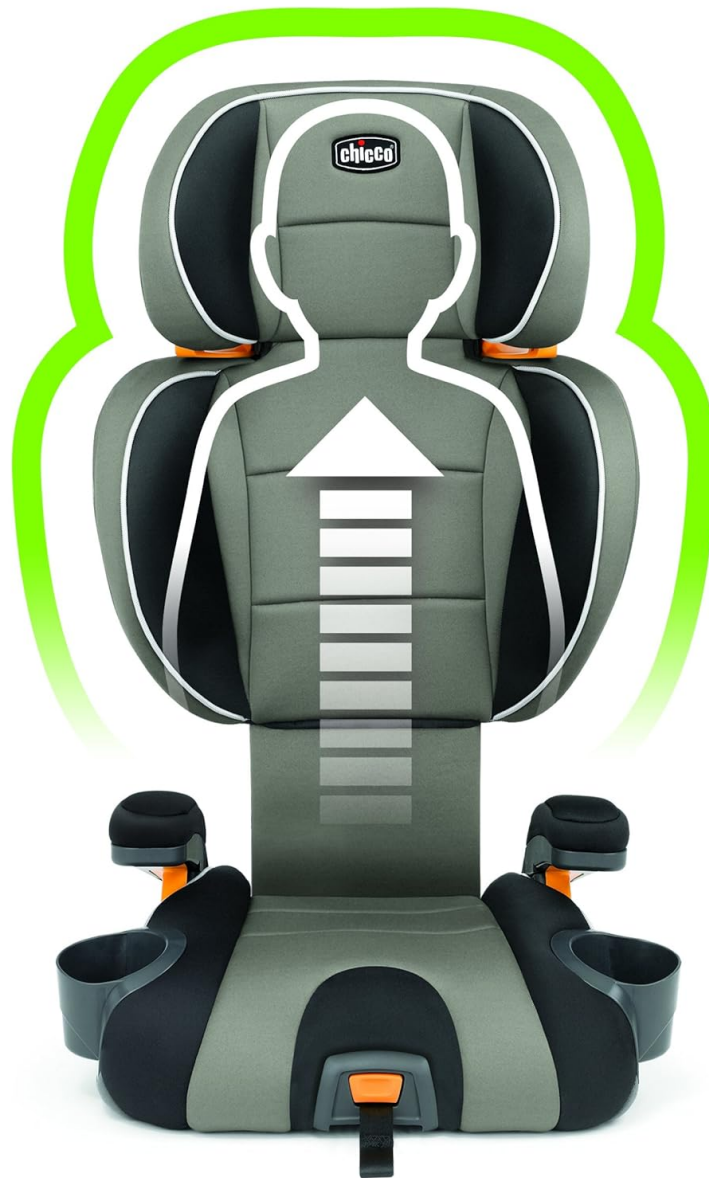
Figure 2.1: Visual representation of the DuoZone Side-Impact Protection system, highlighting head and shoulder coverage.