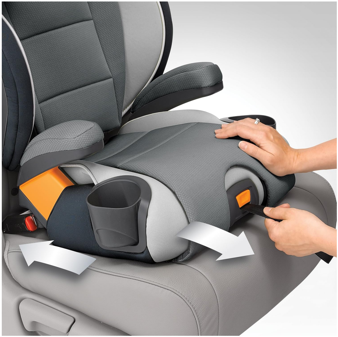
Figure 3.2: A hand demonstrating the use of the SuperCinch LATCH strap to secure the booster seat firmly to the vehicle.