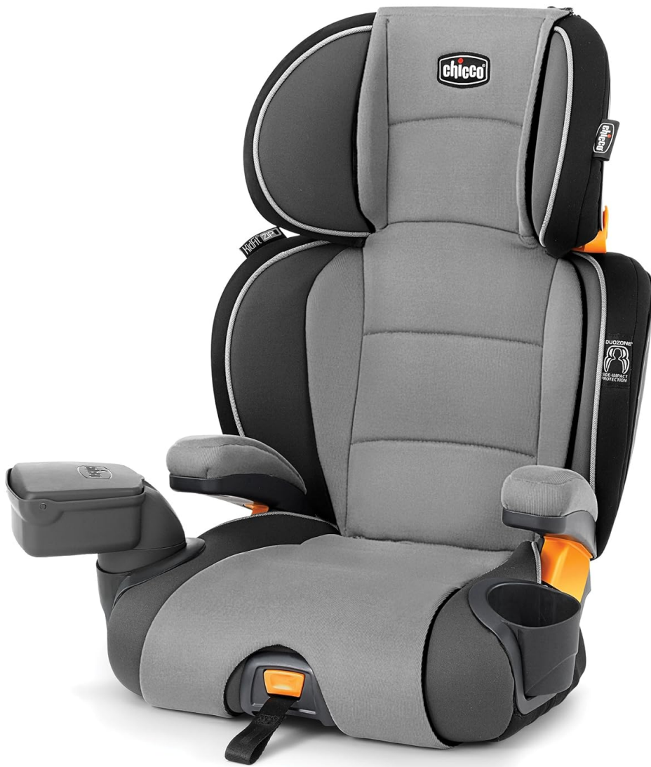
Figure 1.1: The Chicco KidFit Zip Booster Car Seat, showcasing its full high-back configuration in Spectrum color.