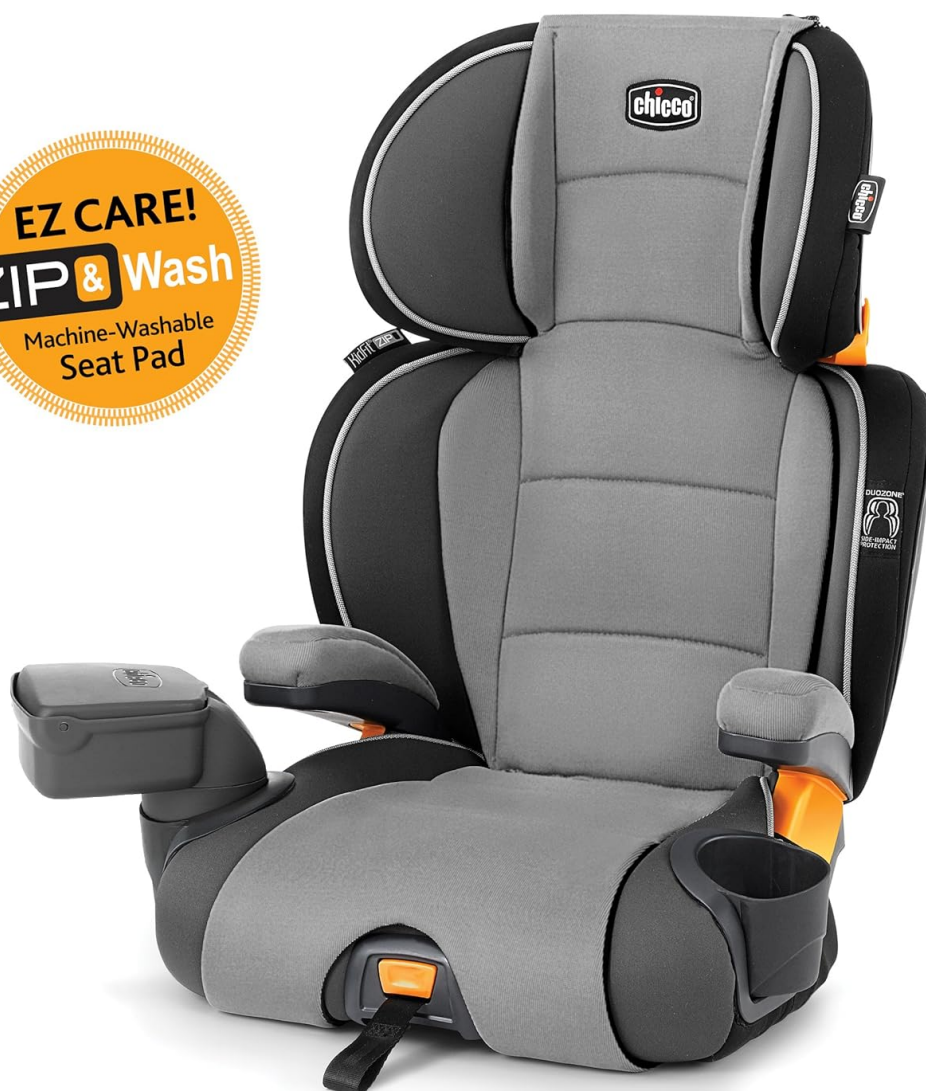
Figure 5.1: The Chicco KidFit Zip Booster highlighting the EZ Care Zip & Wash feature for easy cleaning of seat pads.