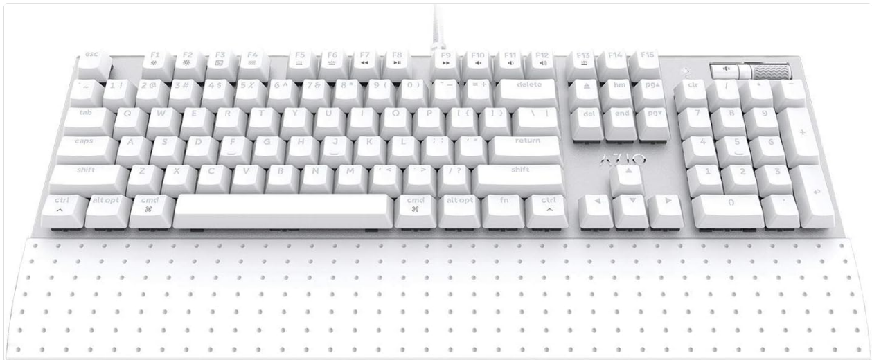
Top-down view of the Azio MK-MAC-U01 keyboard, showcasing its full layout.