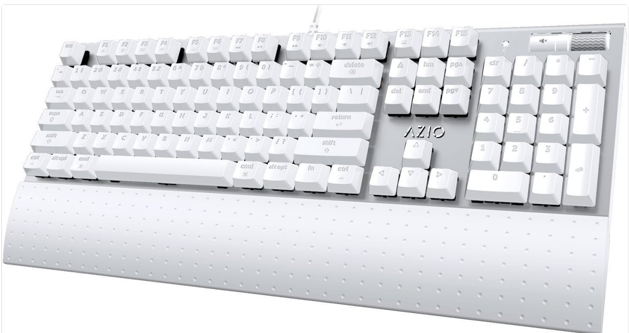
The Azio MK-MAC-U01 keyboard with the detachable palm rest attached.

The included palm rest can be attached to the front edge of the keyboard for enhanced ergonomic support during typing. Align the palm rest with the keyboard and gently push to secure it.