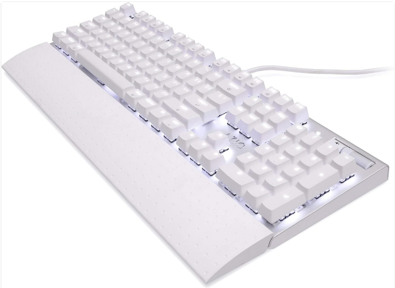
The Azio MK-MAC-U01 keyboard with its white LED backlight illuminated.