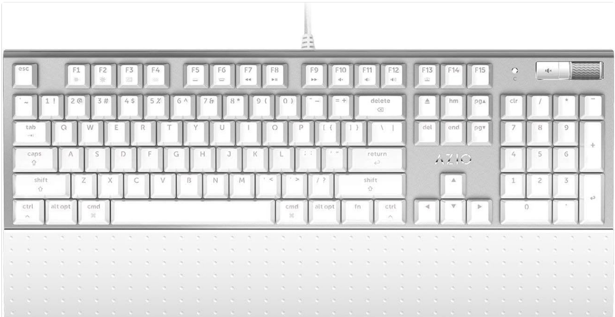
Close-up view of the Azio MK-MAC-U01 keyboard layout, highlighting Mac-specific function keys.

The keyboard features a dedicated Mac layout, including function keys for quick access to various Mac features such as Mission Control and Launchpad.