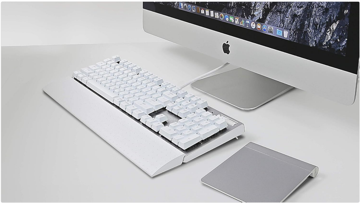
The Azio MK-MAC-U01 keyboard and included palm rest.