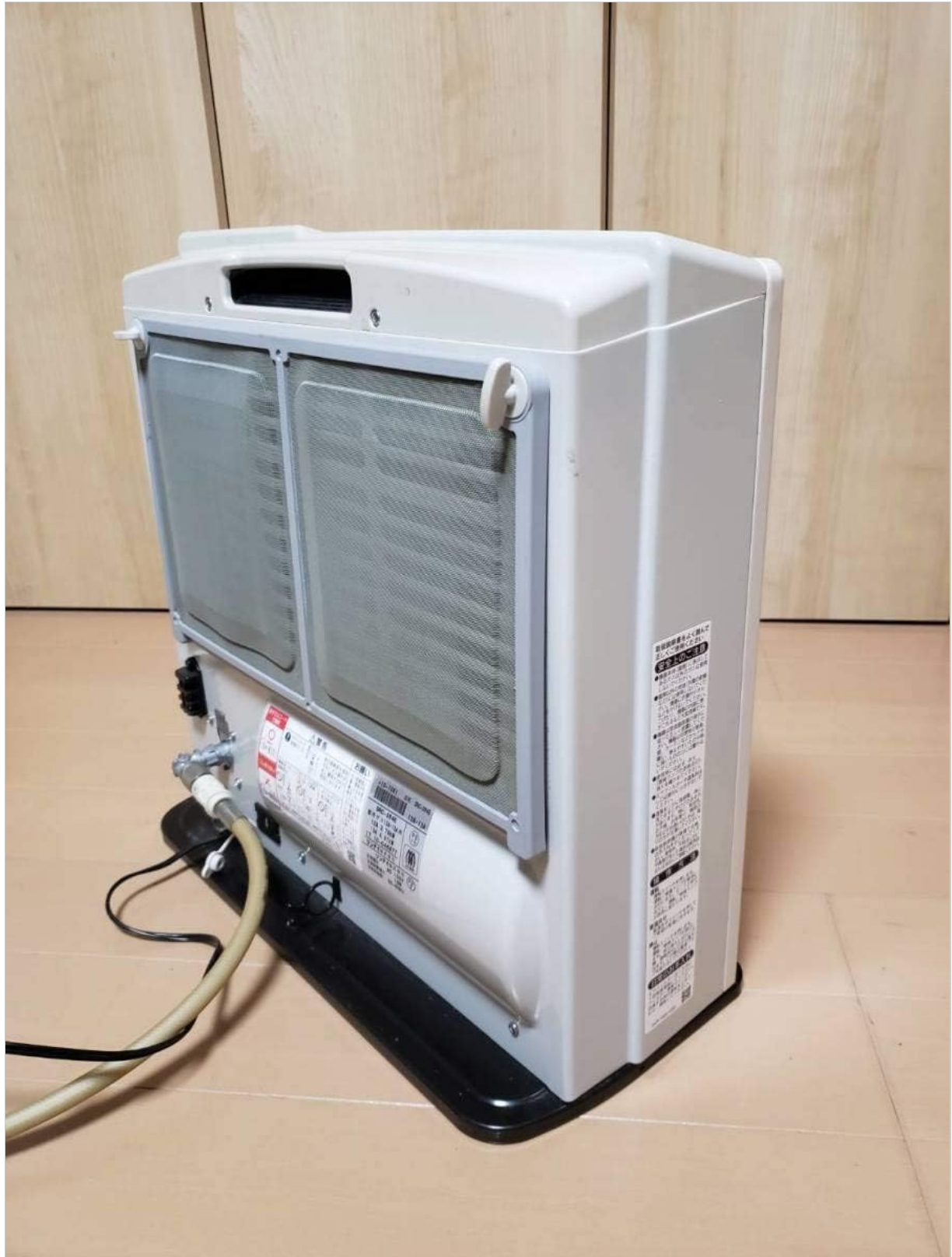
Image: Side view showing the gas connection and air intake.

This appliance must be connected to a suitable gas outlet for City Gas (12A/13A). Use only the gas hose provided or a certified gas hose. Ensure the connection is secure and free of leaks. It is recommended to have gas connections performed by a qualified professional.