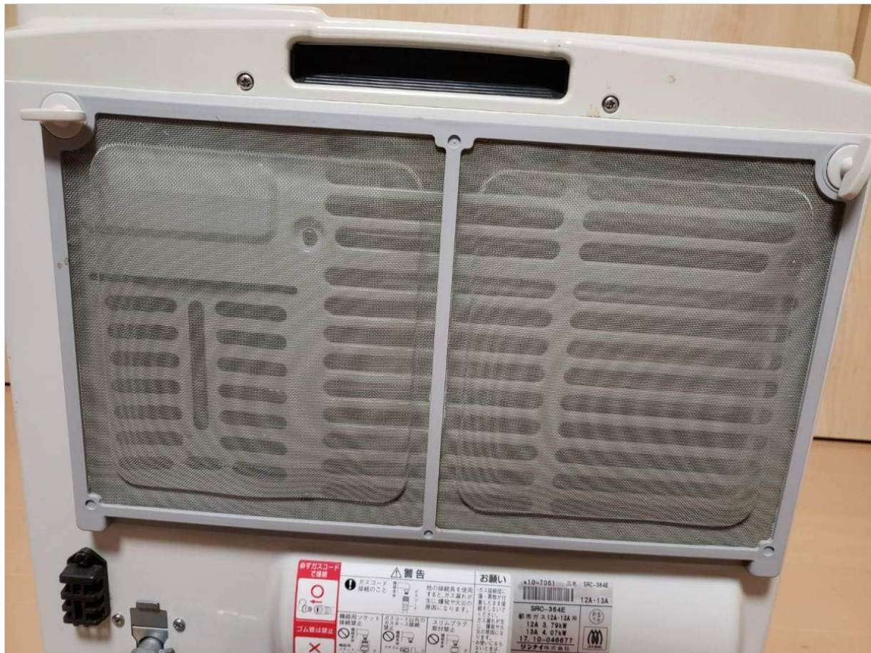
Image: Close-up of the air intake filter.