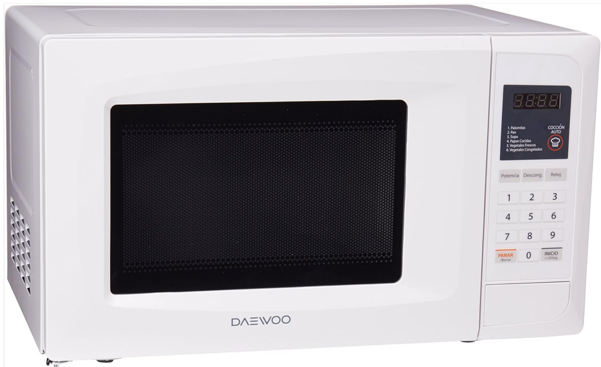
Figure 1: Front view of the Daewoo KOR-6LYB Microwave Oven, showcasing the door, window, and control panel on the right side.