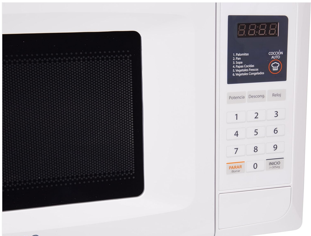
Figure 2: Close-up of the control panel, featuring a digital display, number pad, power settings, defrost options, and auto-cook menu buttons.