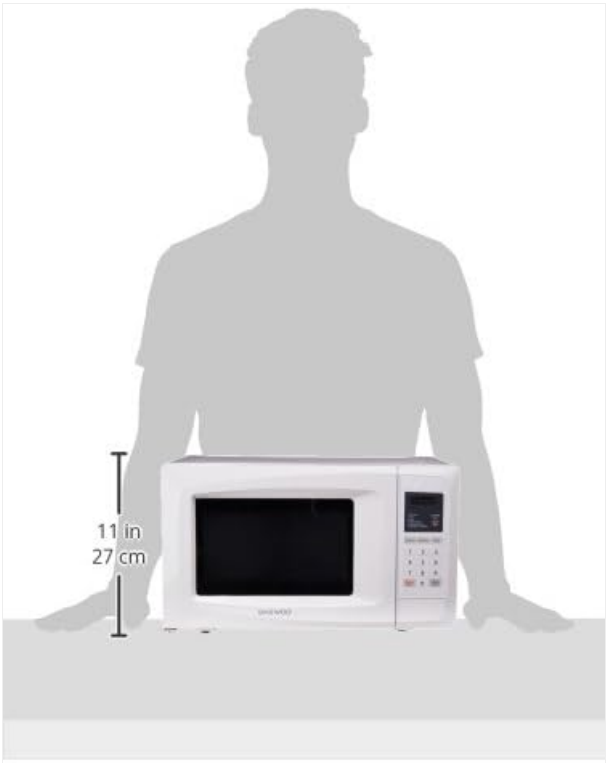
Figure 3: Diagram illustrating the dimensions of the Daewoo KOR-6LYB Microwave Oven, showing a height of 11 inches (27 cm).