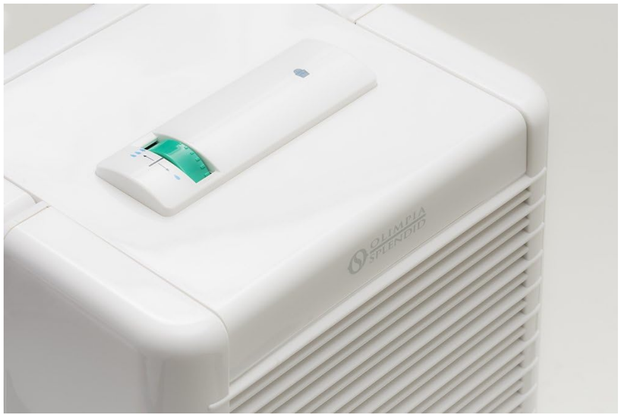
Image 2: Close-up of the top control panel, featuring the mechanical dial for easy operation.