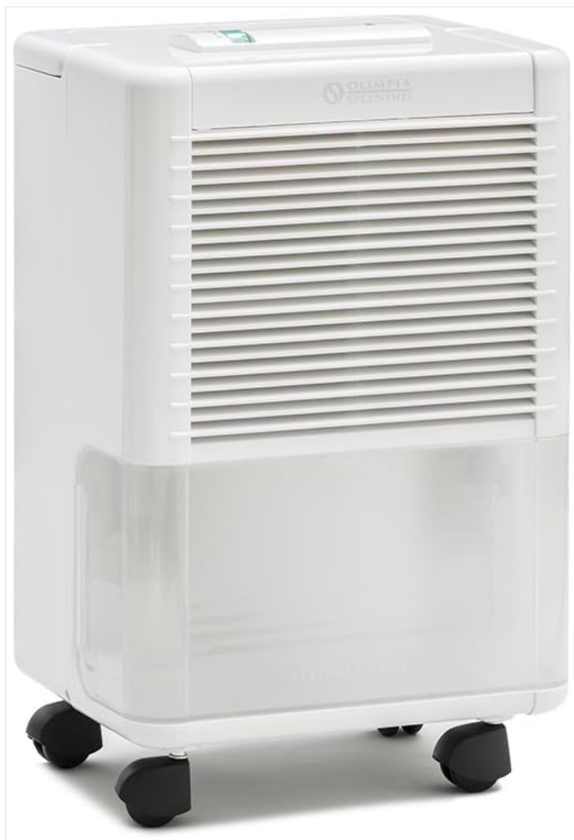
Image 1: Front view of the Olimpia Splendid 01667 Aqua Silent 14 Dehumidifier, showcasing its compact design and transparent water tank.