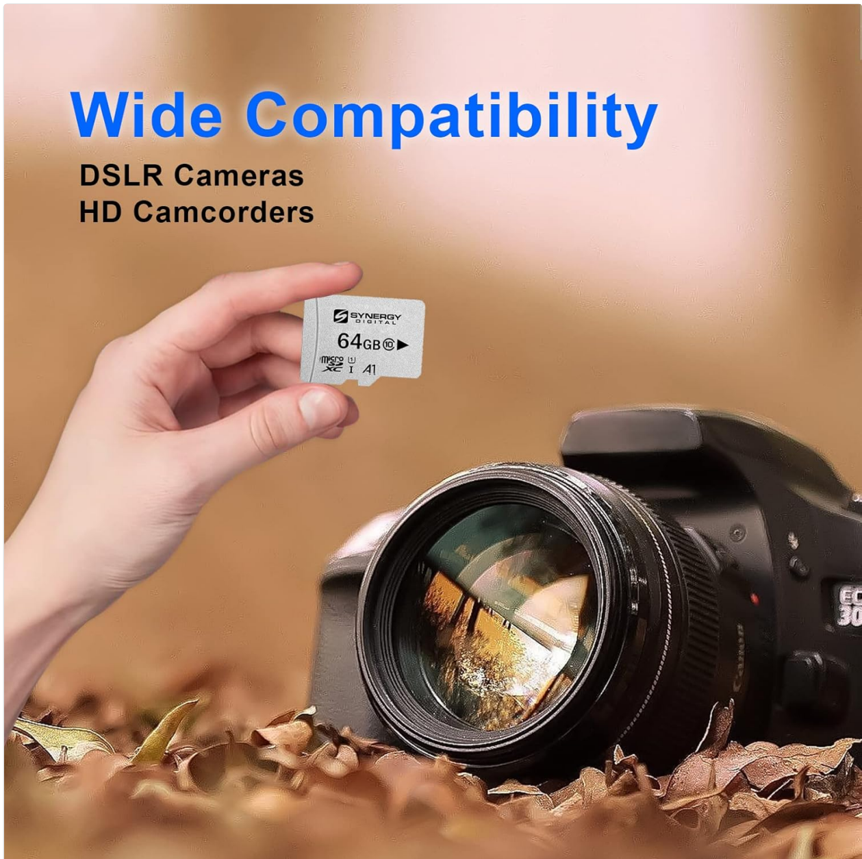
Image: A hand holding the Synergy Digital microSD card, with a DSLR camera and an HD camcorder in the background, illustrating its wide compatibility.

This microSDXC card is compatible with devices that support the SDXC standard. Always verify your device's specifications for memory card compatibility before use.