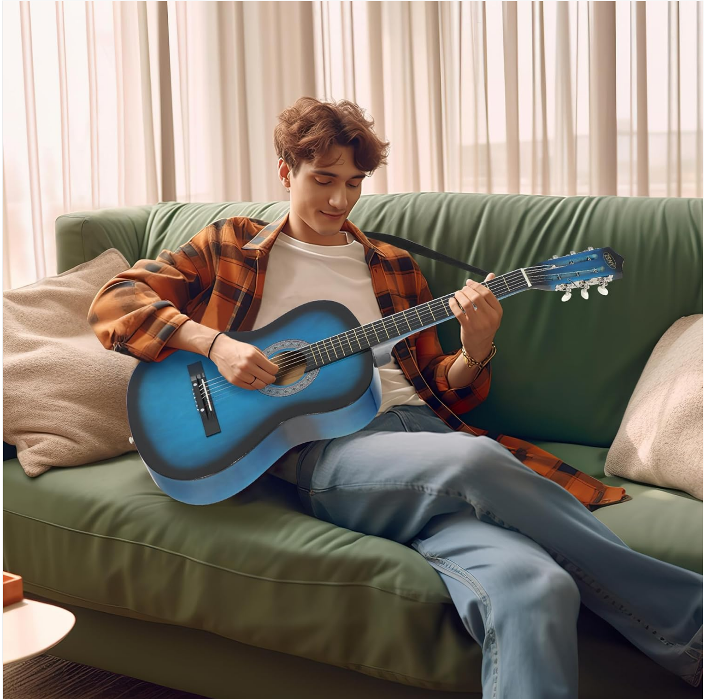
Image 4.1: Proper posture for playing the acoustic guitar while seated.

For right-handed players, the guitar body rests on your right leg (when seated) or against your body (when standing with a strap). Your right arm should rest comfortably over the top of the guitar body, allowing your hand to reach the strings over the soundhole. Your left hand supports the neck and frets the strings.