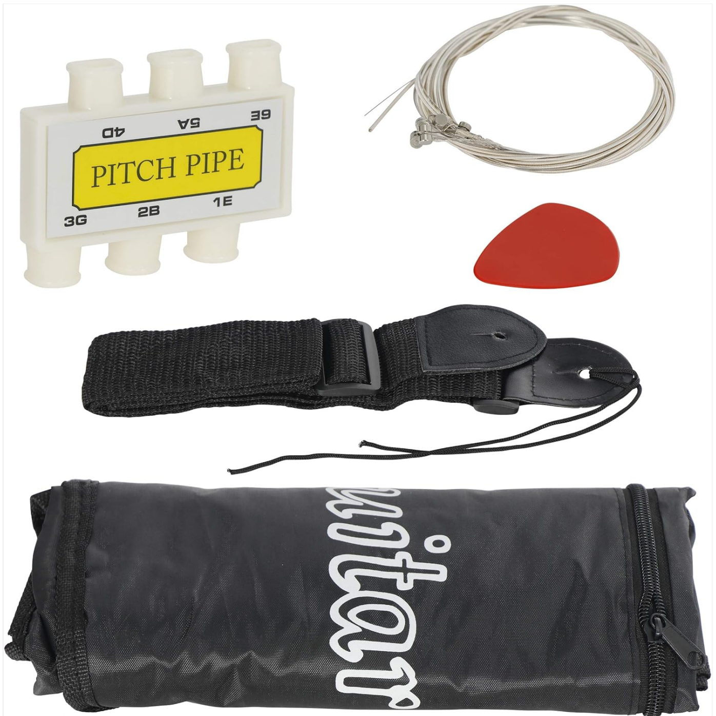
Image 2.1: Detailed view of the included accessories: pitch pipe, extra strings, guitar pick, adjustable strap, and nylon carrying case.