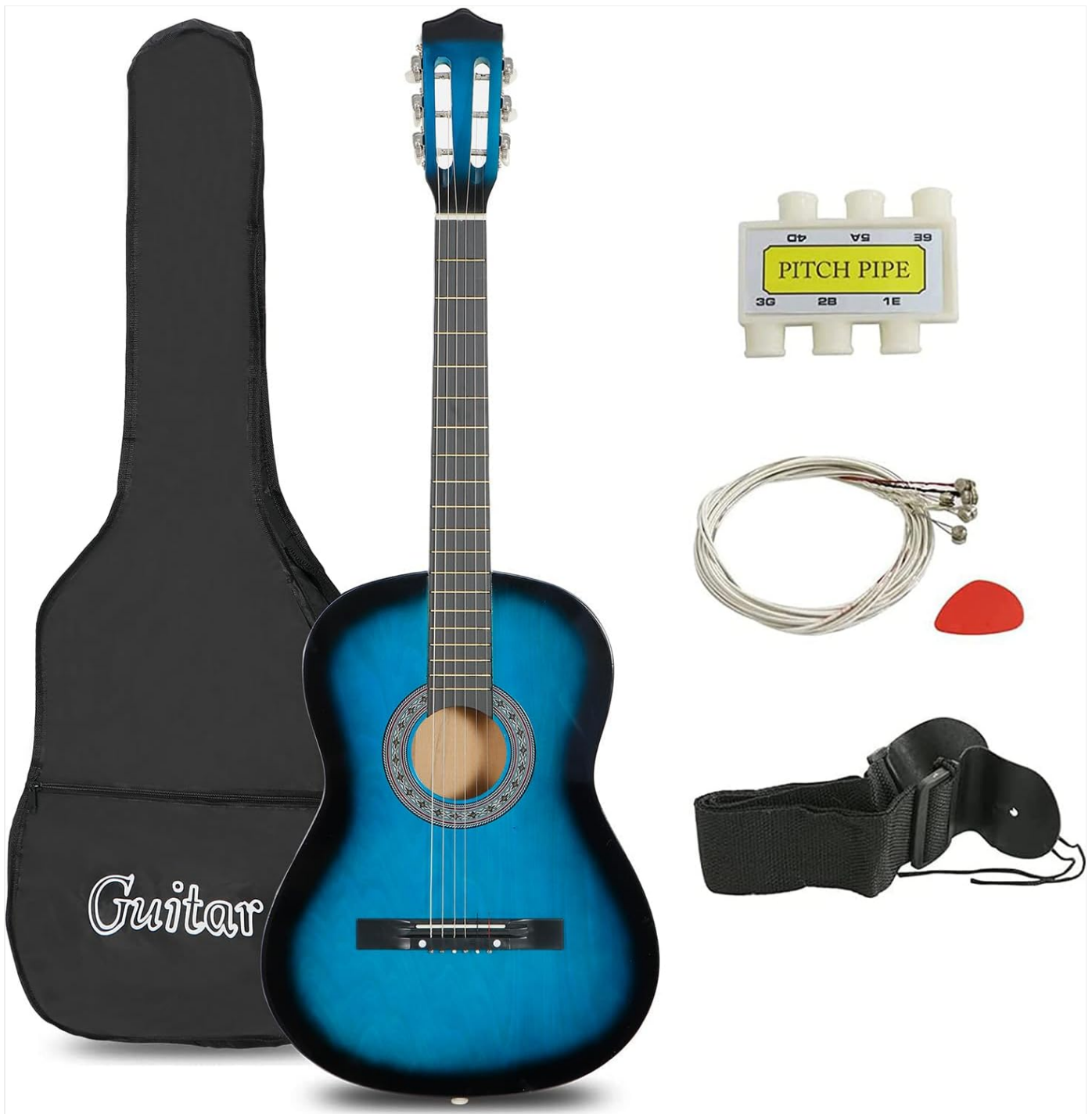
Image 1.1: The ZENY 38-inch Acoustic Guitar Beginner's Kit, including the blue guitar, carrying case, pitch pipe, extra strings, strap, and pick.