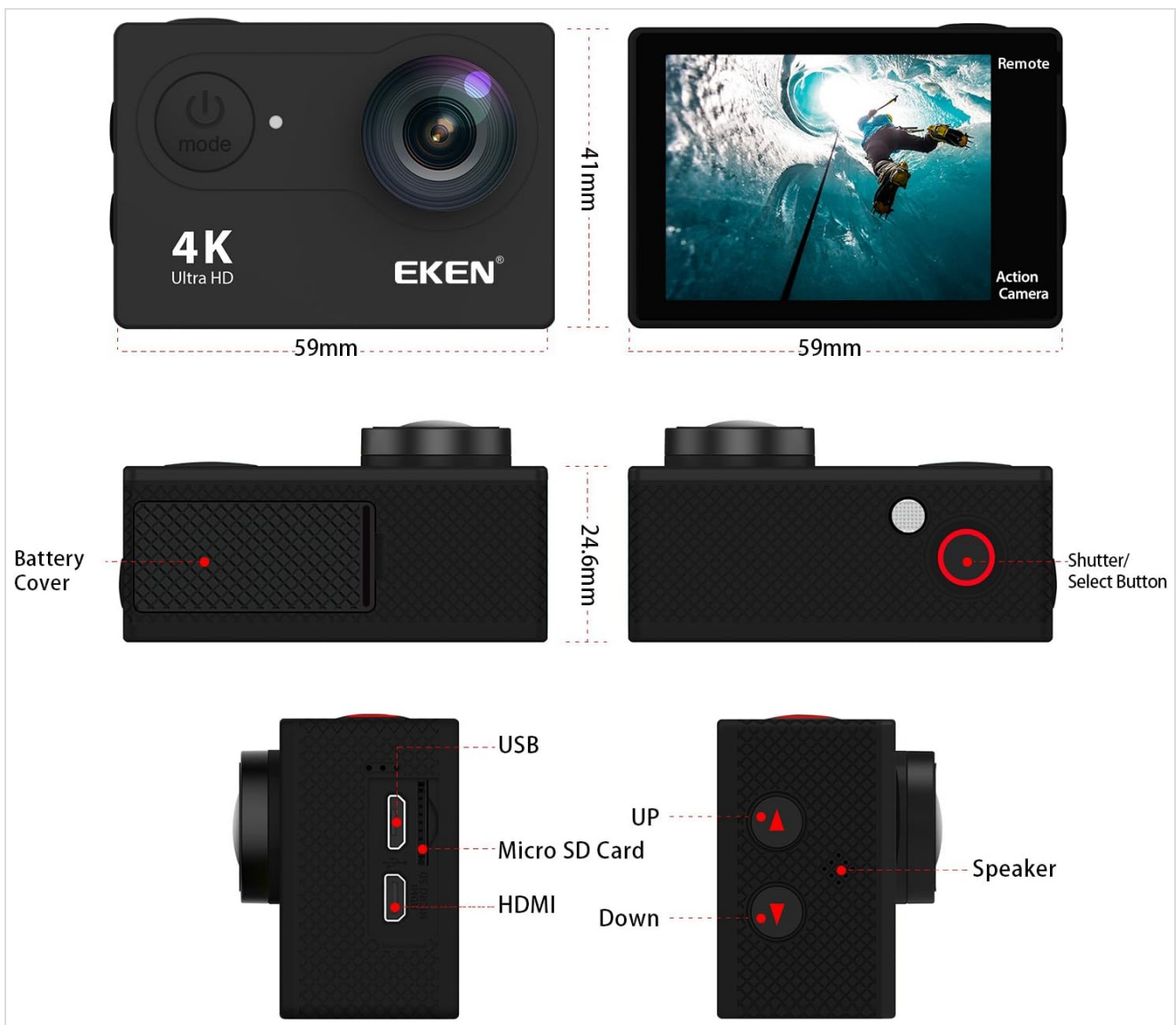
Image: The EKEN H9R Action Camera is suitable for a wide range of activities, including cycling, paragliding, climbing, canoeing, snowboarding, and diving.