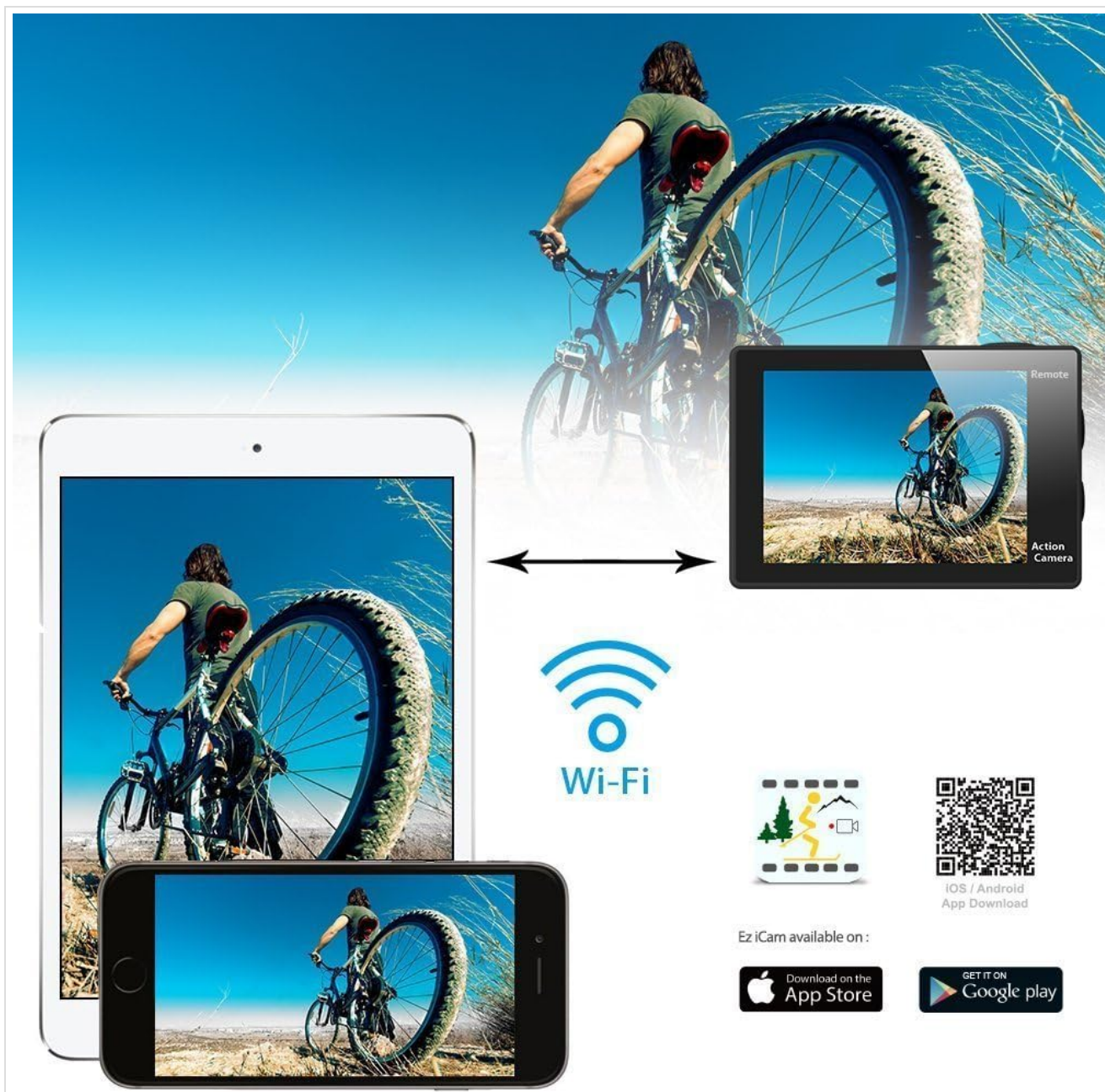
Image: The camera's built-in WiFi feature enables seamless connection to a smartphone for control and content transfer.