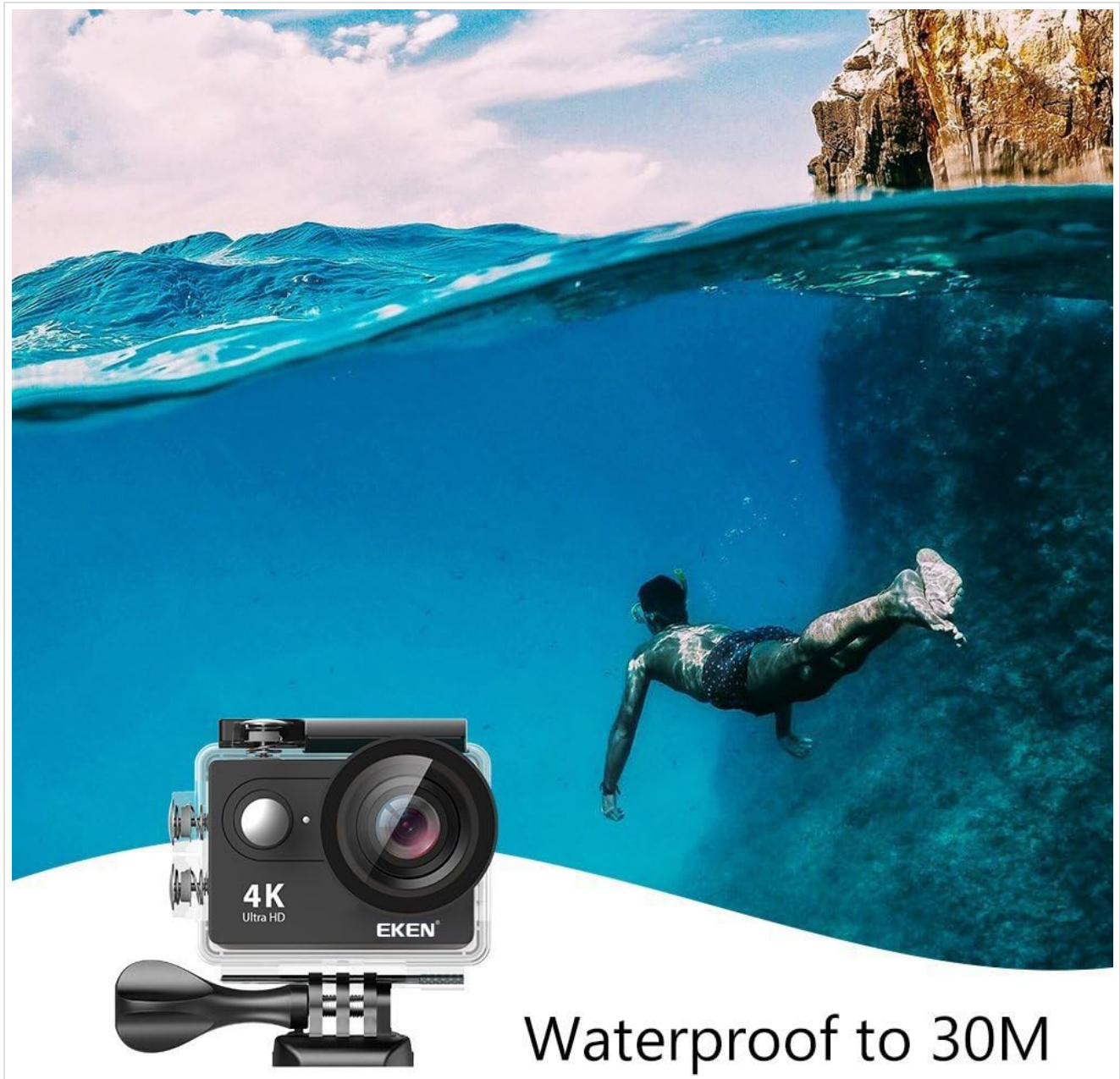
Image: The EKEN H9R Action Camera shown in its waterproof housing, capable of submersion up to 30 meters.