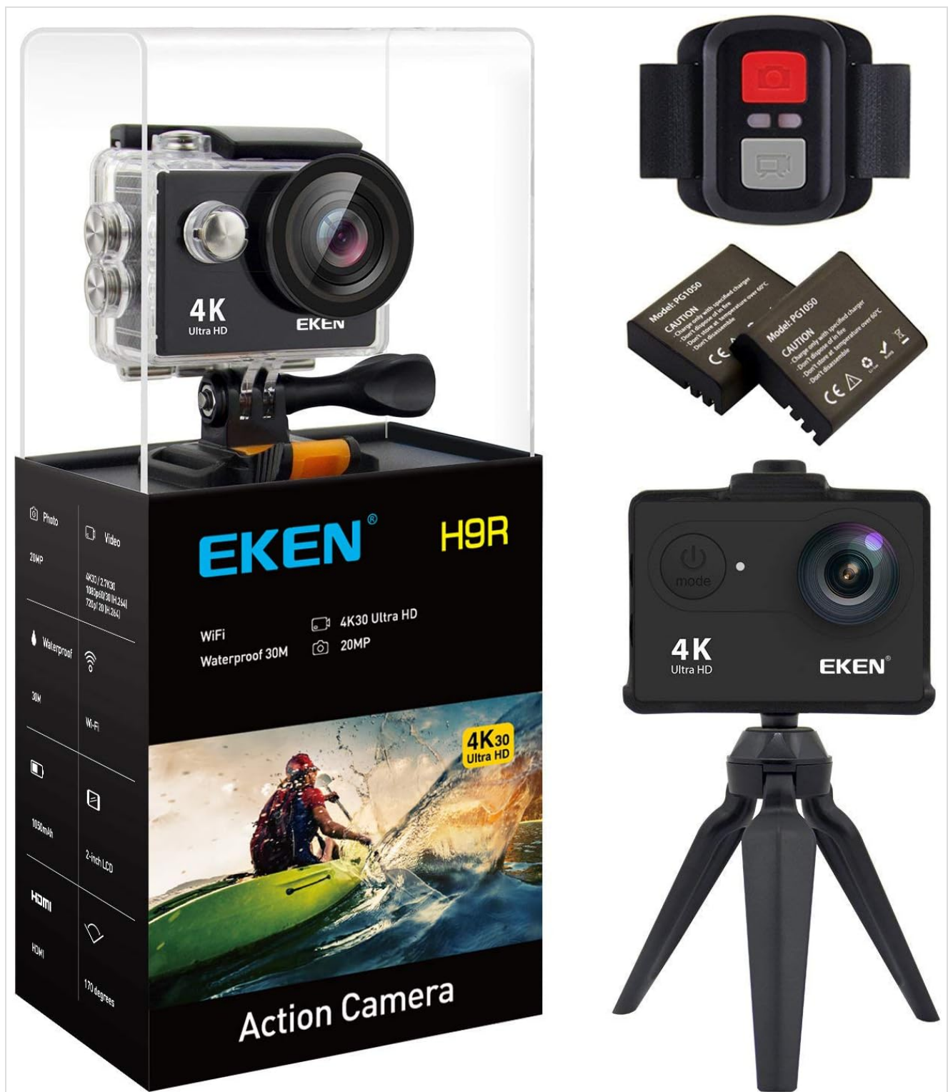
Image: The EKEN H9R Action Camera, ready for setup and use.