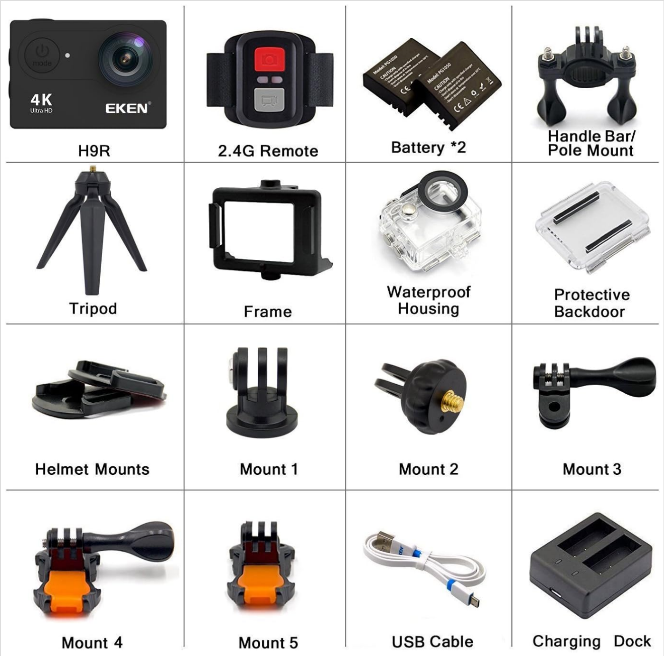
Image: Detailed view of the EKEN H9R Action Camera, highlighting its dimensions and port locations including USB, Micro SD, and HDMI.

EKEN provides a limited warranty for the H9R Action Camera against defects in materials and workmanship under normal use. For specific warranty terms, conditions, and duration, please refer to the warranty card included with your product or contact EKEN customer support directly.