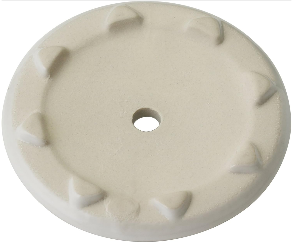
Image: Top view of the TOTO Urinal Drain Plate A66 #NW1, showing its circular shape and textured surface designed for efficient drainage.