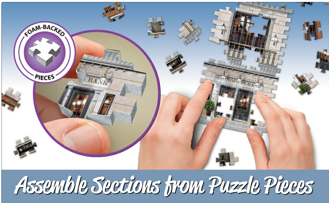
Figure 4.2: Assembling flat sections of the puzzle.