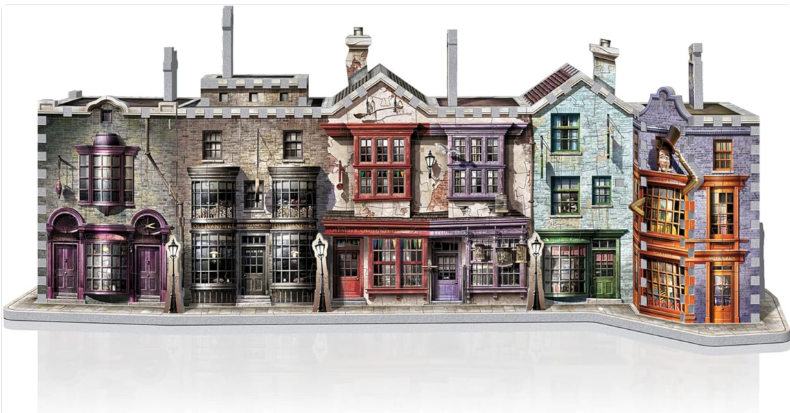
Figure 1.1: Front view of the assembled Diagon Alley 3D Puzzle.

This manual provides instructions for assembling the Wrebbit3D Harry Potter Diagon Alley 3D Puzzle. This 450-piece foam-backed jigsaw puzzle allows you to construct a detailed model of six legendary shops from Diagon Alley, including Ollivanders, Weasleys' Wizard Wheezes, Madam Malkin's, Flourish and Blotts, Eeylops Owl Emporium, and Quality Quidditch Supplies. The finished model features intricate designs, curved roofs, and layered façades, recreating the iconic wizarding street.