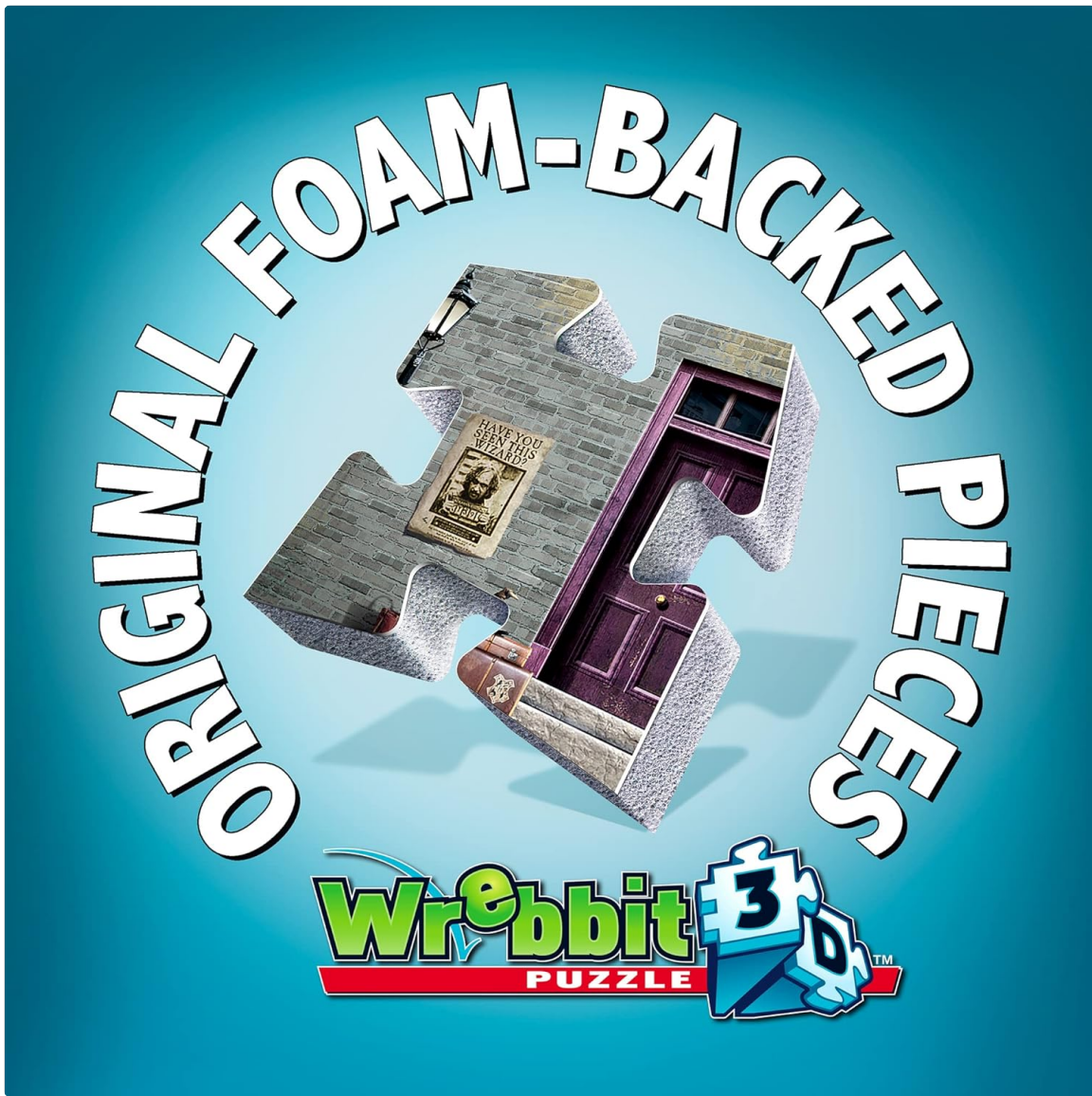
Figure 4.1: Example of foam-backed puzzle pieces.