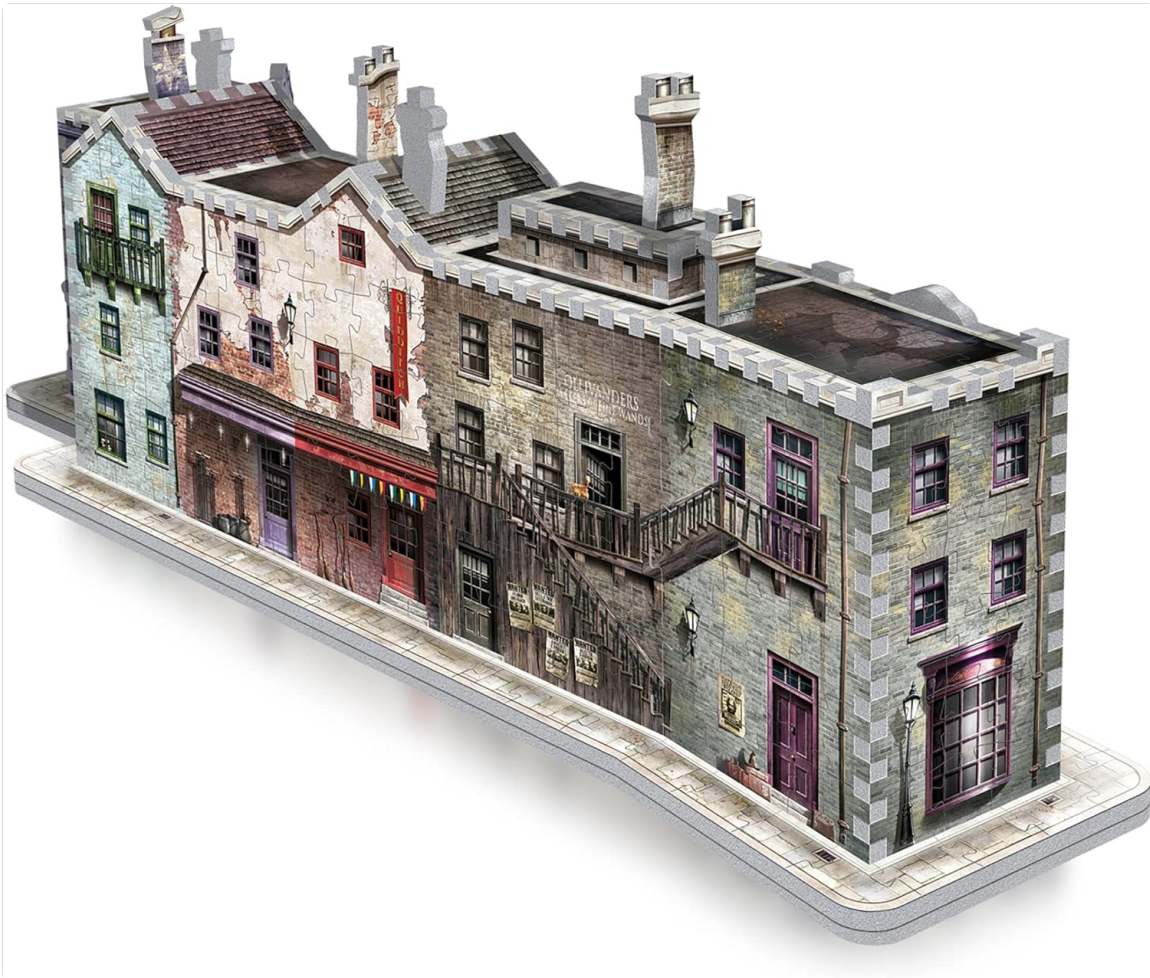
Figure 5.1: The assembled Diagon Alley puzzle as a display item.