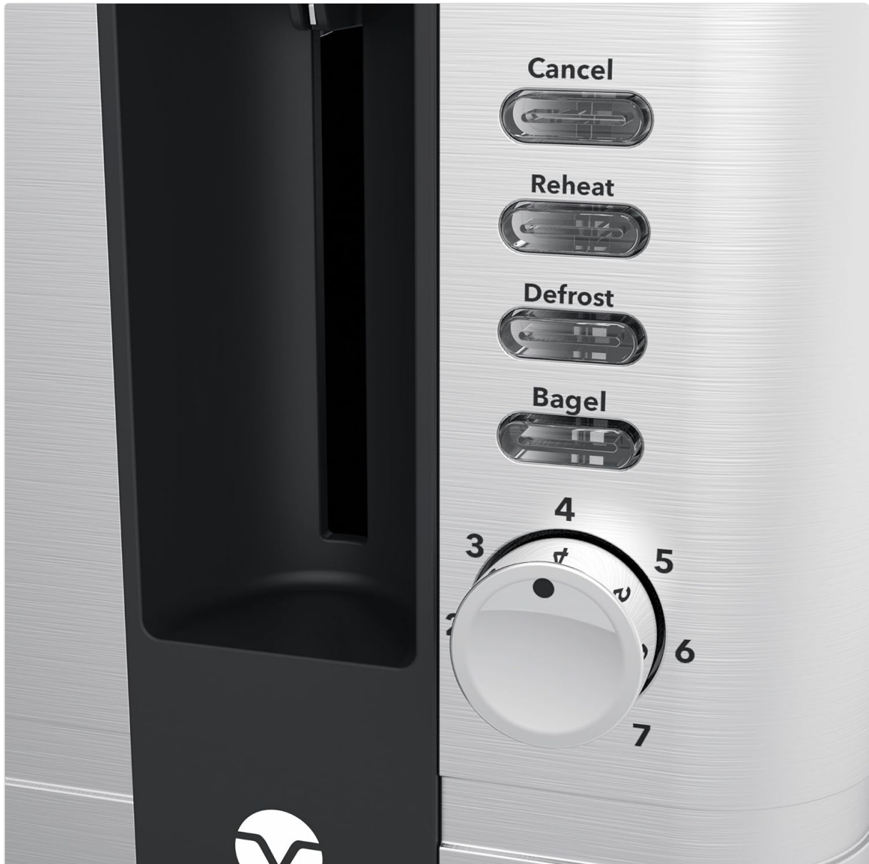
Image: Close-up view of the Vremi Toaster's control panel, showing the 'Cancel', 'Reheat', 'Defrost', and 'Bagel' buttons, along with the browning control dial numbered 1 through 7.