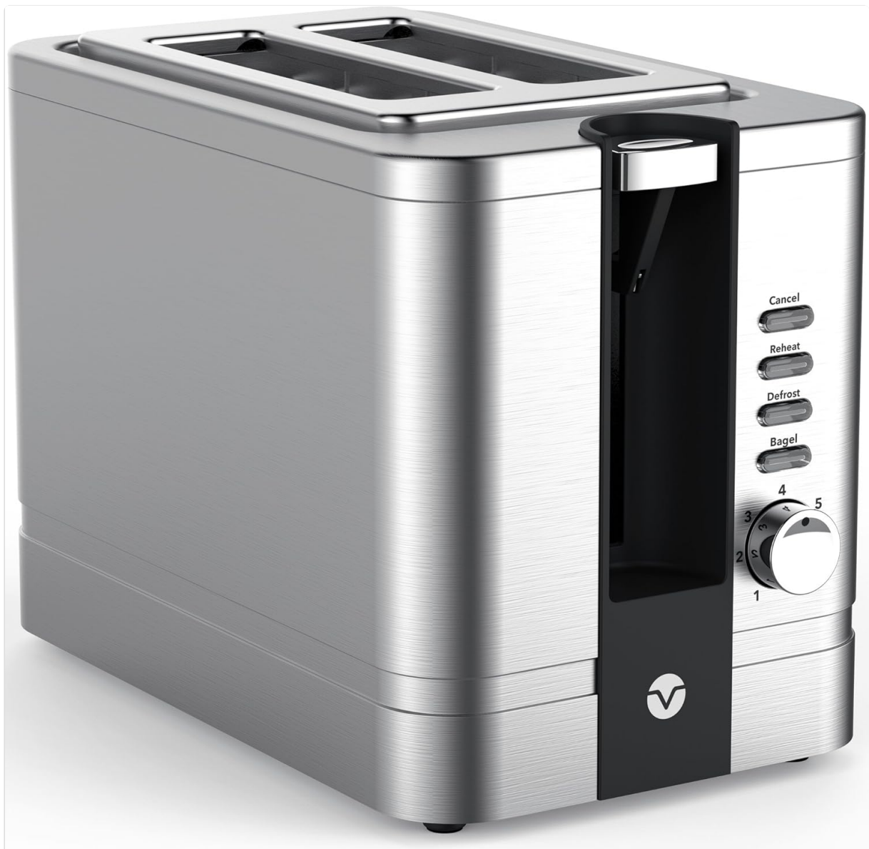
Image: Front-side view of the Vremi 2-Slice Stainless Steel Toaster, showcasing its brushed stainless steel finish, two wide toasting slots, control panel with buttons, and browning control dial.

The Vremi 2-Slice Stainless Steel Toaster is designed for efficient and consistent toasting of various bread types. It features wide slots, multiple toast settings, and convenient functions like Reheat, Defrost, and Bagel.