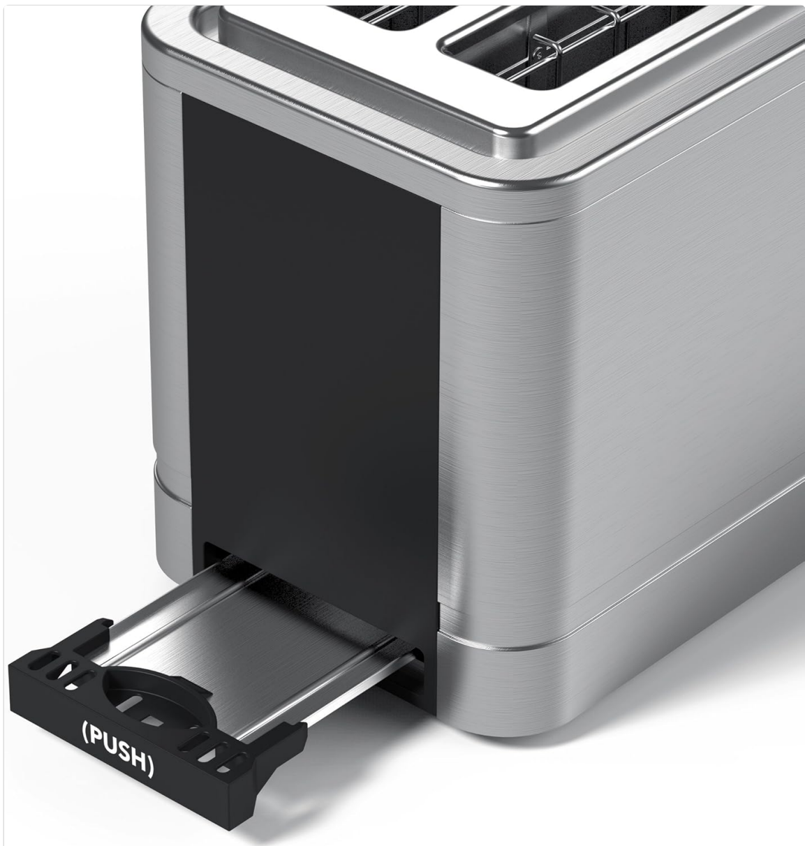
Image: View of the Vremi Toaster with its removable crumb tray partially pulled out from the side, labeled with "(PUSH)".

To remove accumulated crumbs, slide out the removable crumb tray located at the bottom of the toaster. Discard crumbs and wipe the tray clean with a damp cloth. Dry thoroughly before reinserting.